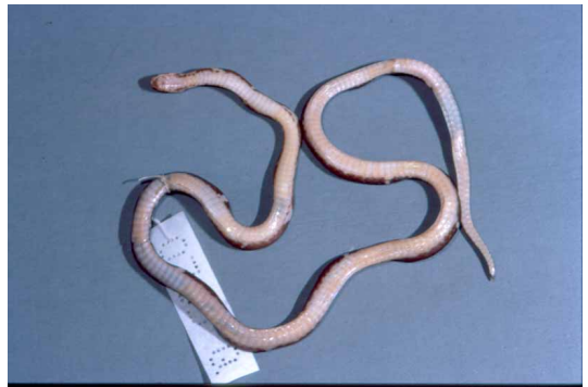
FIGURE 5. Ventral view of the body of the holotype QSMI 385.

1/1 postocular; no subocular; 7/7 SL; 1st SL small, 2nd and 3rd in contact with loreal, 3rd and 4th SL in contact with orbit, 5th to 7th SL large, 6th and 7th SL the largest; 1 long anterior temporal, with a smaller second one under its posterior part; 7/7 IL, first pair widely in contact behind mental, the four first ones are in contact with the chin shields on each side; single pair of chin shields, followed by three subequal small pairs of gulars directly preceding the preventral.