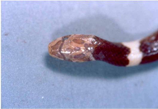
FIGURE 2. Dorsal view of the head of the holotype QSMI 385.