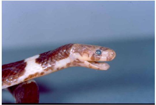
FIGURE 3. Right side of the head of the holotype QSMI 385.