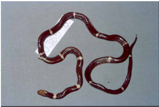
FIGURE 4. Dorsal view of the body of the holotype QSMI 385.