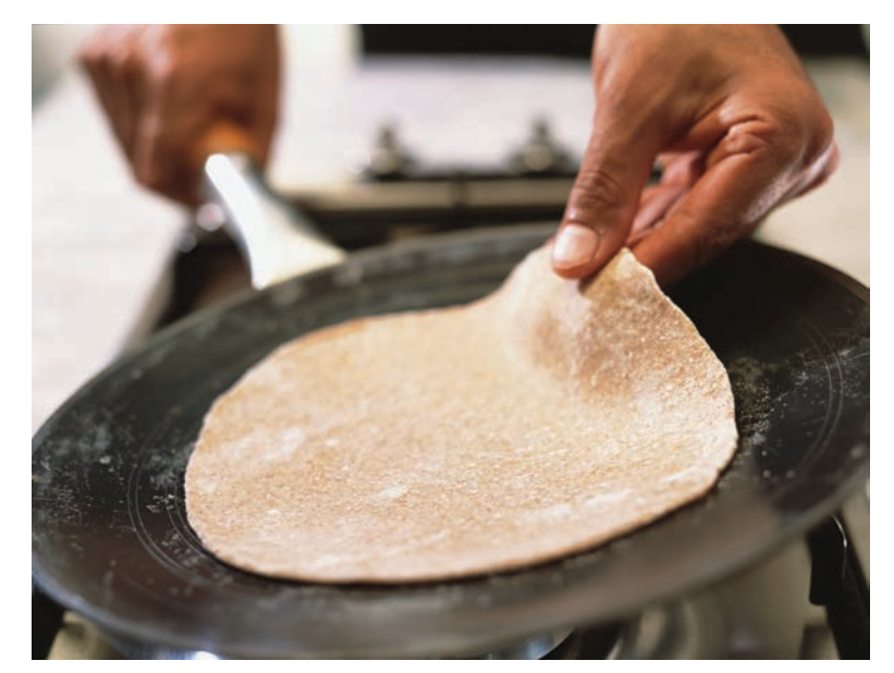
Cooking Chapati

For an interesting presentation, sandwich meat or vegetable curry between three stacked 3-inch (8-cm) chapatis . (That is, three chapatis and two layers of curry.)