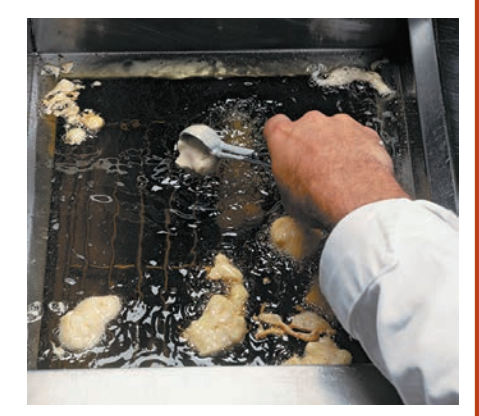
Frying Gobhi Pakode (Cauliflower Fritters)