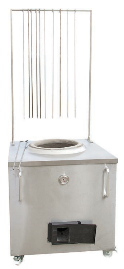
Tandoor oven

Flatbreads made from wheat function as the predominate starch in the north, while inhabitants of the southern regions eat rice with their meals. The food prepared in the north tends toward more subtle seasoning, while hot curries and highly spiced dishes