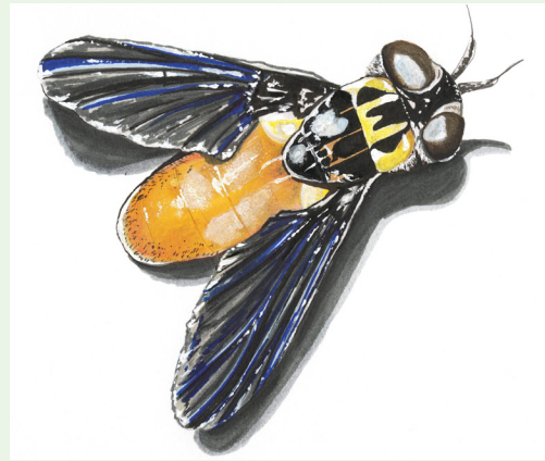
Figure 3. The parasitic fly Trichopoda pennipes is a predator of squash bugs. Illustr. by Jessica MacDonald.

Please note that pesticide labels are continuously changing and therefore can cease to be current and accurate. If any information conflicts with the information on the label, always use the label recommendation.