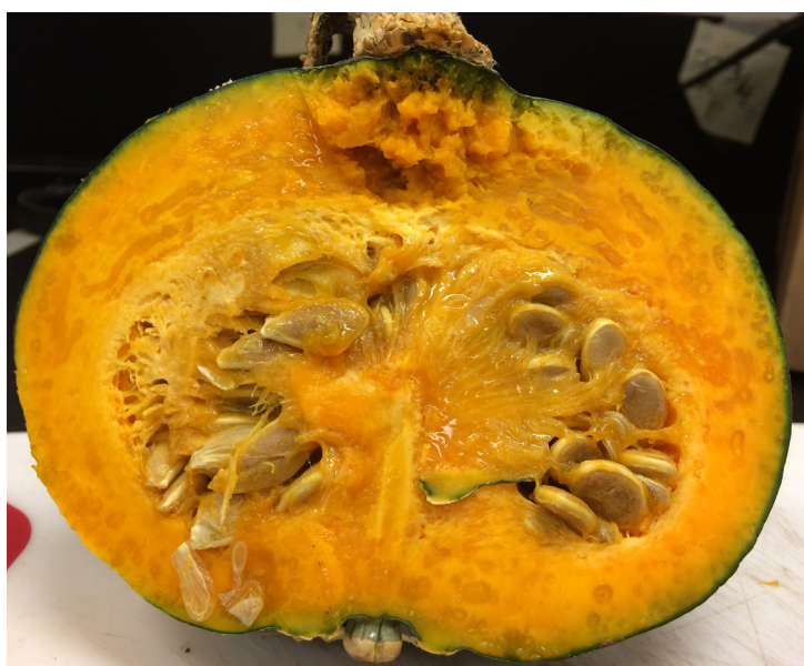
Figure 2. Winter squash (var. Sweet Mama) showing internal damage due to systemic angular leaf spot infection.

mature squash bug) will emerge. There are five nymphal instars, which all look slightly different, the smallest is 0.1 inch (.25 cm) and the largest is 0.5 inch (1.25 cm) (Figure 1). From emergence from the egg to adulthood takes 4-6 weeks, and is dependent on temperature, relative humidity, food quality and availability. Pest populations will grow quickly during hot and dry conditions. Adults are long-lived and continue to lay eggs throughout the growing season, so it is not unusual to see multiple life stages in one field, although there is usually only one generation of squash bug per year. Nymphs will congregate on vines, leaves, and fruits, and will quickly disperse when disturbed.