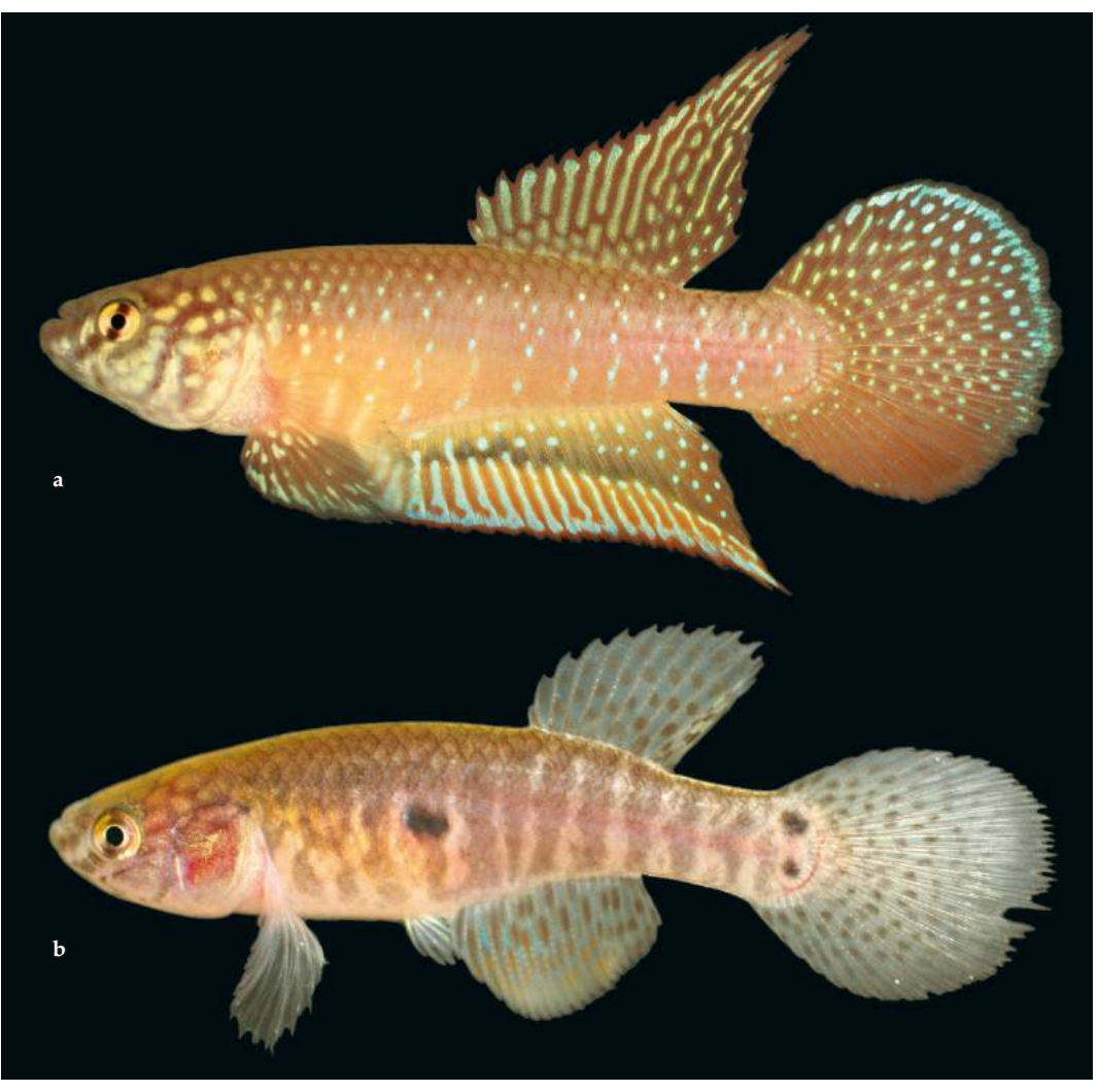
Fig. 3. Live individuals of Nematolebias catimbau , Brazil: Rio de Janeiro: Sampaio Correia. a , UFRJ 8888, holotype, male, 45.7 mm SL; b , UFRJ 8889, paratype, female, 33.6 mm SL.

(C>T), cytb.374 (A>G), and from N . whitei by the latter having the following four UNS: cox1.336 (A>G), cox1.387 (C>T), cox1.643 (T>C), cytb.218 (T>C).