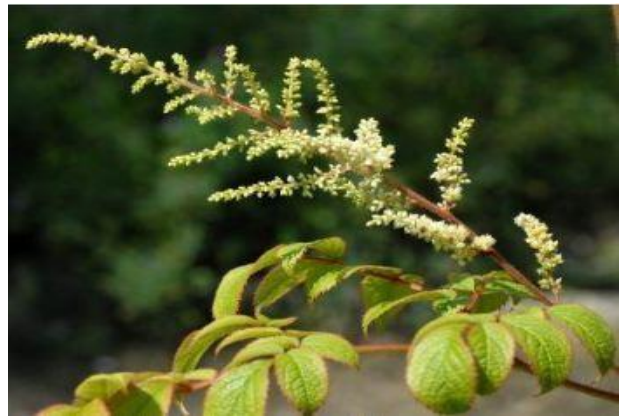
Fig. 1: Astilberivularis Buch. – Ham. Ex D. Don 2.2 Preparation of leaves for Anti bacterial screening

authenticated by the experts of the department of Botany of the said University. A voucher specimen was kept in the department of department of Biochemistry, North Bengal Medical College, Siliguri, West Bengal, India for future references.