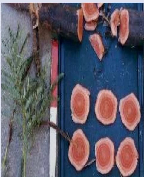
Figure 1b: The reddish roots.