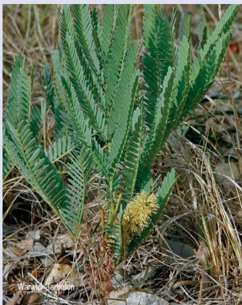
Figure 1a: The plant's image. (Modimolle, Nov 2014).