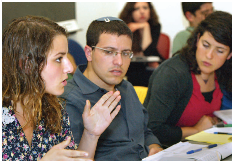
Students discuss Jewish thought at Tikvah's Princeton summer school.