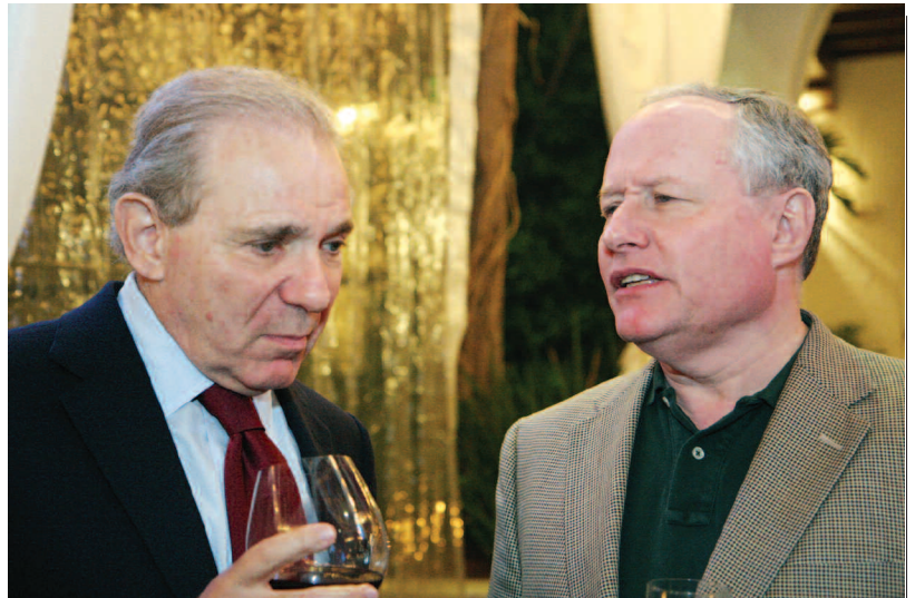
“Irving Kristol, Nathan Glazer, Pat Moynihan, Martin Diamond: Reading these guys, I learned how to think,” says Hertog, pictured here with Kristol’s son William, editor of the Weekly Standard