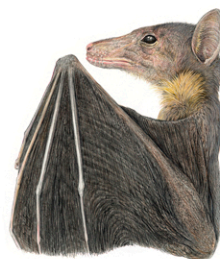
Rousettus amplexicaudatus Common rousette