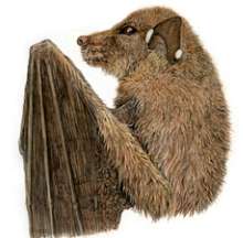
Otopteropus cartilagonodus Luzon pygmy fruit bat