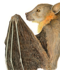
Cynopterus brachyotis Common short-nosed fruit bat