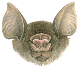
Hipposideros obscurus Philippine forest roundleaf bat