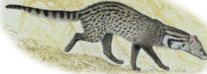
Viverra zangalla Malay civet