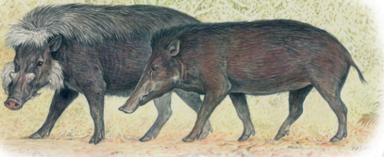
Sus philippensis Philippine warty pig (male and female)