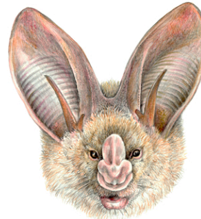
Megaderma spasma Common Asian ghost bat