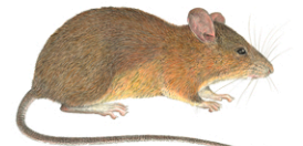
Apomys microdon Small Luzon forest mouse