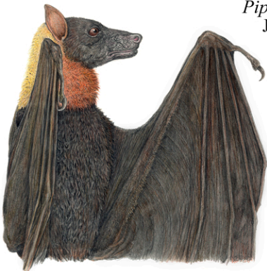
Pteropus vampyrus Large flying fox