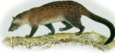
Paradoxurus hermaphroditus Common palm civet