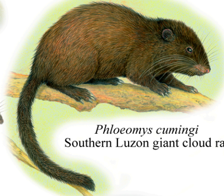
Phloeomys cumingi Southern Luzon giant cloud rat