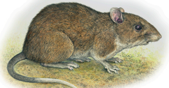
Bullimus luzonicus Luzon bullimus