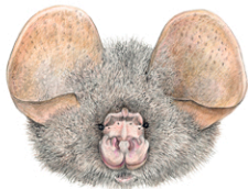
Coelops hirsutus Philippine tailless roundleaf bat