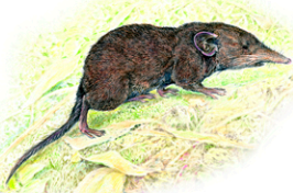
Crocidura grayi Luzon shrew