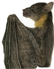
Ptenochirus jagori Greater musky fruit bat