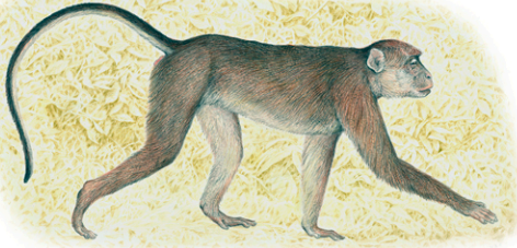
Macaca fascicularis Long-tailed macaque