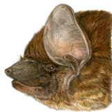
Pipistrellus javanicus Javan pipistrelle