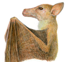
Macroglossus minimus Dagger-toothed flower bat