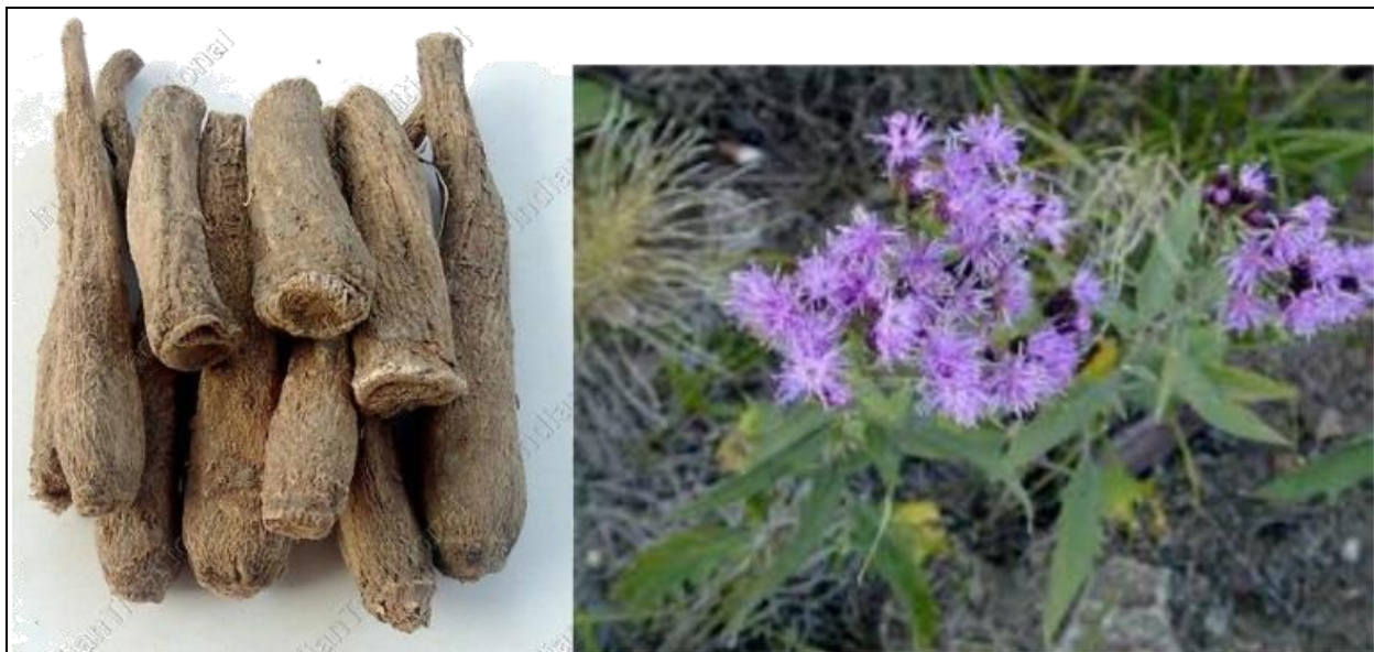
Fig 1: (roots and sapling of S. lappa )

Flower: bluish-purple, stalkless flowers are present in clusters of 2-5. Flowers are borne either terminally or in axils of leaves. (Chadha YR, 1972) [10]