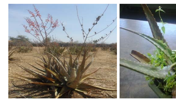
Fig 2: A photograph of cultivated Aloe turkanensis in Karura Forest, Kiambu County

Figures 1 and 2 are photographs Aloe turkanensis taken in its natural and cultivated environs