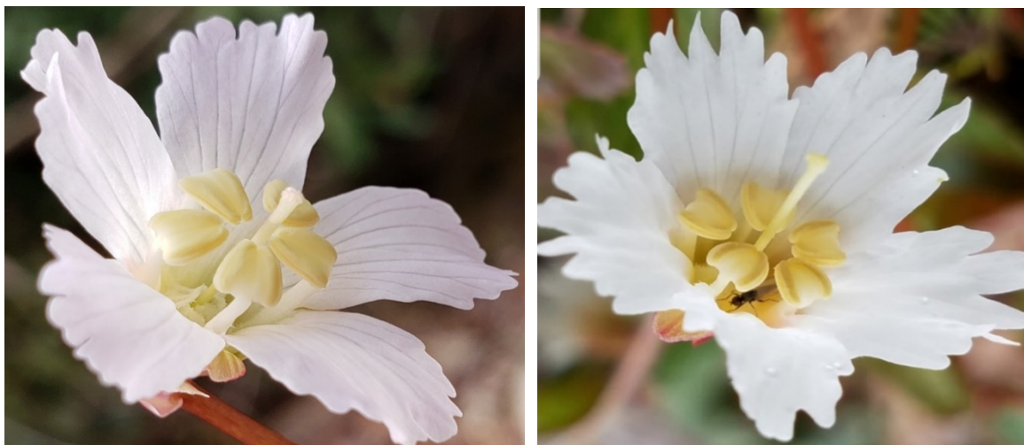
Figure 1. Typical flowers of brevistyla (left) (2.5x) and galacifolia (2x).