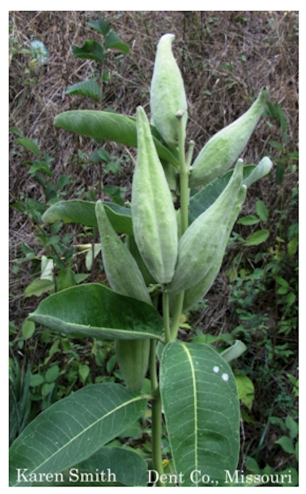
Figure 2. Asclepias syriaca x A. purpurascens. Hybrid with smooth fruits.