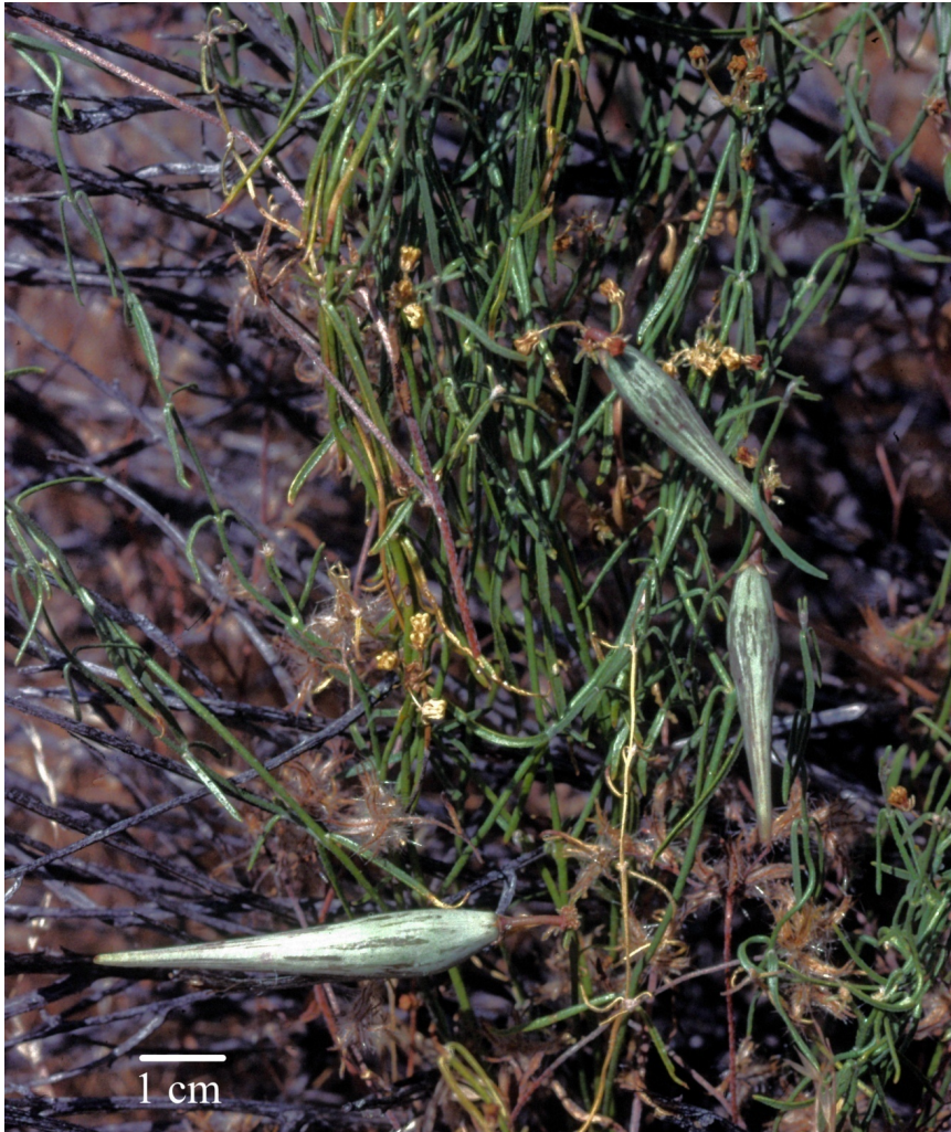
Figure 4. Funastrum utahense . Plant with three fruits.