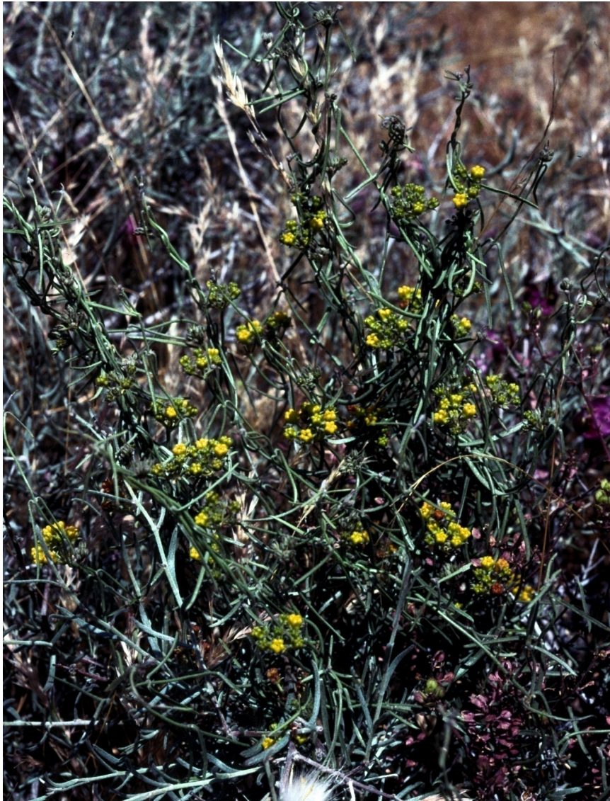
Figure 3. Funastrum utahense . Blooming plant. The flowers turn from yellow to orange as they age.