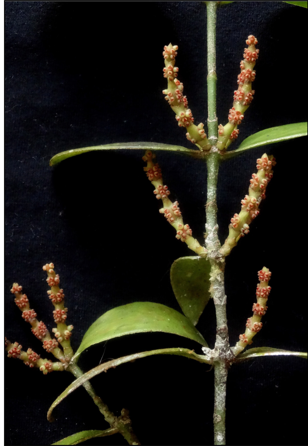
Fig. 3. Flowers and inflorescences of the type of Dendrophthora perlicarpa .