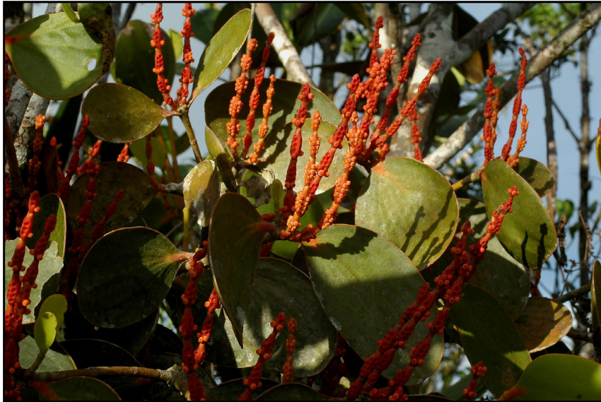
Fig. 1. General habit of the type of Dendrophthora fortis .