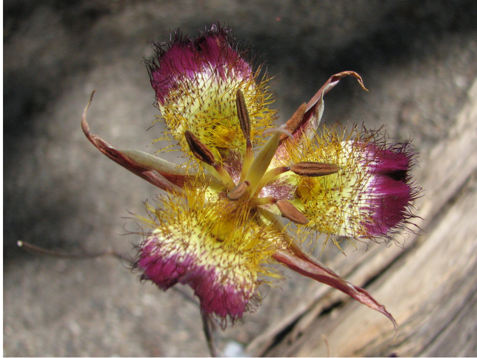
Figure 2. Calochortus rustvoldii flower. Note the rotate perianth.