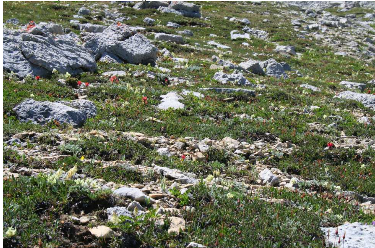
Figure 10. Castilleja kerryana, more mesic site, type locale, upper flanks Flint Mt.

Figure 9. Scapegoat Mt. and Scapegoat Plateau from xeric site on upper Flint Mt. Note Castilleja kerryana on some mats of Dryas octopetala in the foreground.