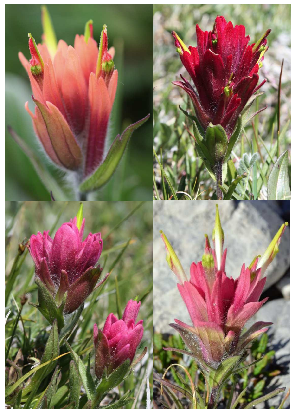
Figure 5. Variation in coloration of inflorescences in Castilleja kerryana , part 1.