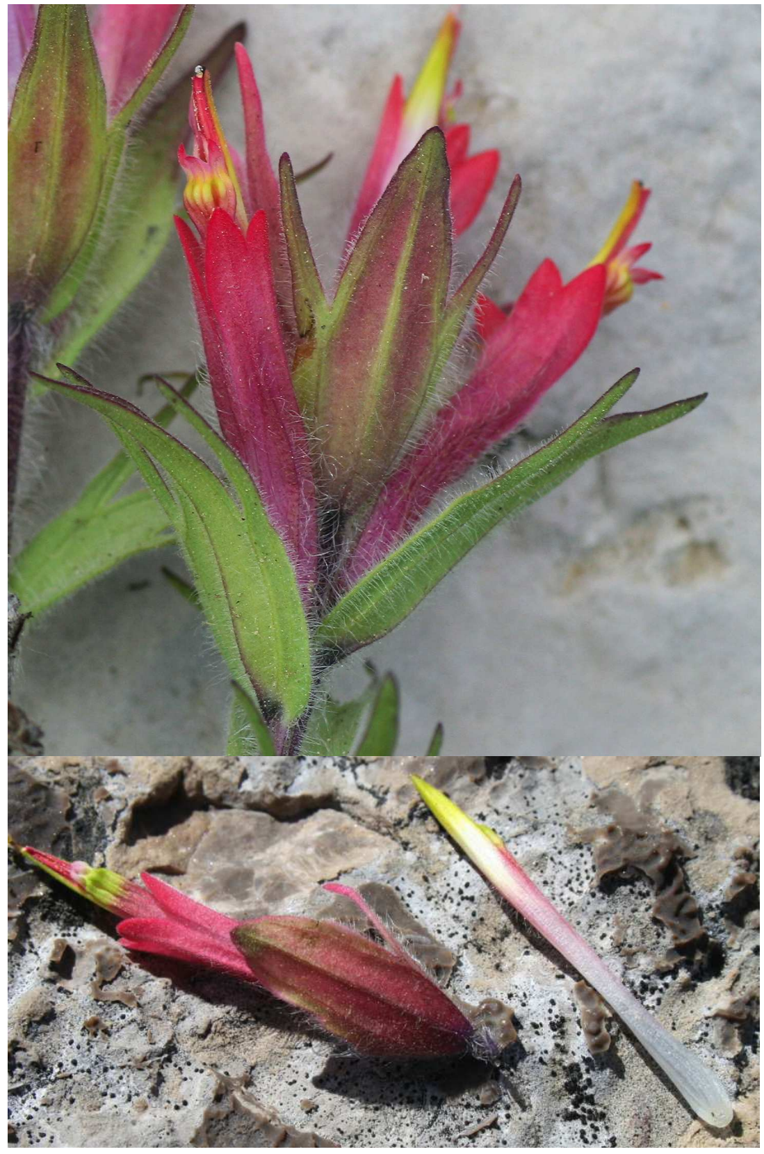
Figure 4. Portions of holotype gathering. A. Inflorescence (top). B. Bract, calyx, and exserted corolla (lower left). C. Corolla dissected from calyx (lower right).