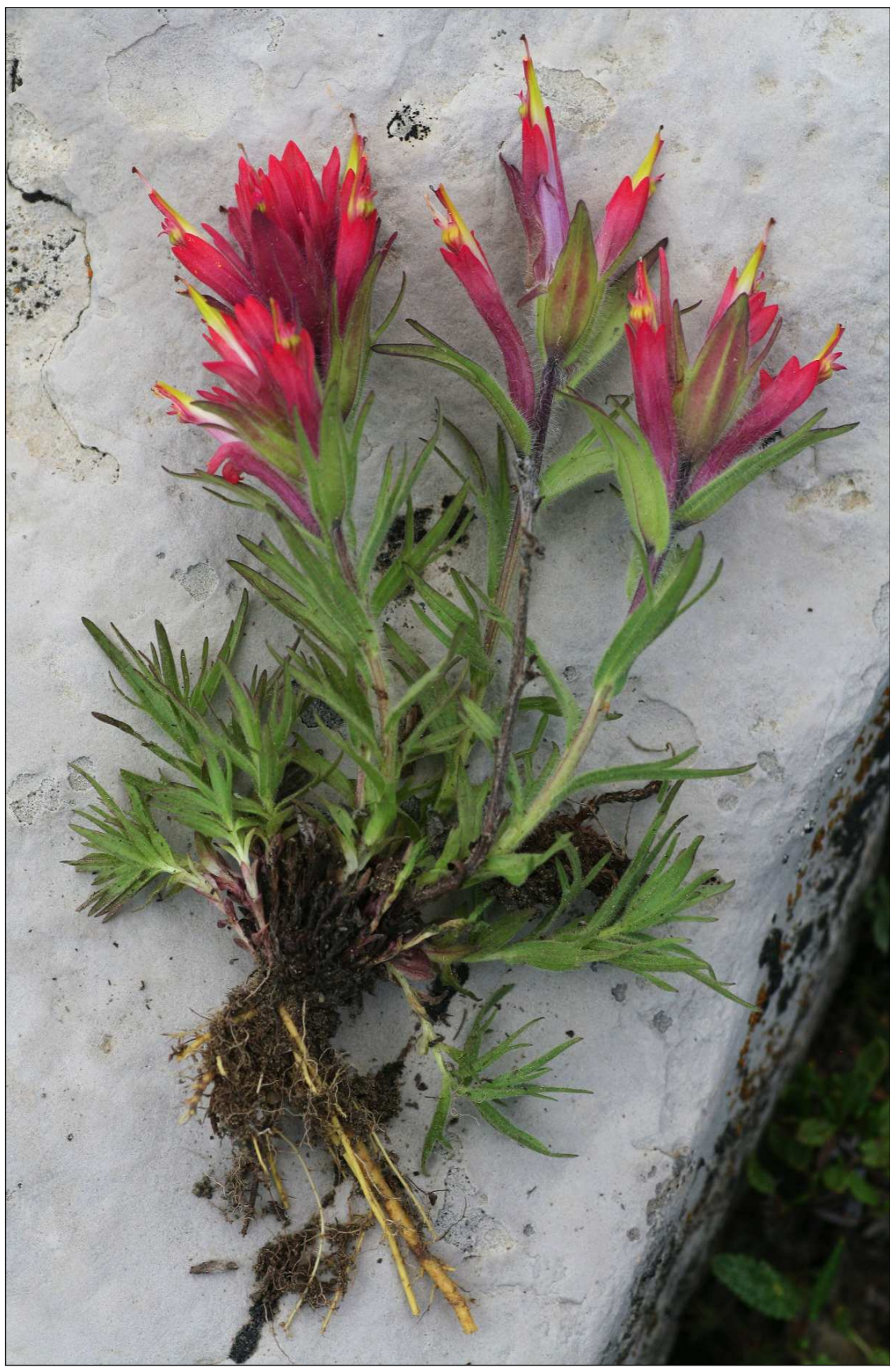
Figure. 3. Portion of holotype gathering in the field, entire plant.