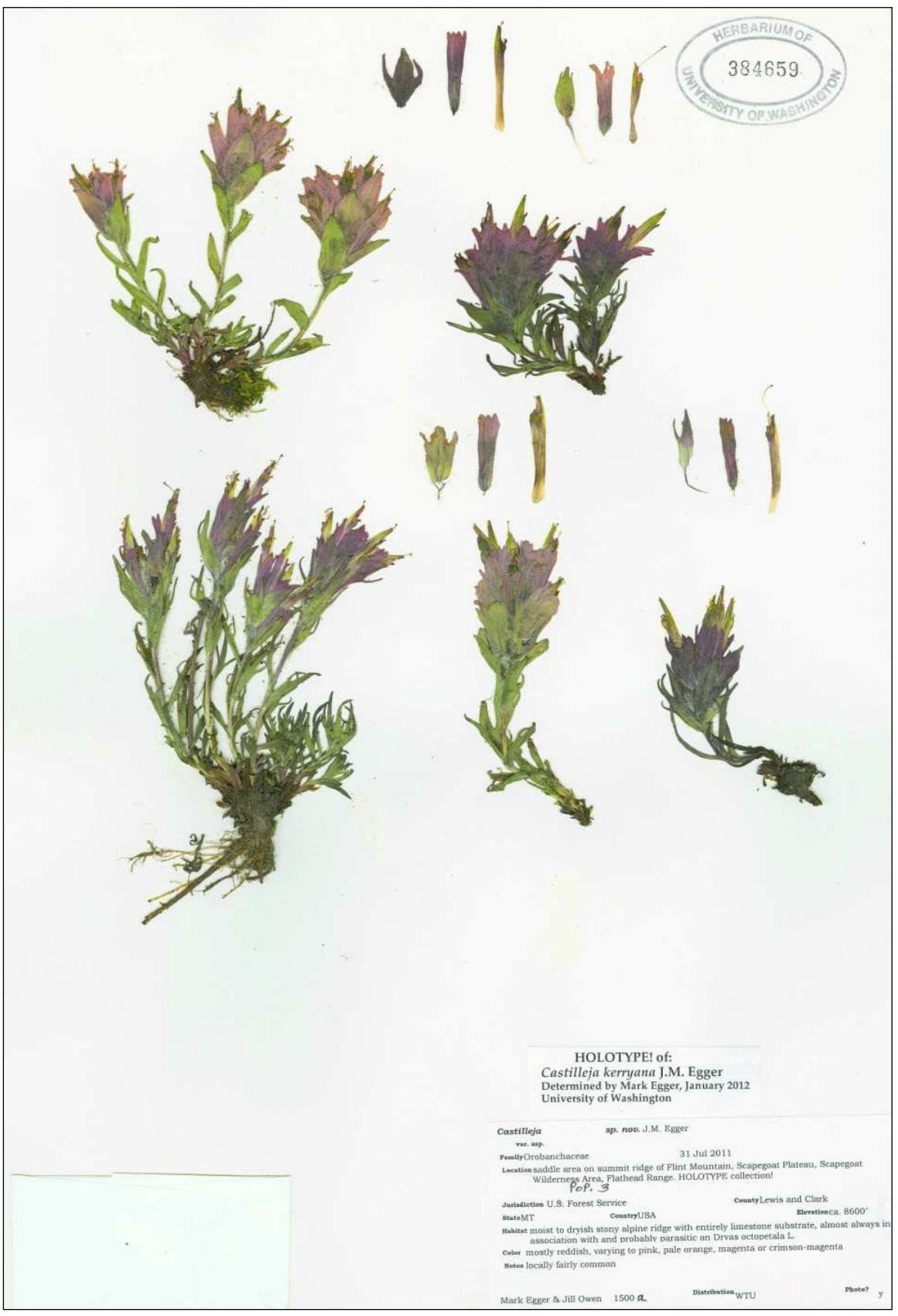
Figure 2. Holotype of Castilleja kerryana J.M. Egger, WTU.