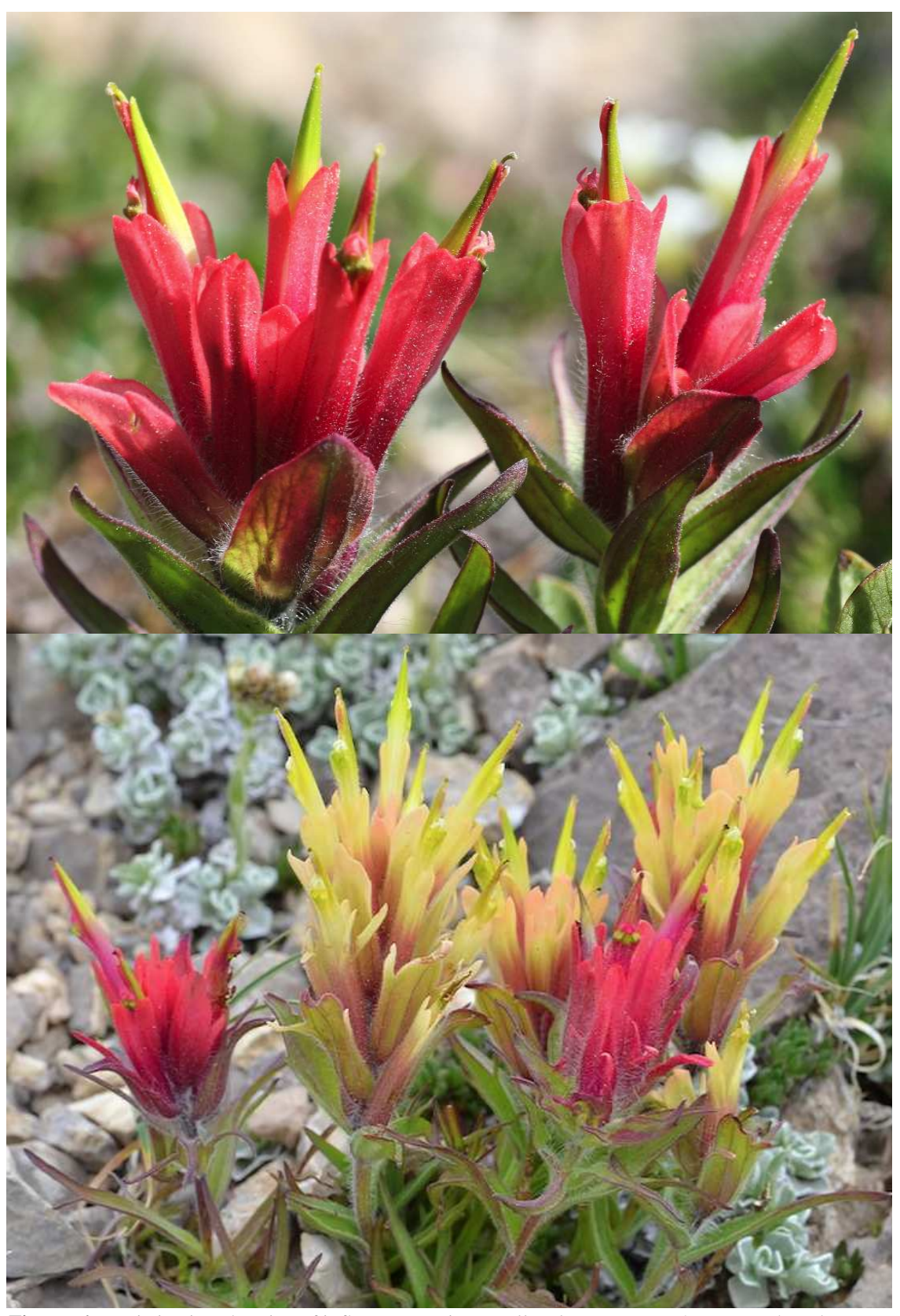
Figure. 6. Variation in coloration of inflorescences in Castilleja kerryana , part 2.