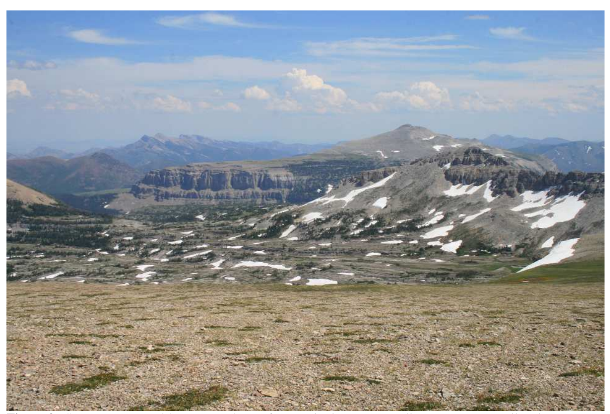
Figure 9. Scapegoat Mt. and Scapegoat Plateau from xeric site on upper Flint Mt. Note Castilleja kerryana on some mats of Dryas octopetala in the foreground.