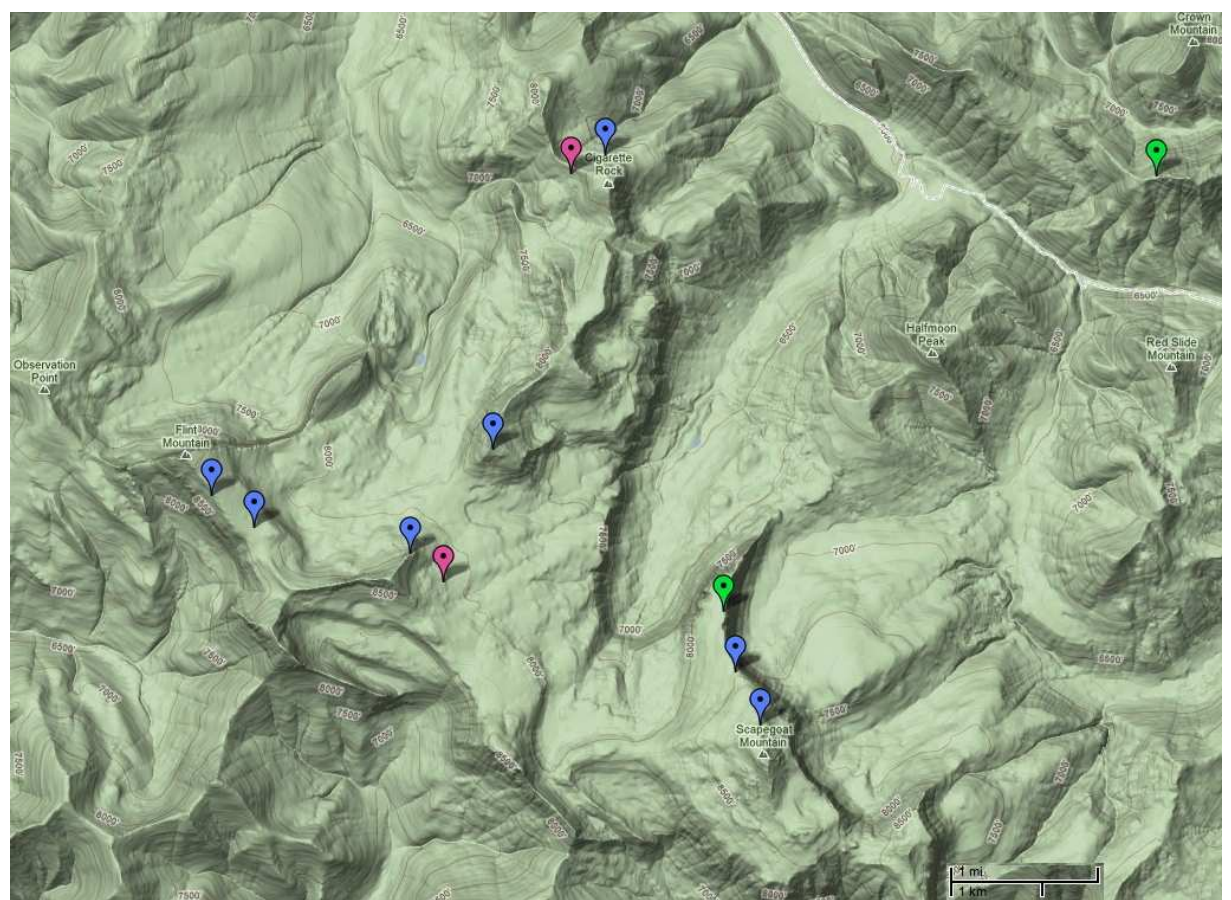
Figure 7. Camp locations (red) and collections sites of Castilleja kerryana (blue) for this study; other herbarium-verified collection sites (green).