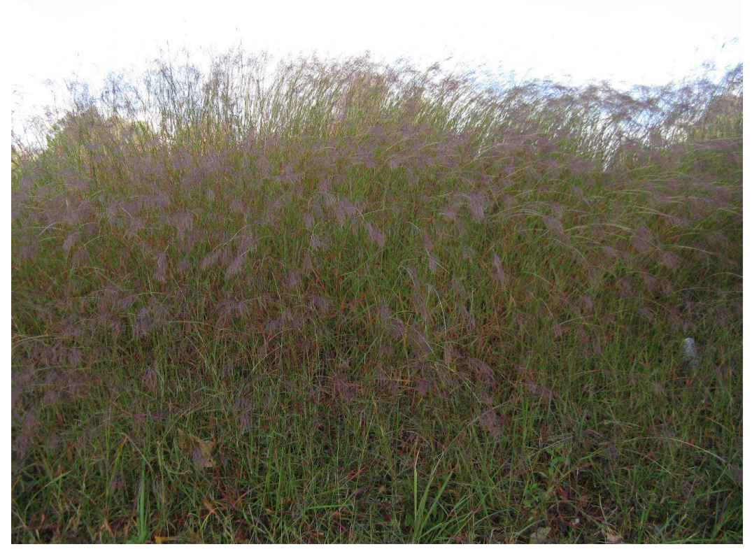
Figure 4. Bothriochloa pertusa population on roadside in Pickens County, Alabama.