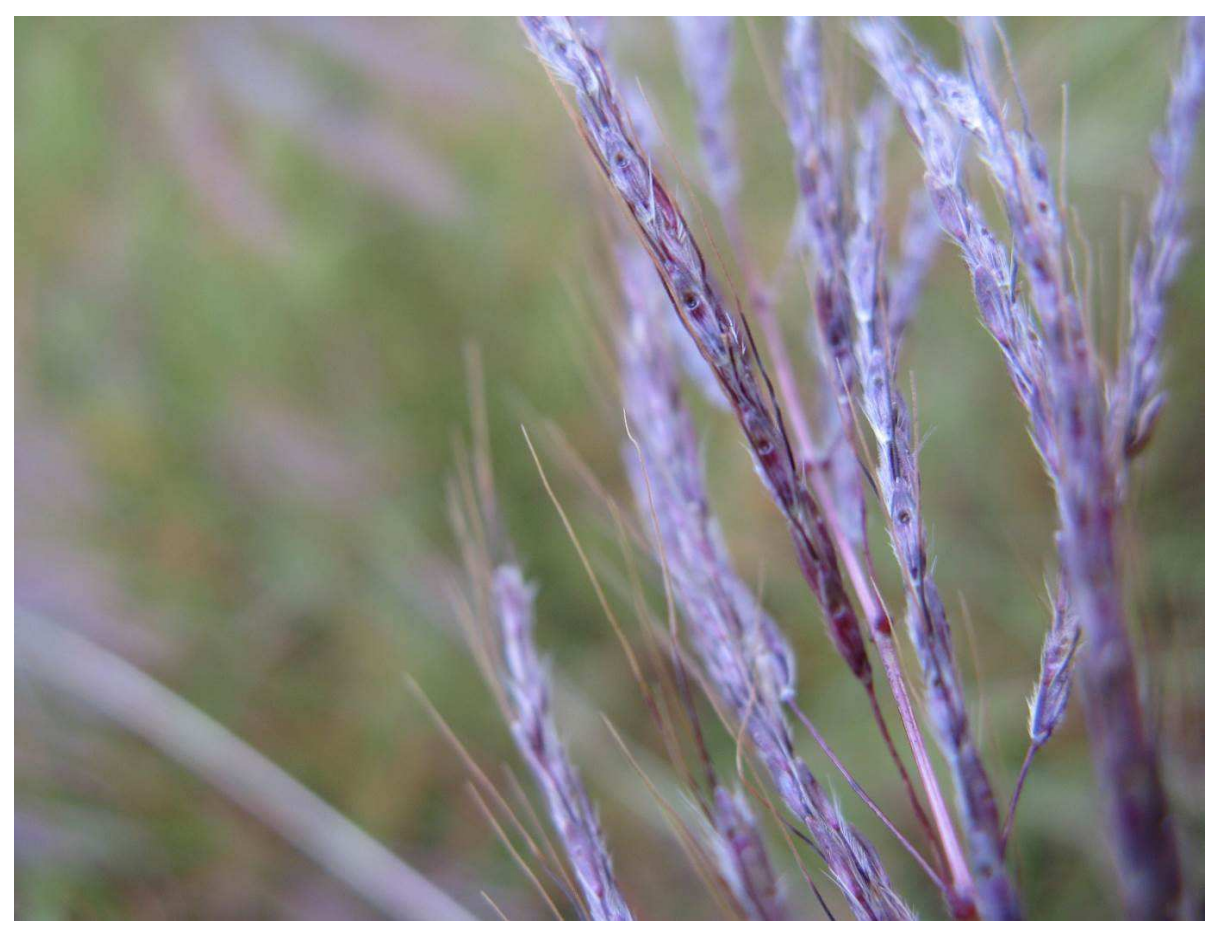
Figure 2. Inflorescence of Bothriochloa pertusa with characteristic "pit" on lower glume.