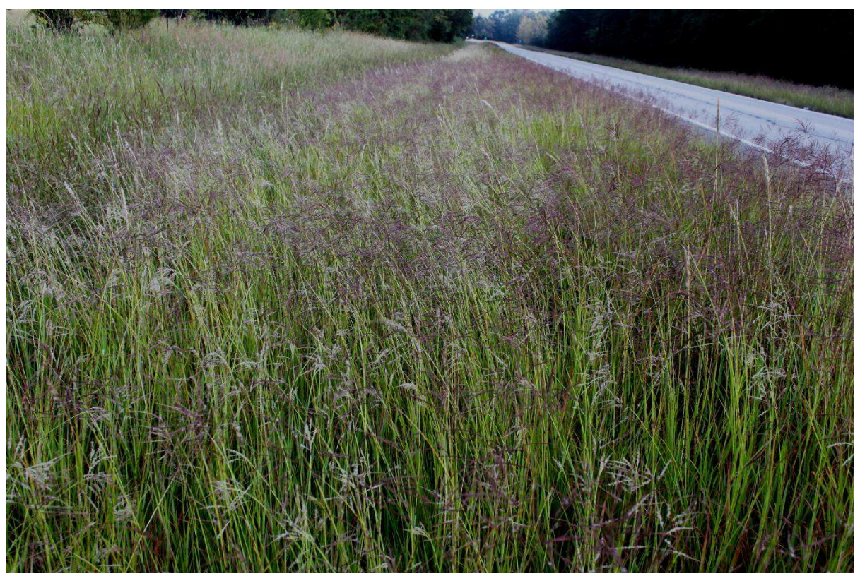
Figure 3. Bothriochloa pertusa population on roadside in Montgomery County, Alabama.