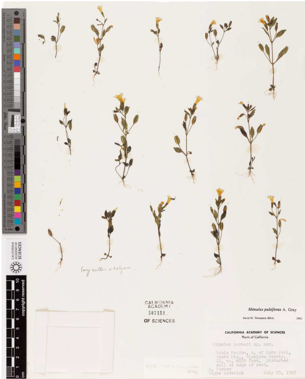
Figure 2. Erythranthe trinitiensis , Parker & Roderick s.n. (CAS).