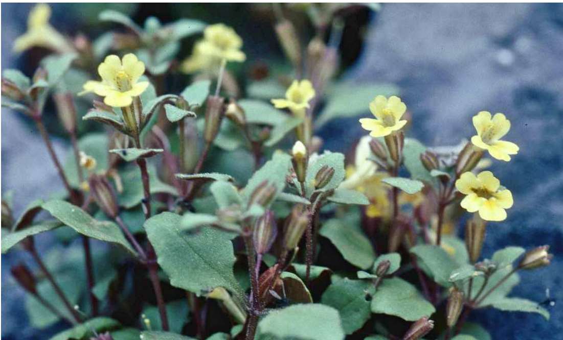
Figure 5. Flowers of Erythranthe taylori , from the population of Taylor 13405 .

Flowering Apr–May. Crevices in limestone cliff faces and outcrops; 900–1100 m. California (Shasta Co.).