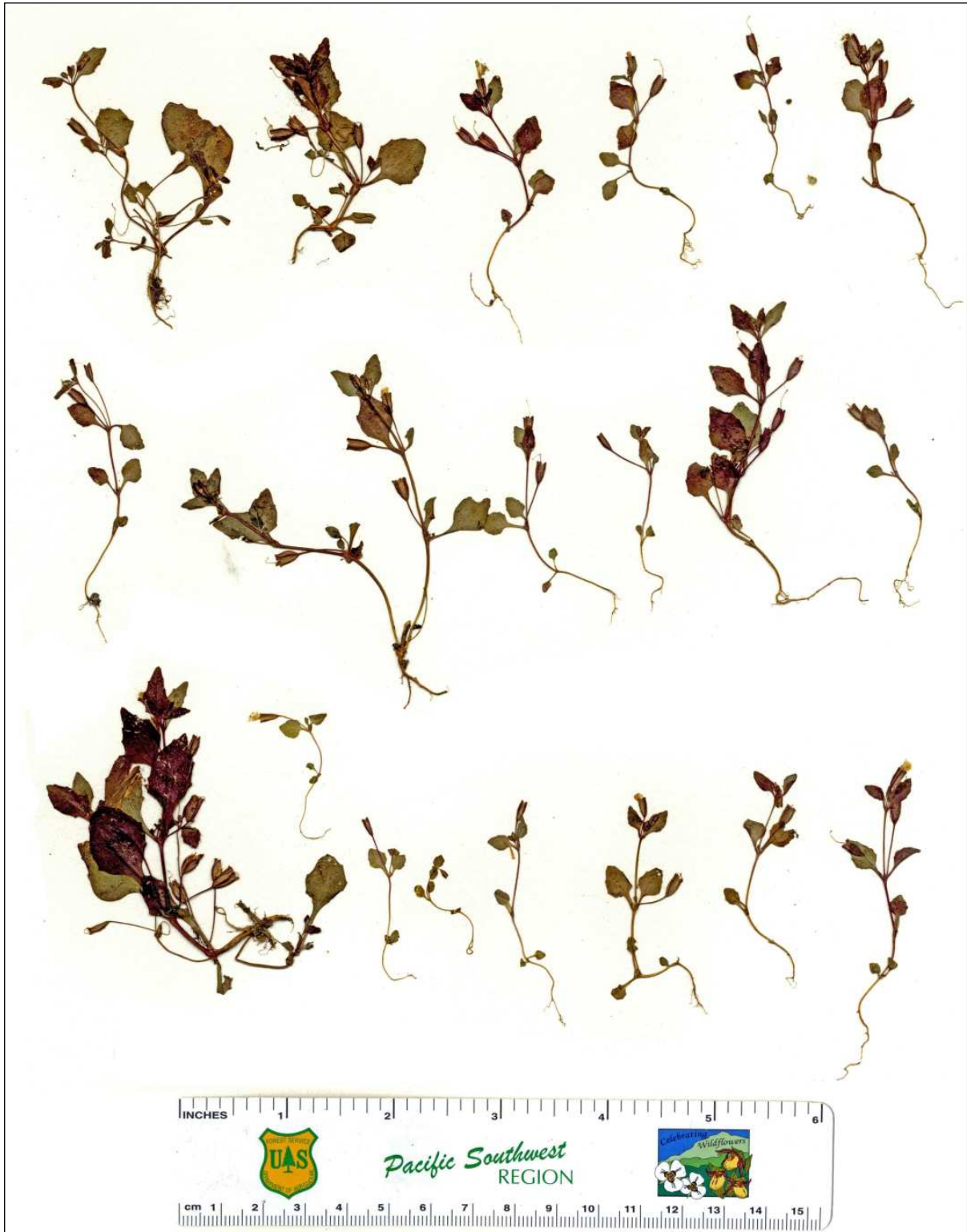
Figure 7. Erythranthe taylori , Taylor 13405 (paratype, CHSC).