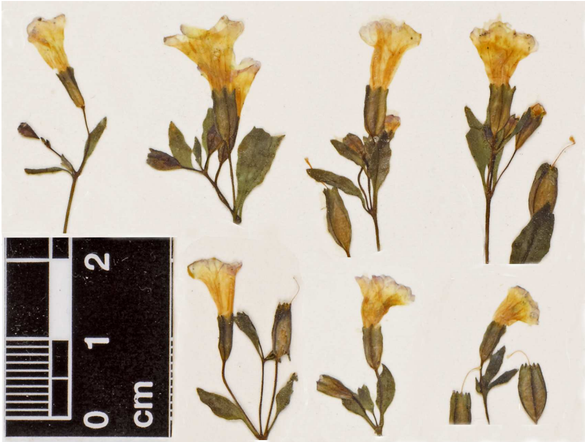
Figure 3. Erythranthe trinitensis , flowers from Parker & Roderick s.n. (CAS). The pink borders of the corolla limb are evident even in drying. Note mature, inflated calyx at lower right and immediately above.