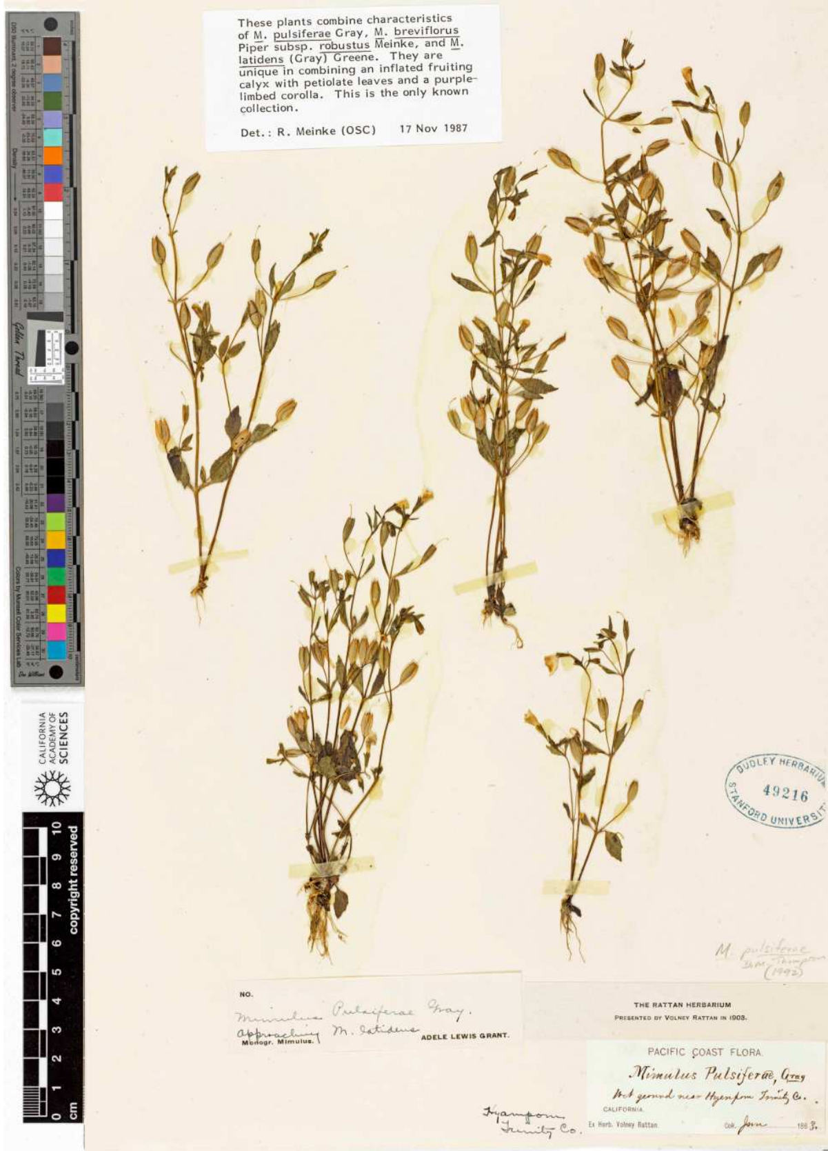
Figure 1. Erythranthe trinitensis , holotype.