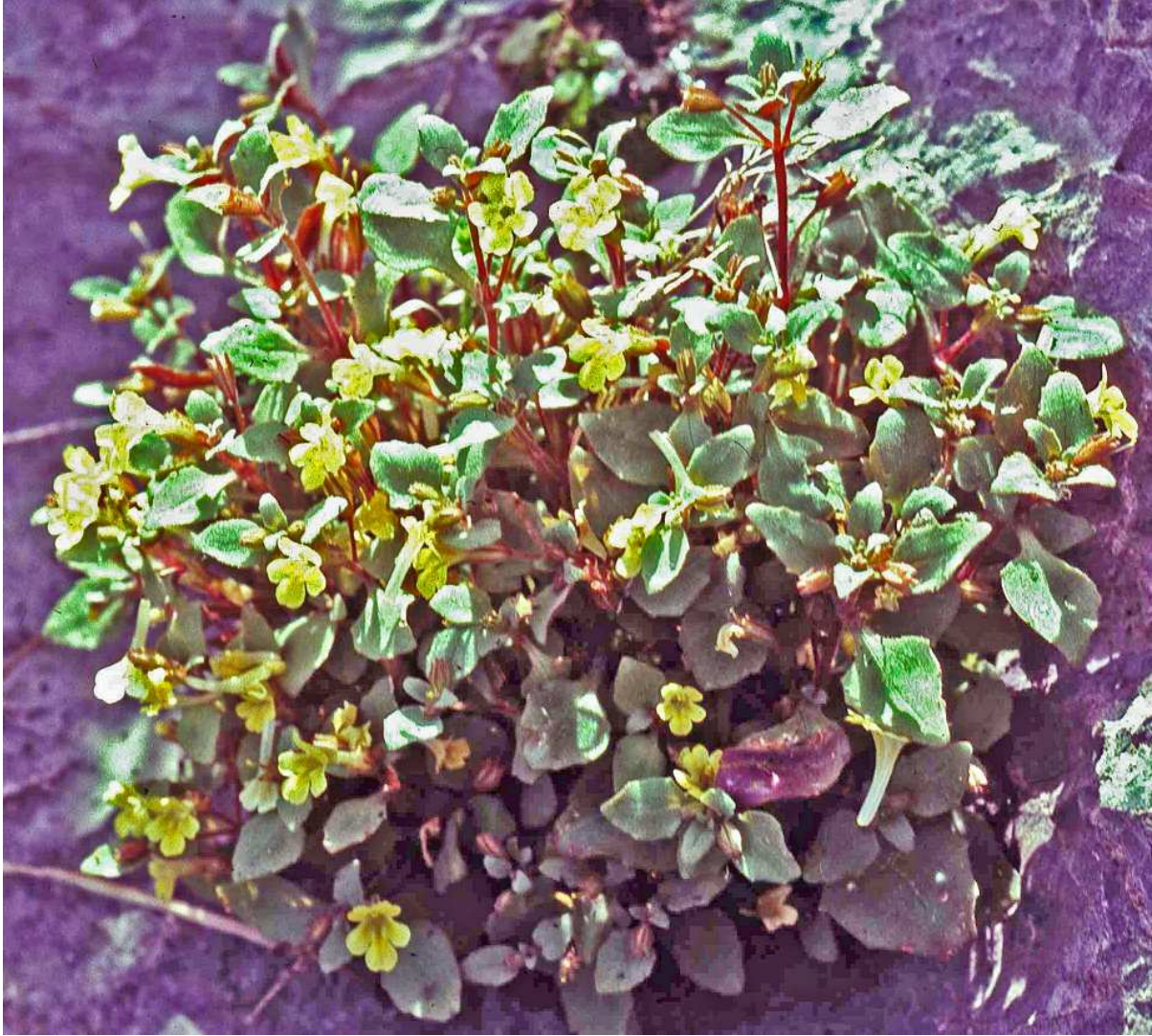
Figure 6. Erythranthe taylora , from the population of Taylor 13405.

Additional collections examined. California. Shasta Co.: Hirz Mountain, along trail from parking area to lookout, growing in crevices in limestone rock, 3240 ft, 29 Apr 2010, Kierstead-Nelson 2010-003 (CHSC 105854!); S end of Gray Rocks, Squaw Creek watershed, Shasta Lake region, limestone outcrops in open forest dominated by Quercus kelloggii - Pinus sabiniana , ca. 2800 ft, 1 May 1993, Taylor 13405 with J.R. Shevock (RSA 565081, UC 1736596!, UCR 84857, CHSC).