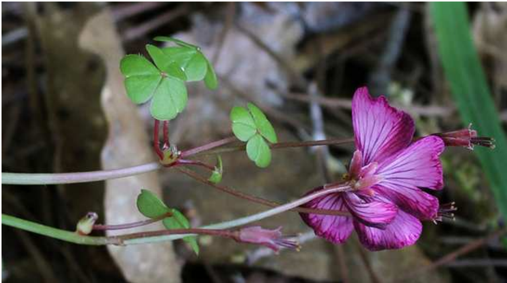
Figure 4. Oxalis brasiliensis in Dallas Co., Alabama, showing production of aerial propagules. Photo by Wayne Barger, 23 May 2013.