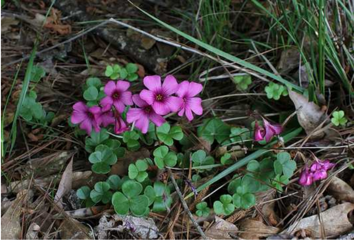
Figure 3. Growth habit of Oxalis brasiliensis in Dallas Co., Alabama. Photo by Wayne Barger, 23 May 2013.

structurally identical, if somewhat underdeveloped, to those of bulbils produced underground." In fact, the present authors have not found any other mention in literature of such non-bulboid propagules in Oxalis like those produced in O. brasiliensis . Lourteig's description (translated from Spanish) of O. brasiliensis (2000, p. 557) noted that "aerial bulbs were sometimes present in the inflorescences."