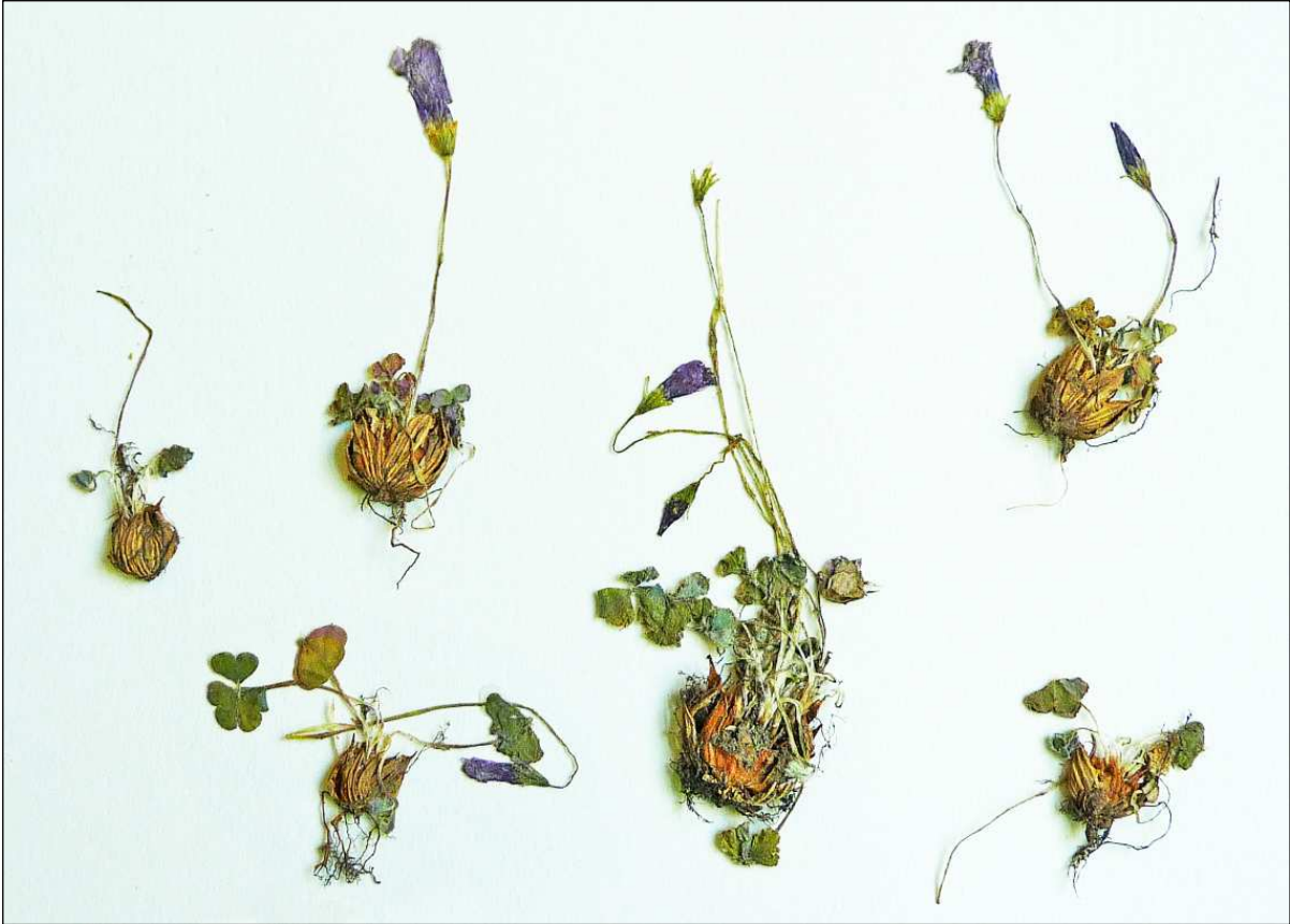
Figure 2. Oxalis hispidula collections from Baldwin County, Alabama. Top: Horne 1957 (BRIT). Right: Horne 1960 (BRIT).