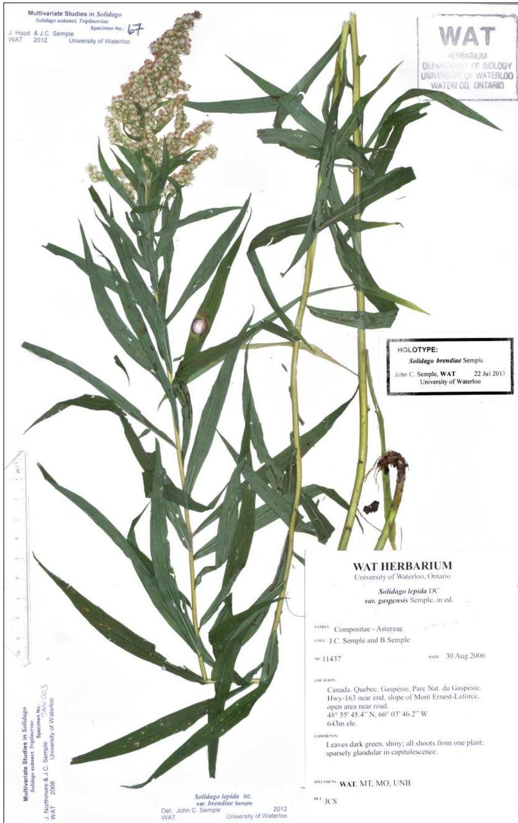
Figure 1. Holotype of Solidago brendiae (WAT)