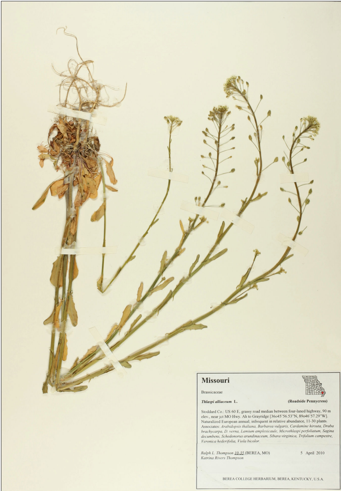
Figure 3. Thlaspi alliaceum in Stoddard Co., Missouri (Thompson & Rivers Thompson 10-35, NCU).