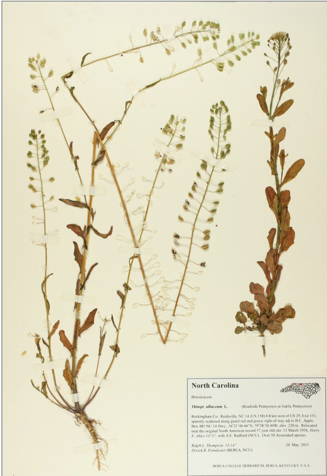
Figure 5. Thlaspi alliaceum , rediscovered in Rockingham Co., North Carolina (Thompson & Poindexter 13-147, NCU).