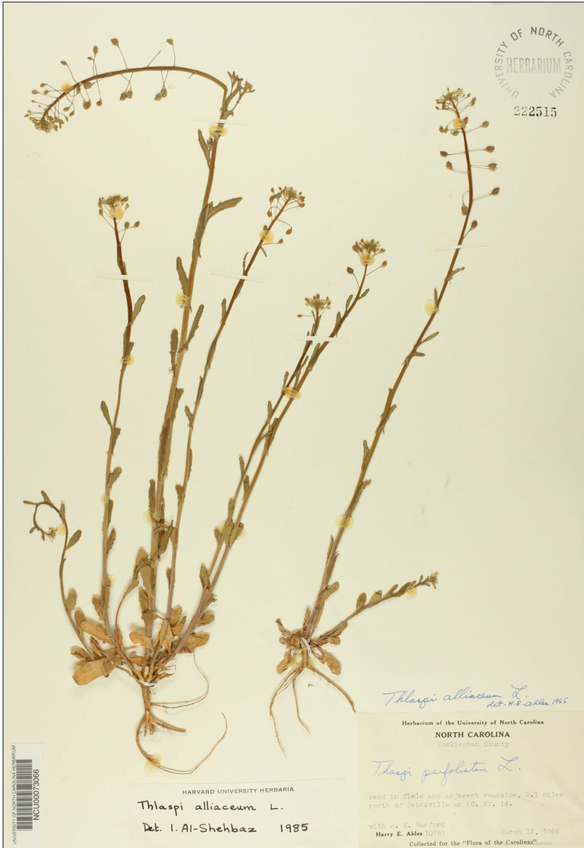
Figure 4. Thlaspi alliaceum , the North American record in Rockingham Co., North Carolina (Ahles 10757, NCU).