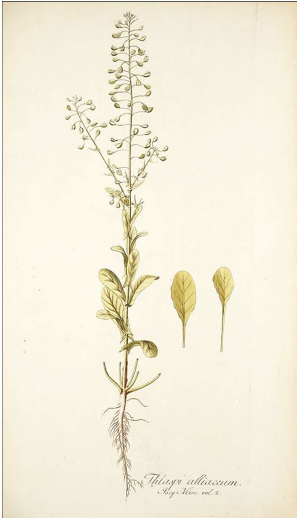
Figure 1. Thlaspi alliaceum L. in Icones Plantarum Rariorum , Vol. I., Plate 121 (Jacquin 1781-1786).