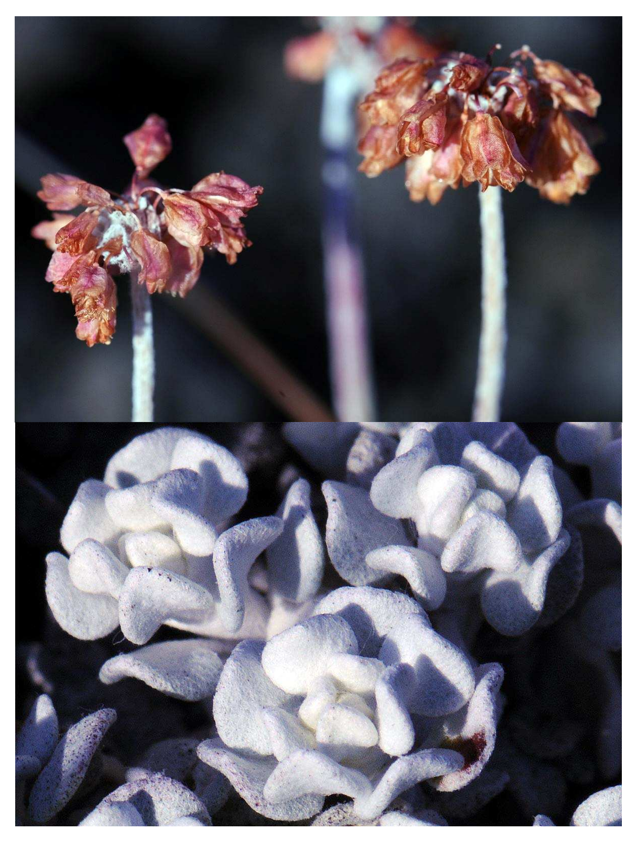
Figure 2. Mature flowers (above) and leaves of Eriogonum ovalifolium var. focarium .