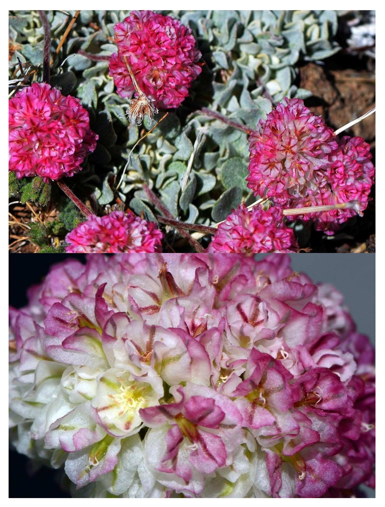
Figure 4. Prostrate scapes (above) and flowers with achenes of Eriogonum ovalifolium var. rubidium.