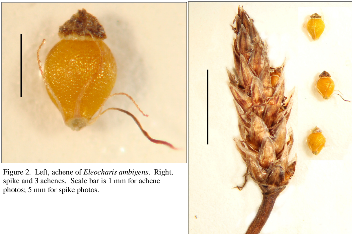
Figure 2. Left, achene of Eleocharis ambigens . Right, spike and 3 achenes. Scale bar is 1 mm for achene photos; 5 mm for spike photos.