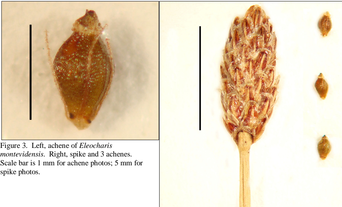
Figure 3. Left, achene of Eleocharis montevidensis . Right, spike and 3 achenes. Scale bar is 1 mm for achene photos; 5 mm for spike photos.