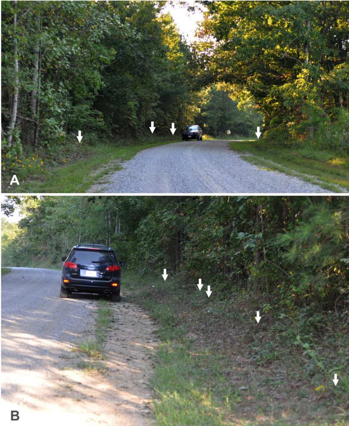
Figure 4. Solidago porteri habitat in Tennessee of Semple et al. 11861 and Semple et al. 11867. A. Habitat looking north. B. Habitat looking south along west side of road. Locations of plants indicated by arrows.