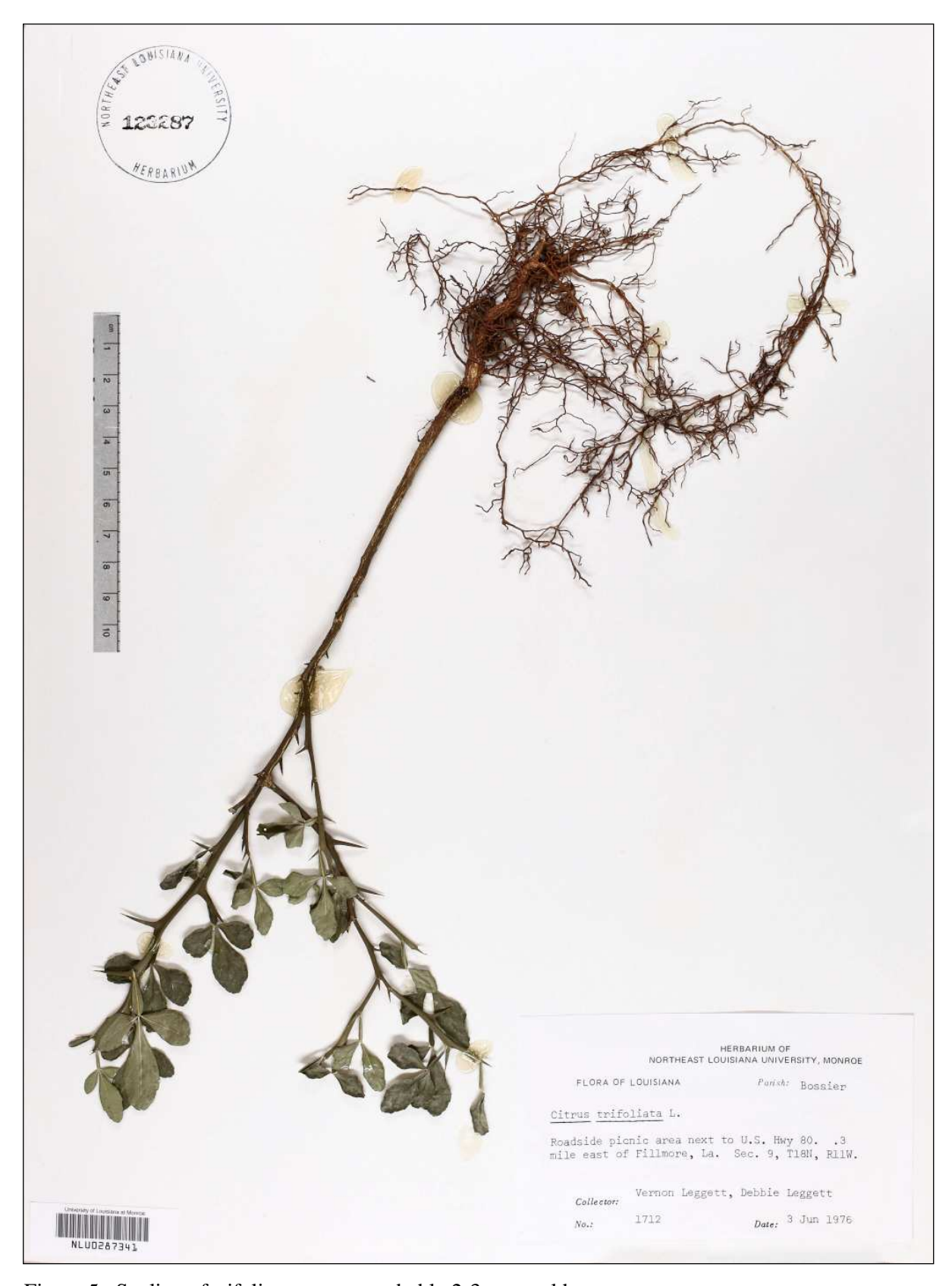
Figure 5. Sapling of trifoliate orange, probably 2-3 years old.