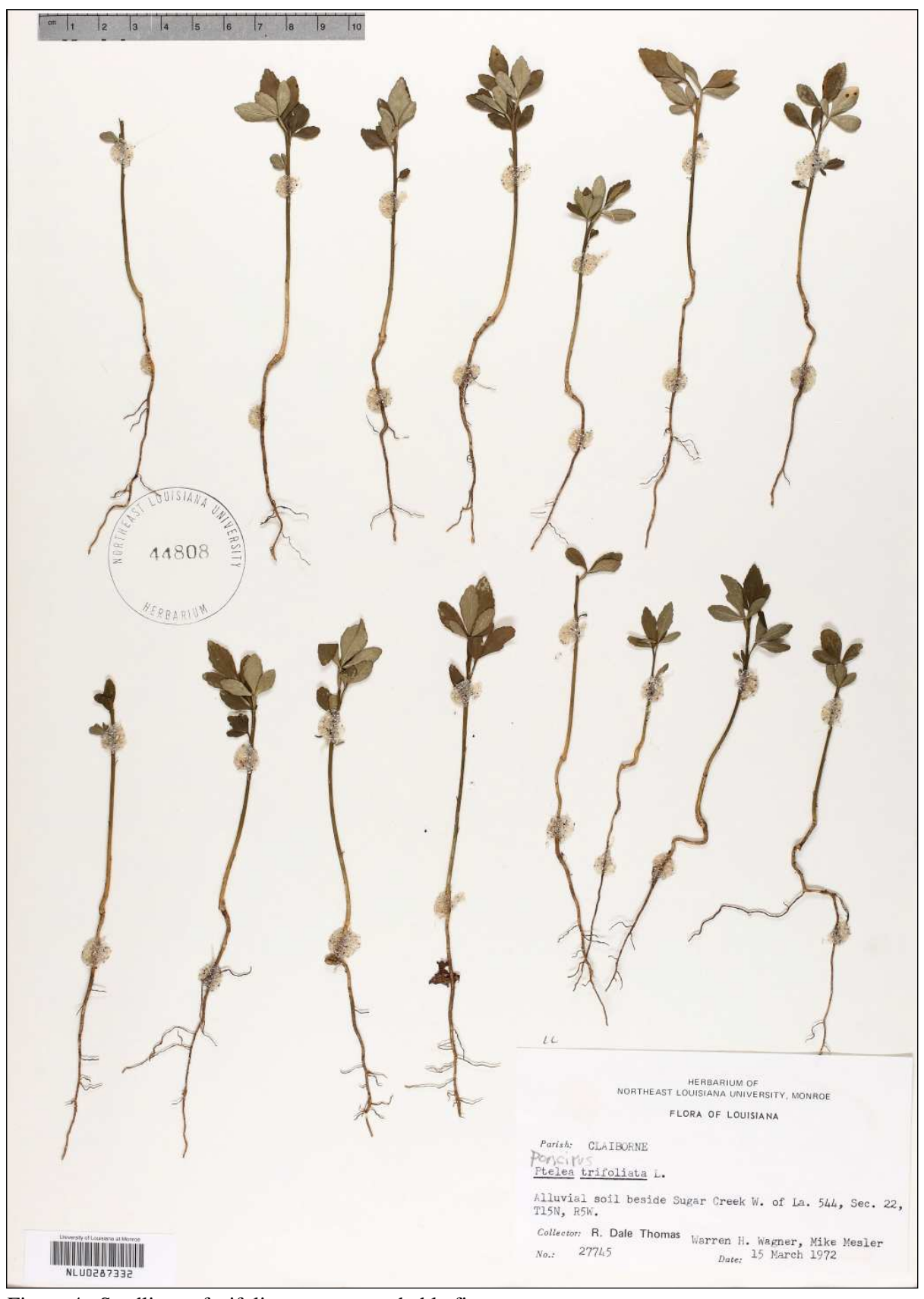
Figure 4. Seedlings of trifoliate orange, probably first year.