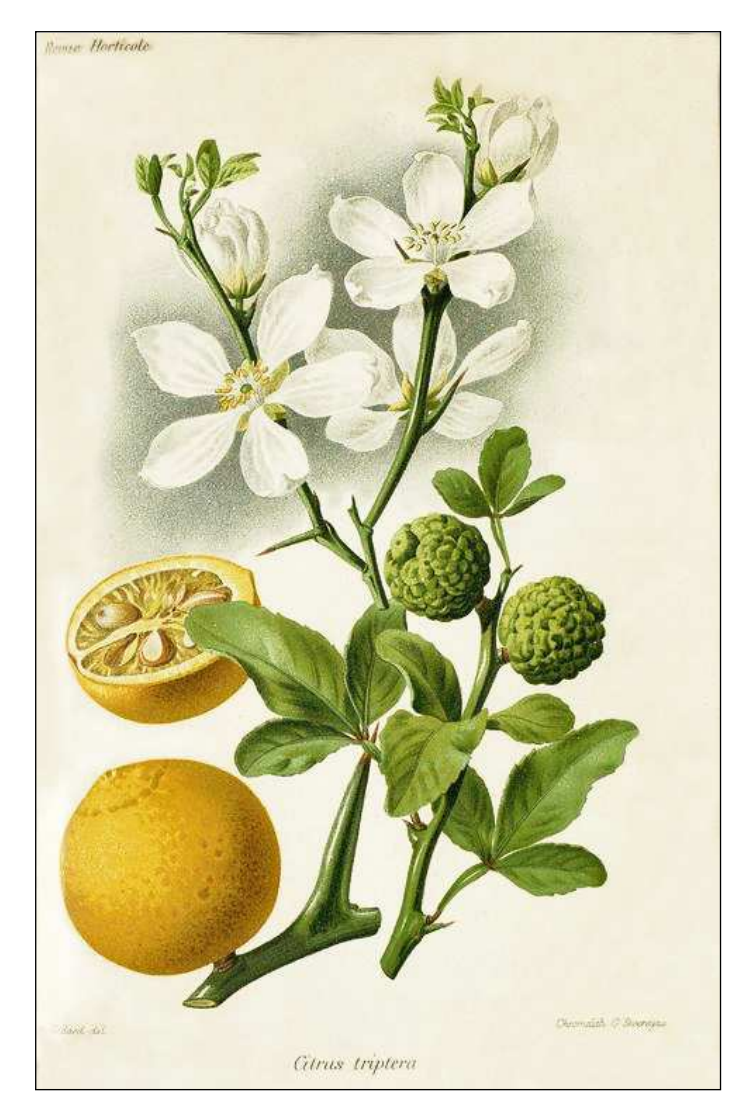
Figure 2. Citrus triptera Desf. (= C. trifoliata ), from Andre (1885).

Trifoliate orange freely hybridizes with other Citrus species and was used in the USDA citrus breeding program, beginning in Florida in 1897 and continuing for several decades. This work produced a series of hybrids — (X kumquats ( Fortunella ) = citrumquats; X sweet oranges = citranges; X pummelos = citrumelos; X mandarins = citrandarins; X lemons = citremons; and X sour oranges = citradias) (Swingle & Reece 1967).