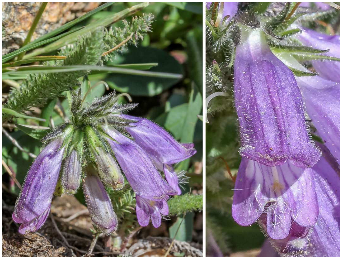
Figure 2. Flower and inflorescence of Penstemon bleaklyi.