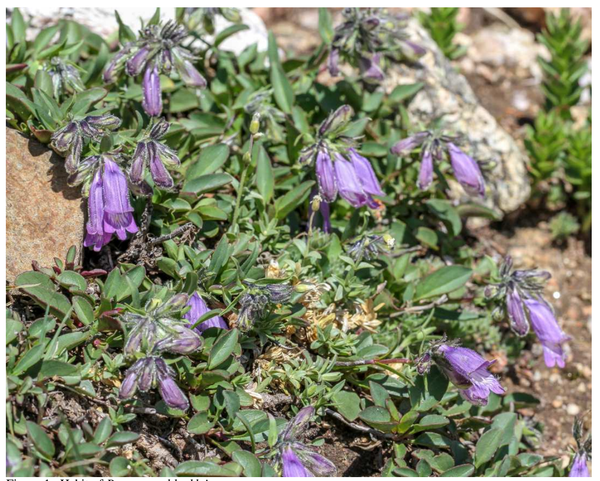
Figure 1. Habit of Penstemon bleaklyi.

Paratypes. USA. New Mexico . Taos Co.: Vermejo Park, ca. 2 mi S of State Line Peak along boundary between Vermejo Park and Rio Costilla, 36.95681° N, 105.3209° W, 12,566 ft. elev, 18 Jul 2012, Heil, Hyder, and Martinez 34213 (SJNM); Rio Costilla Land Grant, Culebra Range, crest of ridge on S side of an unnamed cirque, 2.2 air mi NNW of Big Costilla Peak and 3.3 air mi SSW of State Line Peak, 36.95158° N, 105.3183° W, 12,620 ft. elev, 19 Jul 2012, Heil, Hyder, and Martinez 34276 (SJNM).