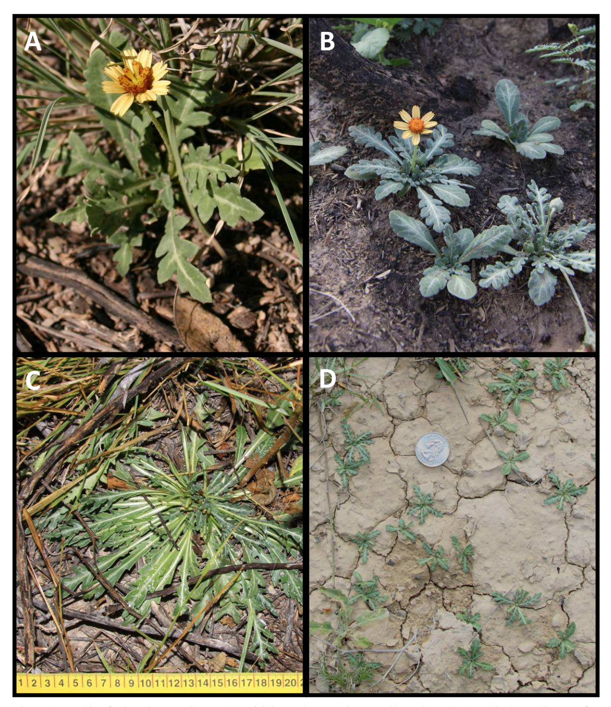
Figure 1. Habit of Plateilema palmeri . A. Initial voucher specimen collected on 12 Aug 2014. B. Group of individuals growing in area treated by prescribed fire beneath burned Prosopis glandulosa var. torreyana . C. Example of large basal rosette with evidence of herbivory ( Jackson 286 , SRSC). D. Example of contrast in size of individuals; coin is a USA quarter.