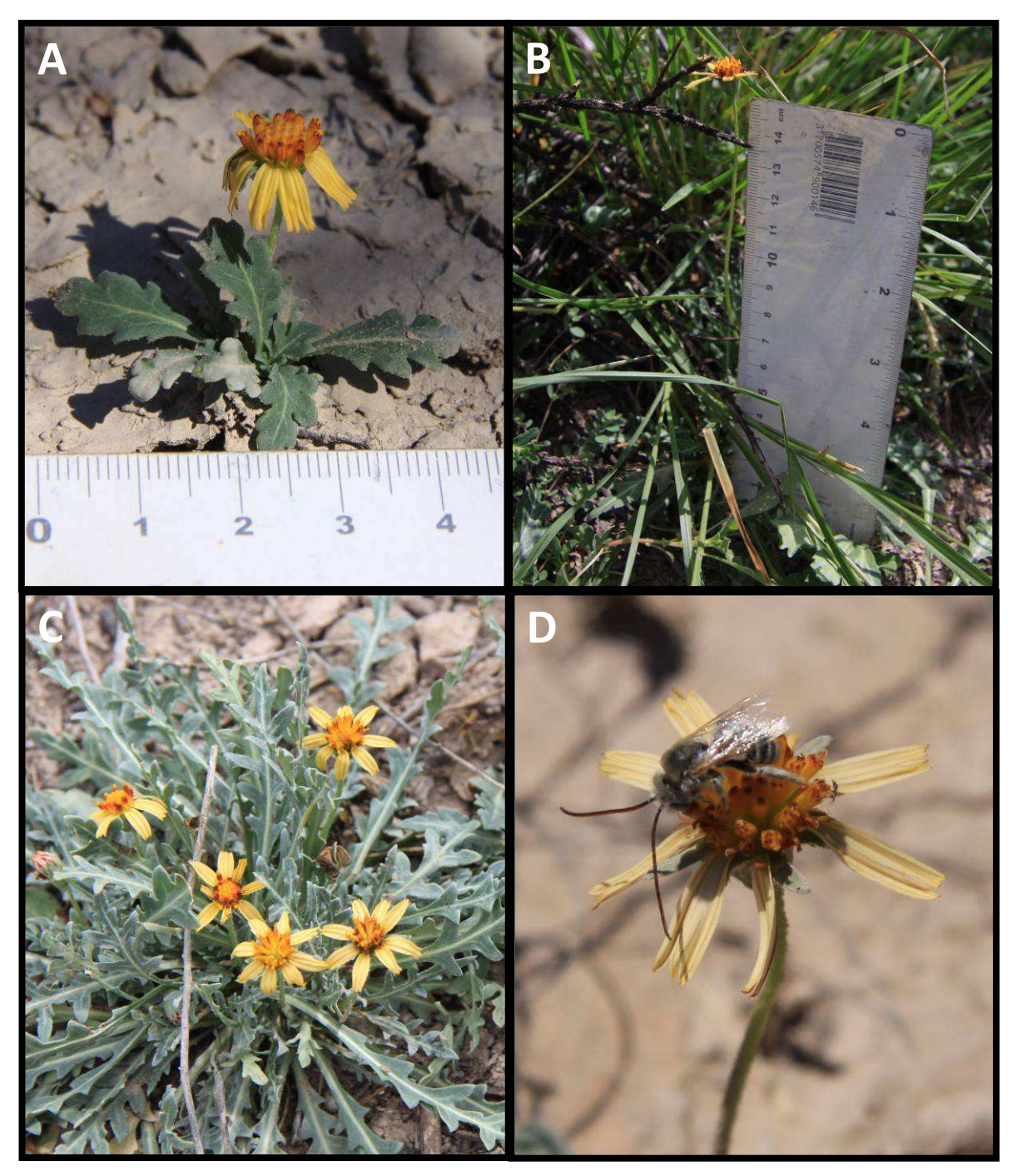
Figure 2. A. Habit of very small individual of Plateilema palmeri . B. Habit of individual with long peduncle ( Jackson 218 , SRSC). C. Example of individual with multiple heads. D. Male long-horned bee visiting P. palmeri at anthesis; bee identified tentatively as Melissodes sp.