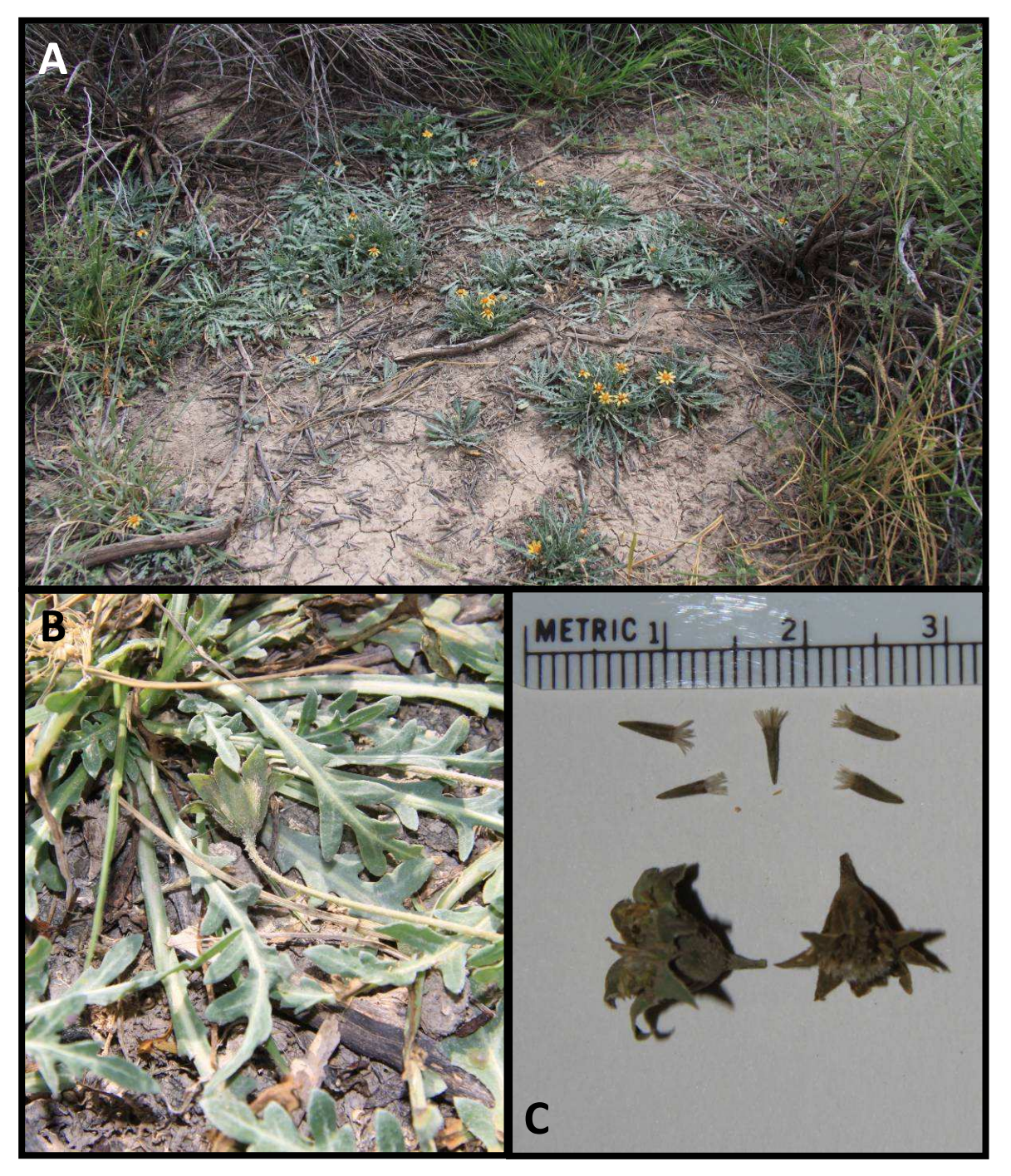
Figure 5. A. Robust group of Plateilema palmeri growing in open space within banded vegetation. B. Mature head lying on the soil surface; peduncle collapse appears to be the common aspect at maturity. C. Mature cypselae and heads.