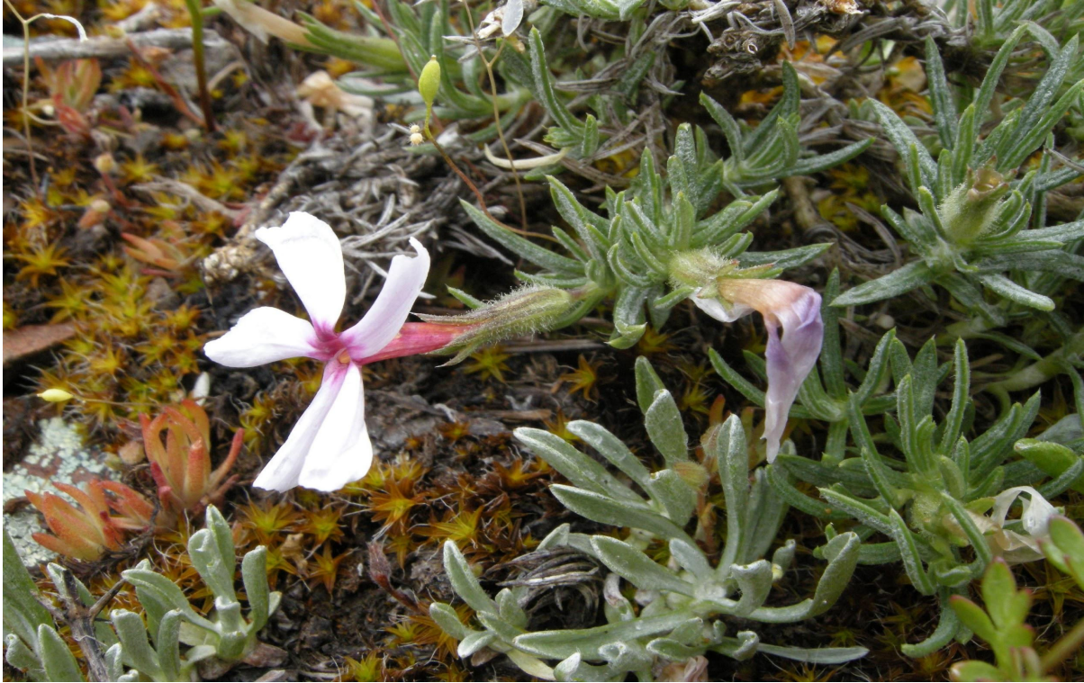
Figure 5. Flowering stems of P. solivagus (note that numerous other taxa are visible in the image). Image was taken at the Cape Horn Ridge site, Garfield Co., Washington.