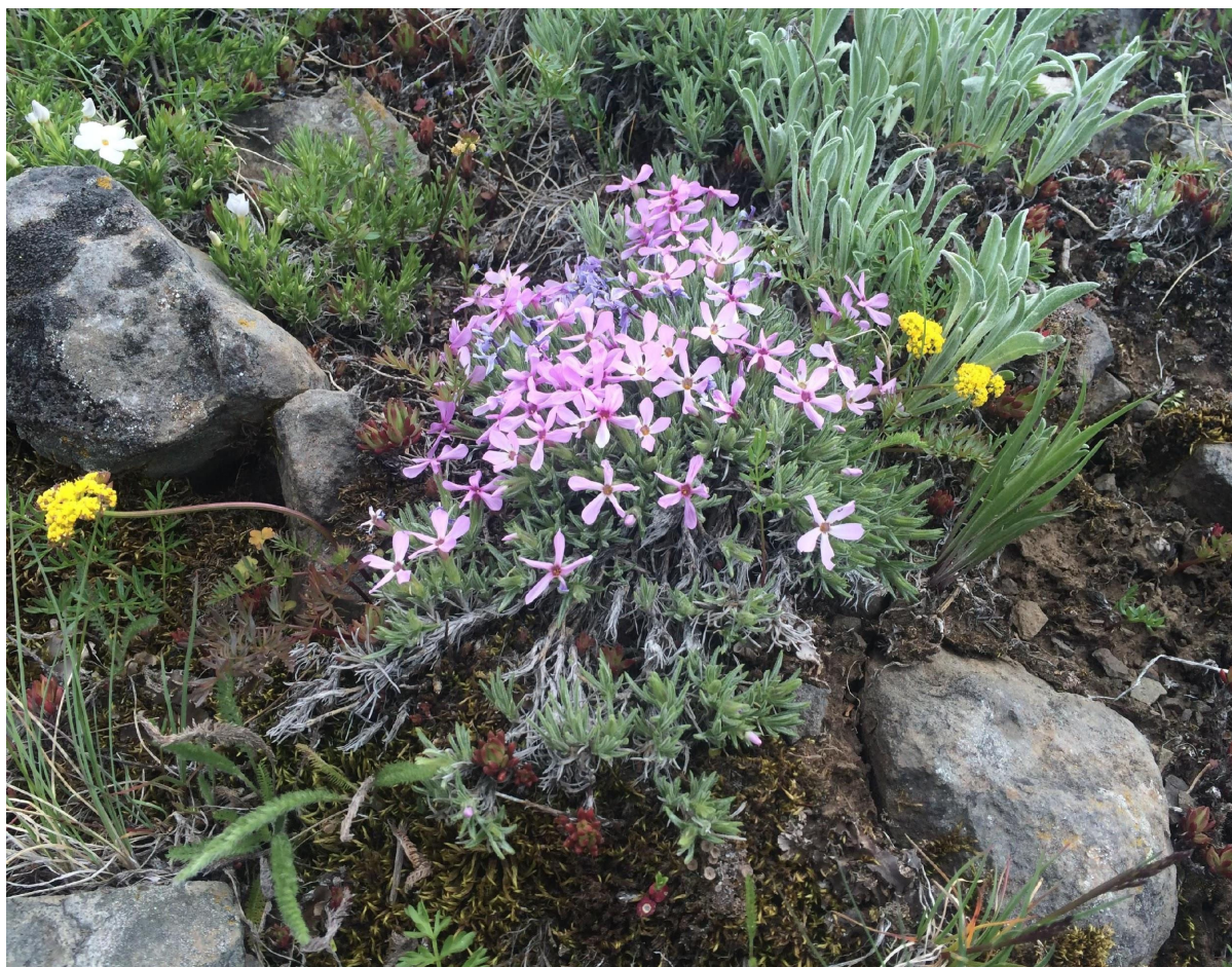
Figure 3. Phlox solivagus habit. Image was taken at the type locality, vicinity of Griffin Peak, Columbia Co., Washington. An individual of P. multiflora , which co-occurs at this site, is visible at top left.