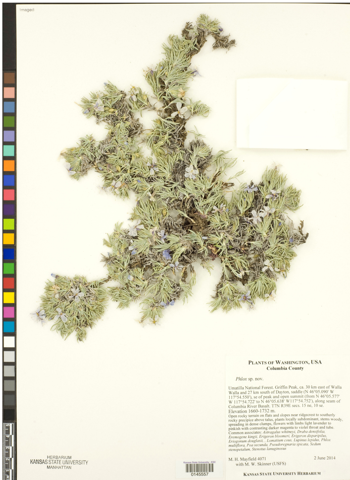
Figure 1. Phlox solivagus holotype (KSC).