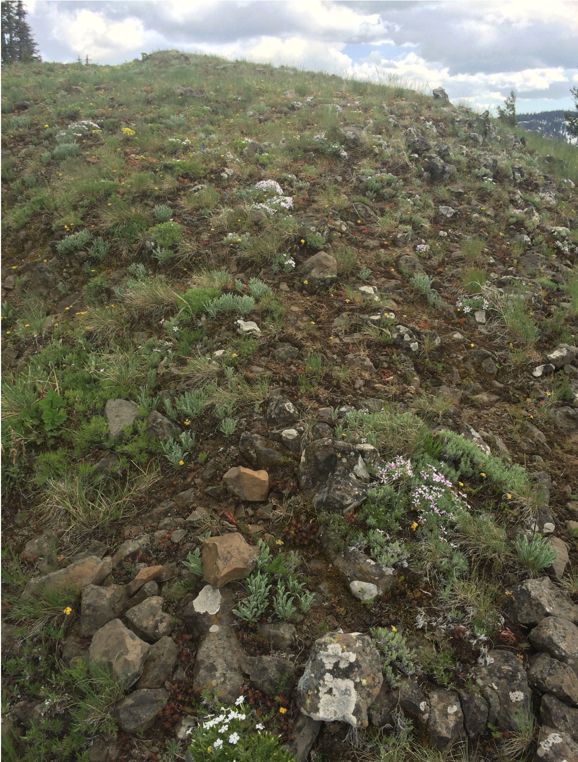
Figure 4. Habitat of the new species on rocky, sparsely vegetated slopes at the type locality on the north side of Griffin Peak (Columbia Co., Washington). Flowering individuals of P. solivagus (lavender pink corollas, gray-green herbage) are visible throughout the image (with one plant obvious in the lower right quadrant of the image; some individuals of P. multiflora [white corollas, green herbage] are also visible in this area).