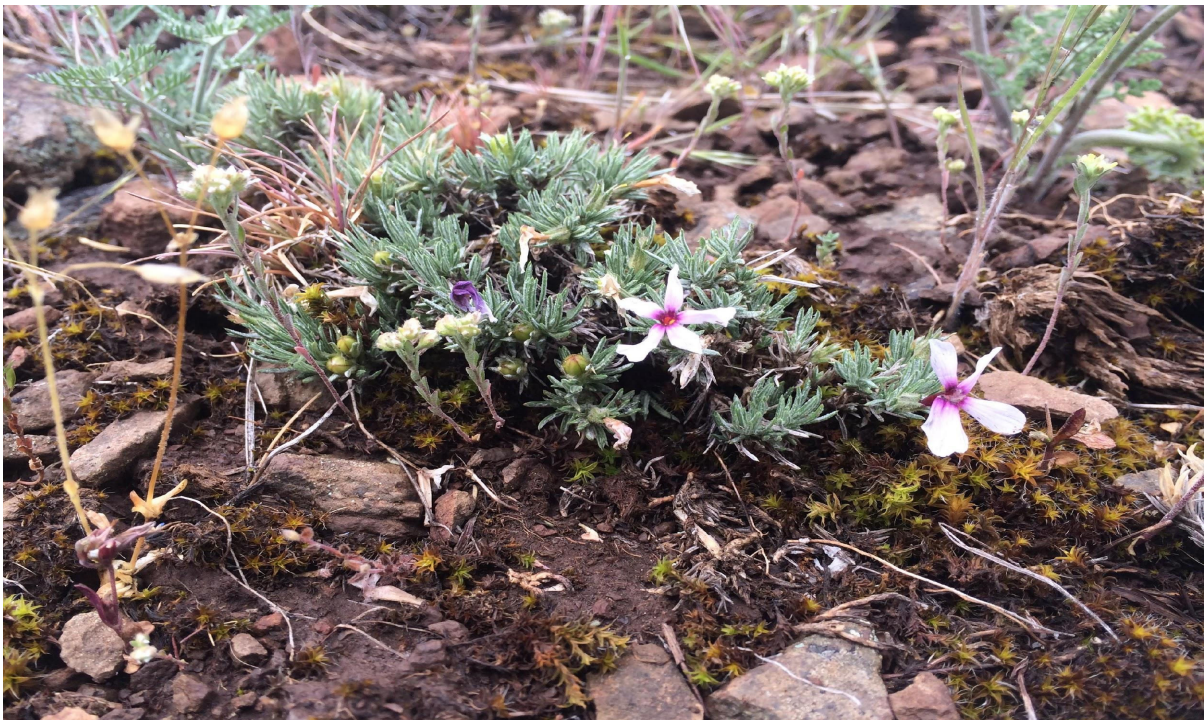
Figure 6. Phlox solivagus individual with senescing flowers and developing fruits (Cape Horn Ridge, Garfield Co., Washington).