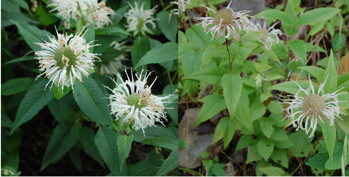
Figure 2. Monarda austroappalachiana in its natural habitat, Ocoee River Gorge, Polk County, Tennessee.