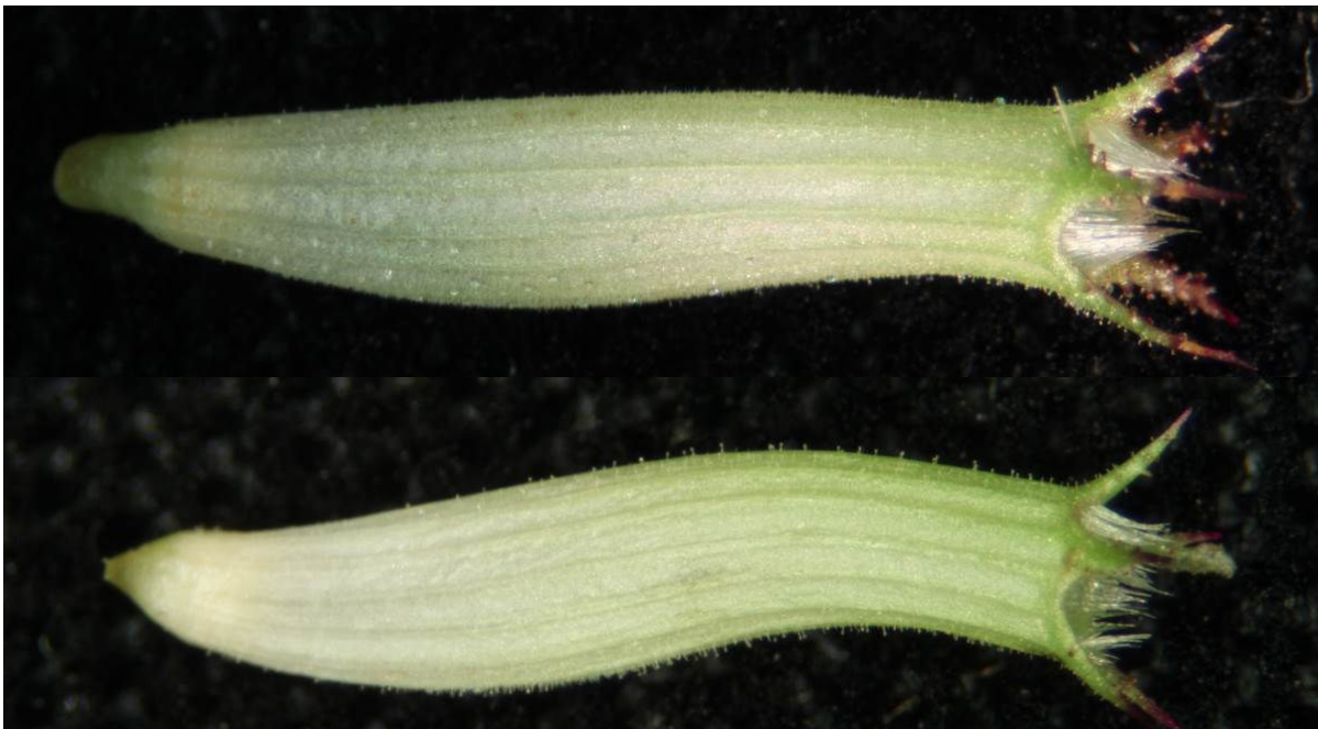
Figure 3. Calyces of Monarda austroappalachiana showing the short stipitate glands on the tube, the reddish stout glands on the calyx lobes, and the hirsute calyx orifice. Calyces ca. 1 cm long.