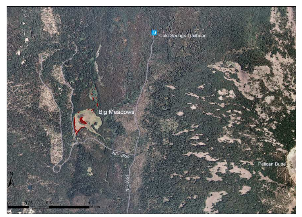
Figure 5. Aerial photo showing mapped occurrences of Castilleja collegiorum , marked in red, within the Big Meadows complex.