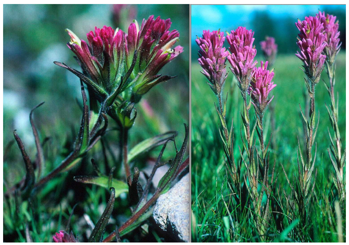
Figure 10. Castilleja lassenensis (left), Emerald Lake, Mt. Lassen National Park, Shasta Co., California, 11 Jul 1997, and C. lemmonii, Sierra Nevada form (right), Tuolumne Meadows, Yosemite National Park, Tuolumne Co., California, 7 Aug 1993.