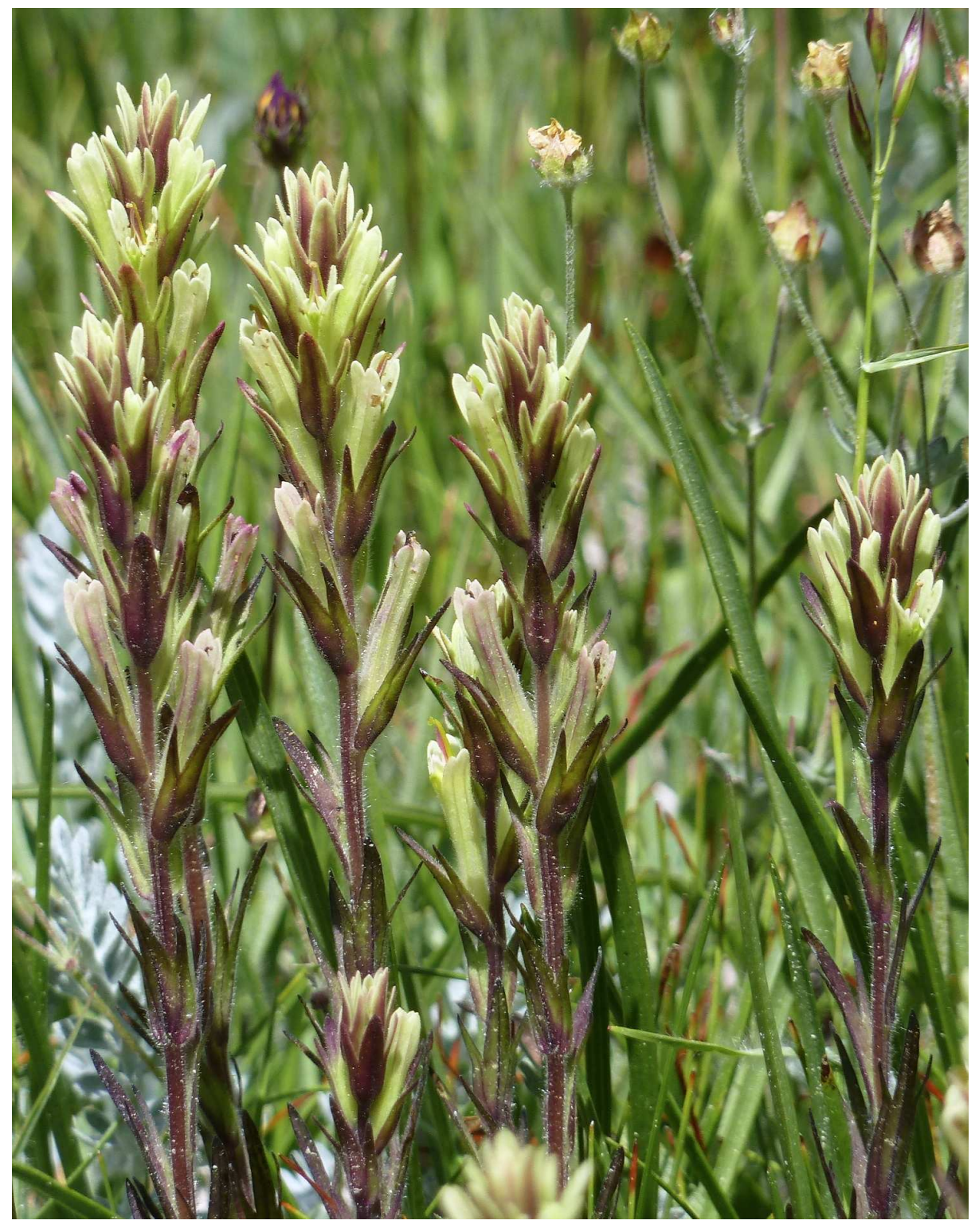
Figure 1. Castilleja collegiorum in the field, Big Meadows, Klamath Co., Oregon, 15 Jul 2013.