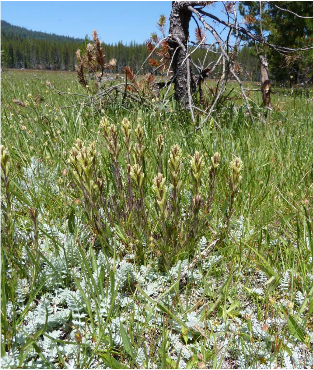
Figure 8. Habitat of Castilleja collegiorum at Big Meadows, with Potentilla breweri, 15 Jul 2013.