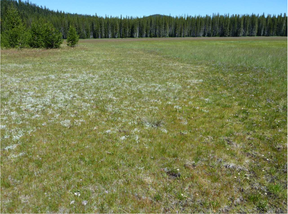
Figure 7. Habitat of Castilleja collegiorum , Big Meadows, 15 Jul 2013. Plants occur mostly in left side of the photo, between the trees on the left and the lower, wetter ground on the right.