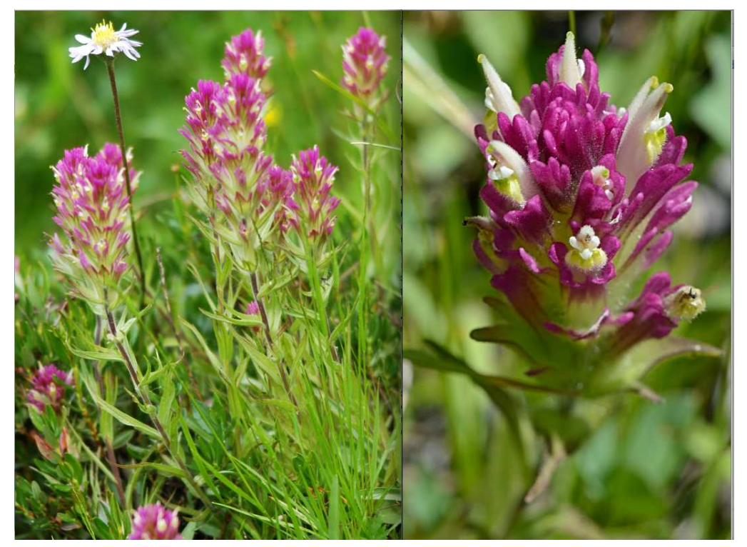
Figure 11. Castilleja lassenensis , Kings Creek Picnic Area, Mt. Lassen National Park, Shasta Co., California, 12 Aug 2004 (left) and 23 Jul 2014 (right).