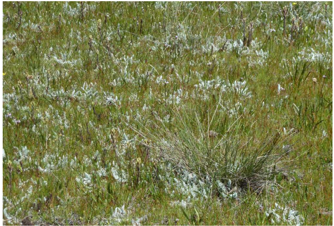
Figure 6. Habitat of Castilleja collegiorum , Big Meadows, 15 Jul 2013. The silvery-leaved plant is Potentilla breweri , a frequent associate of C. collegiorum .

Castilleja collegiorum has been observed in flower from 6 July to 26 July. The timing and duration of flowering likely vary annually depending on the depth and persistence of the snowpack and the amount of ponding in the meadows. No potential pollinators, either avian or insect, were noted visiting the flowers of C. collegiorum in the field, and we observed little if any evidence of predation on the plants by animals of any sort.