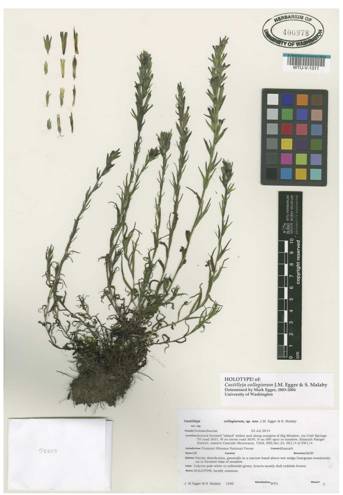
Figure 2. Holotype of Castilleja collegiorum , WTU.