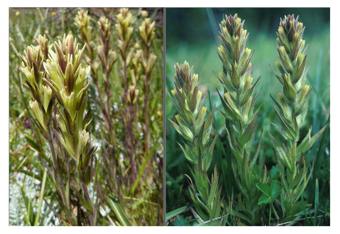
Figure 9. Castilleja collegiorum (left) at Big Meadows, 15 Jul 2013, and Castilleja cryptantha (right) at Berkeley Park, Mt. Rainier National Park, Pierce Co., Washington, 23 Aug 1993.

5. Beak of corollas about twice the length of the lower lip; corolla beaks and lower lips often exserted above the calyces, and/or primary calyx lobes spreading to reveal the distal portions of the corolla; bracts appearing to be shorter than the flowers; leaves narrower and linear-lanceolate; pollination system unknown but likely cross-pollinated by bees; endemic to Big Meadows, Klamath Co., Oregon ...... Castilleja collegiorum