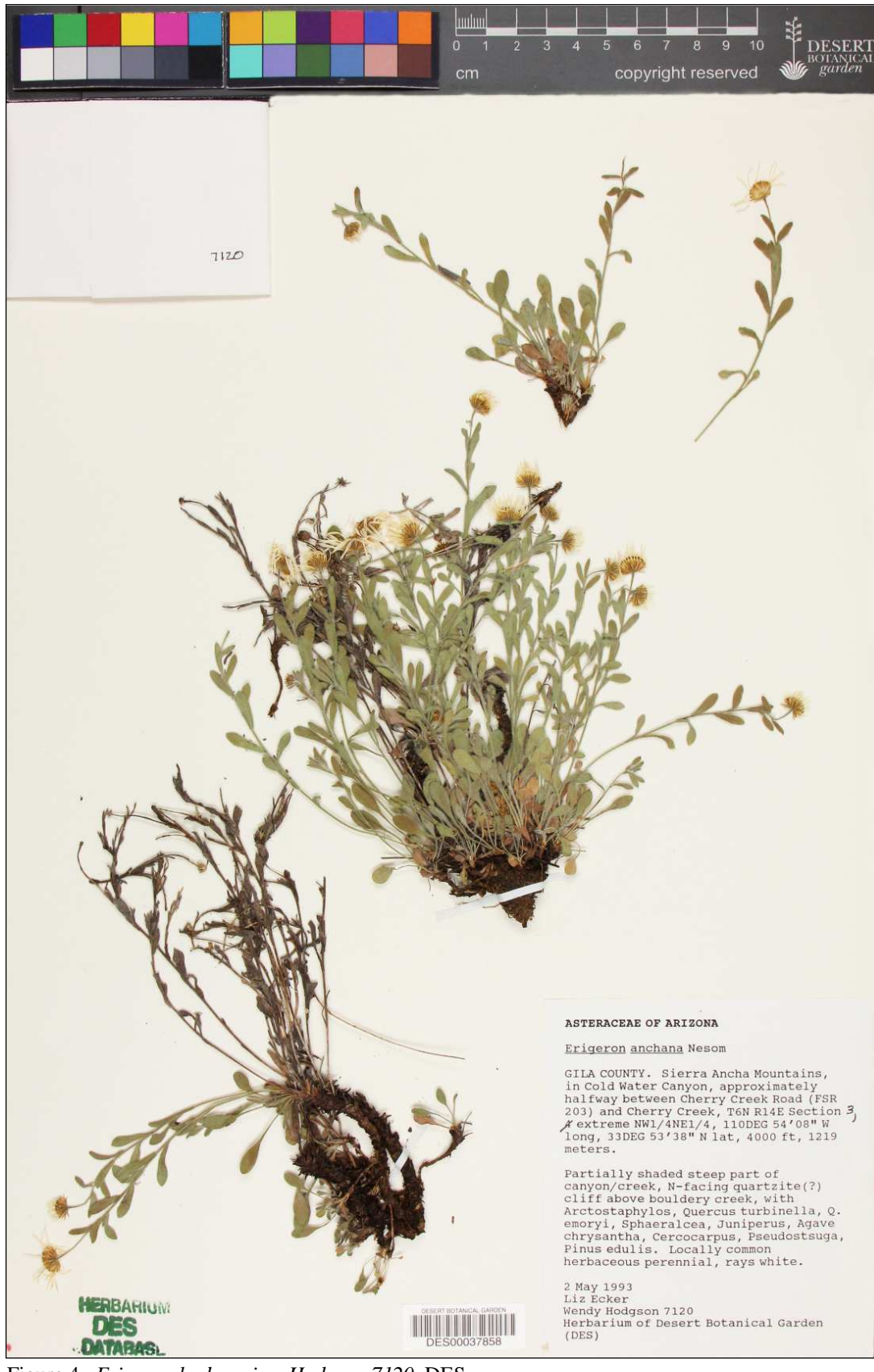
Figure 4. Erigeron hodgsoniae, Hodgson 7120, DES.