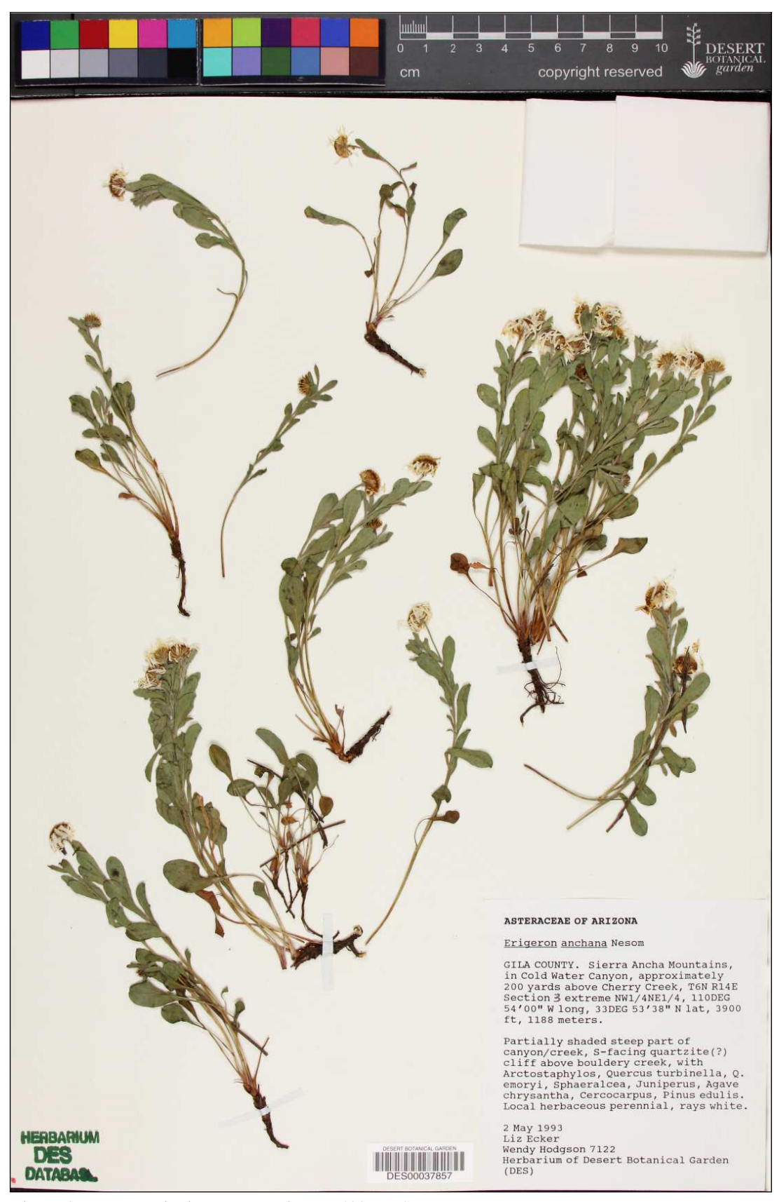
Figure 3. Erigeron hodgsoniae, Hodgson 7122, DES.