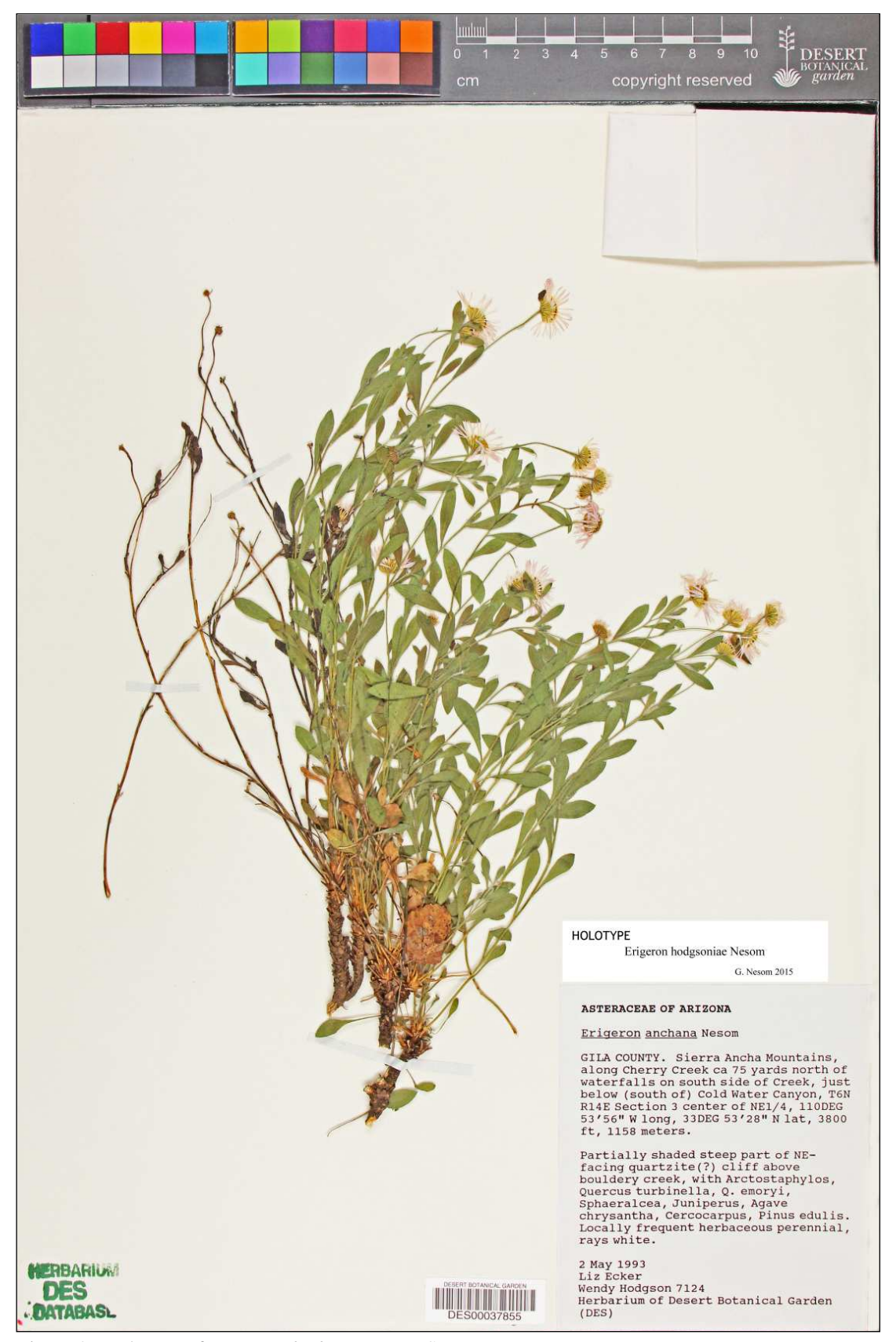
Figure 2. Holotype of Erigeron hodgsoniae, DES.