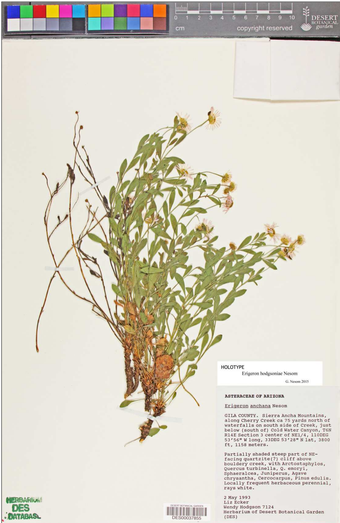
Figure 2. Holotype of Erigeron hodgsoniae , DES.