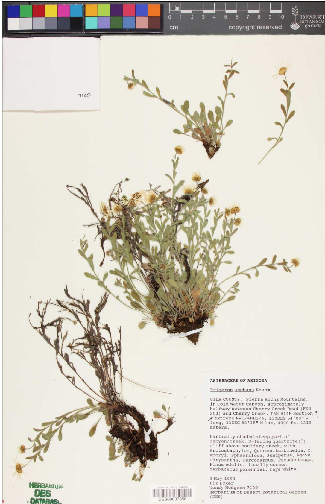
Figure 4. Erigeron hodgsoniae , Hodgson 7120, DES.