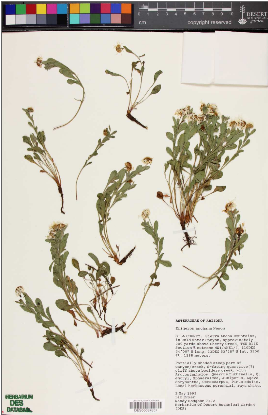
Figure 3. Erigeron hodgsoniae , Hodgson 7122, DES.