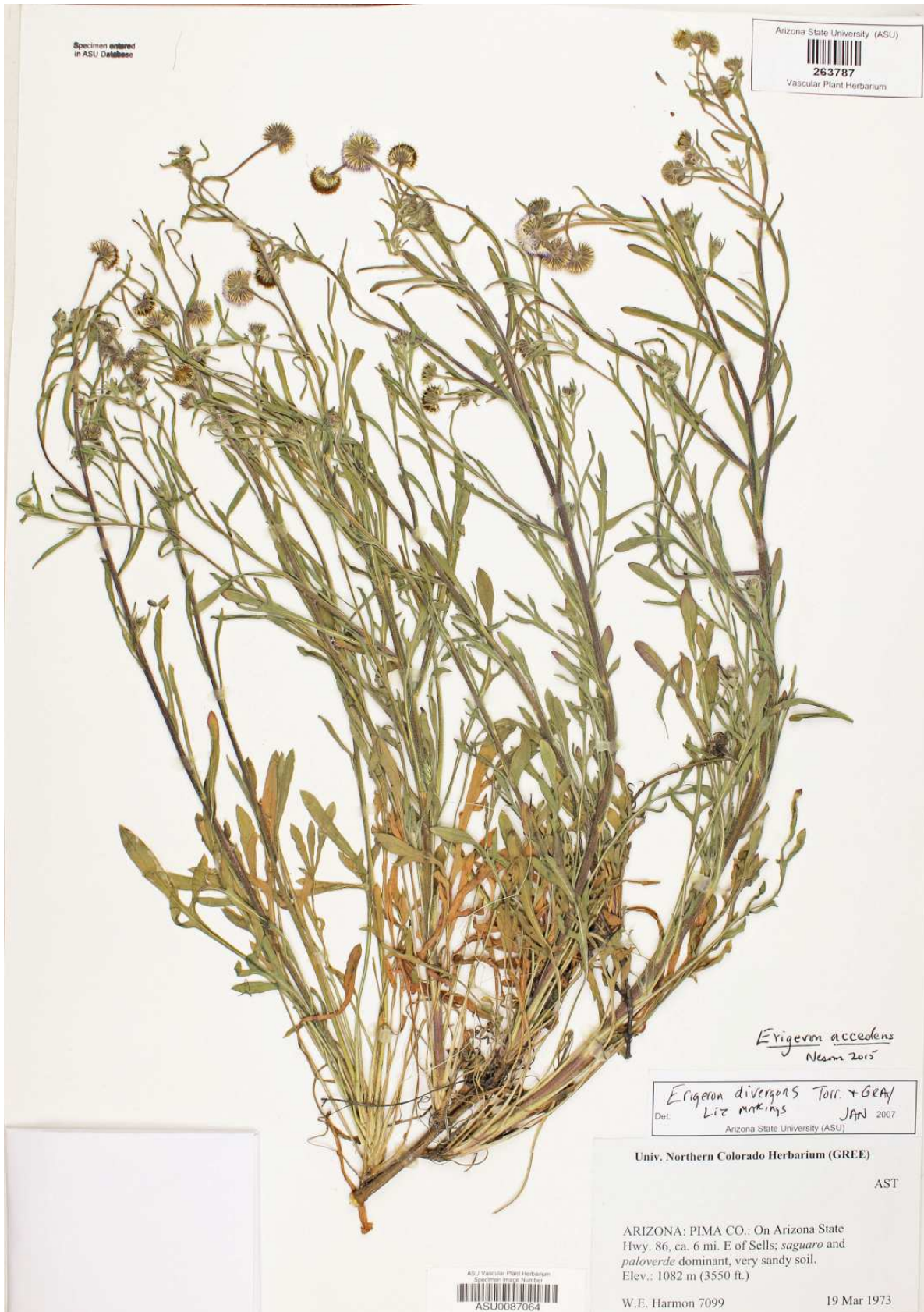
Figure 13. Erigeron incompus , Pima Co., Arizona.