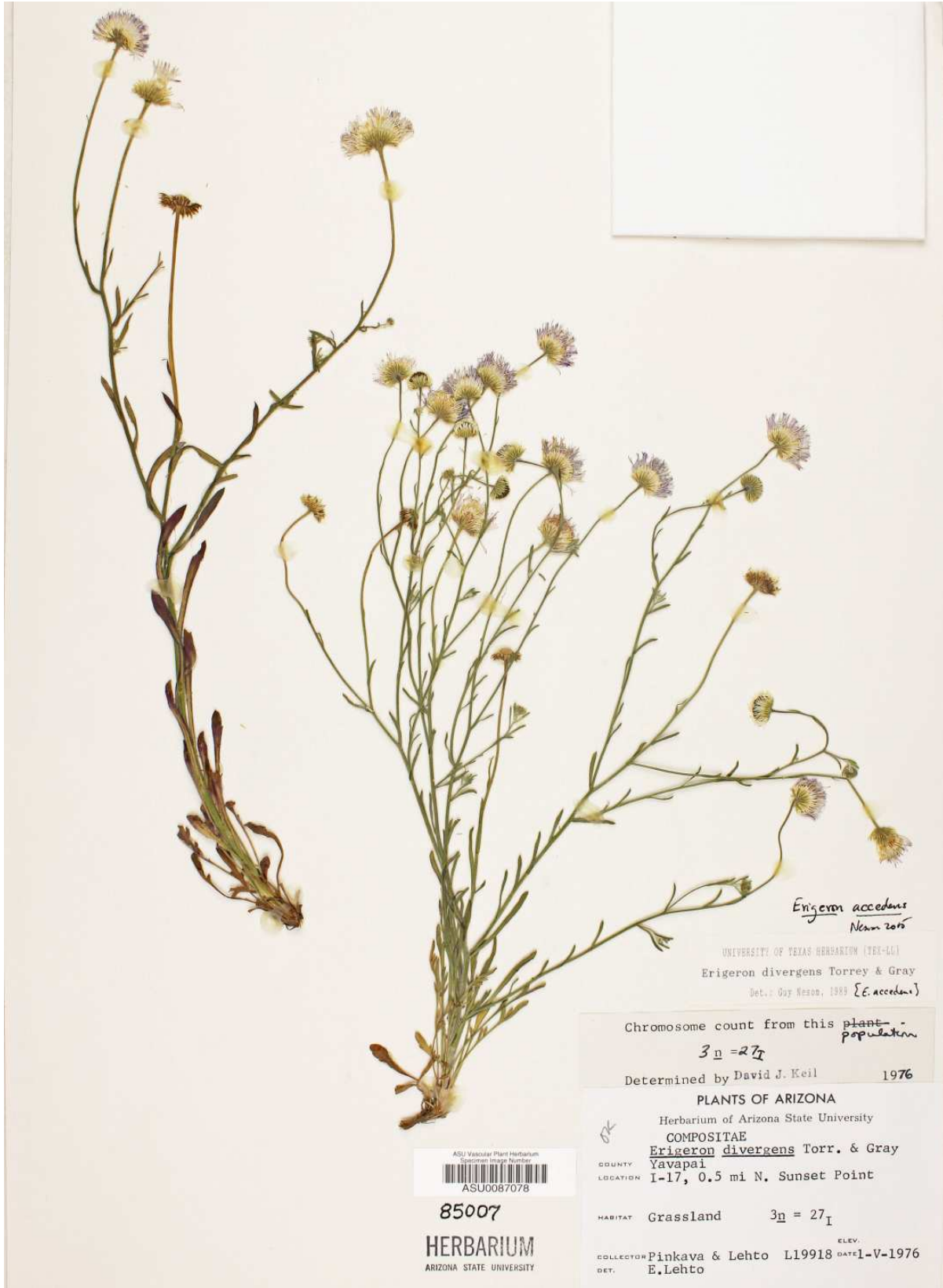
Figure 16. Erigeron incomptus , Yavapai Co., Arizona. Chromosome number 2n = 27 .