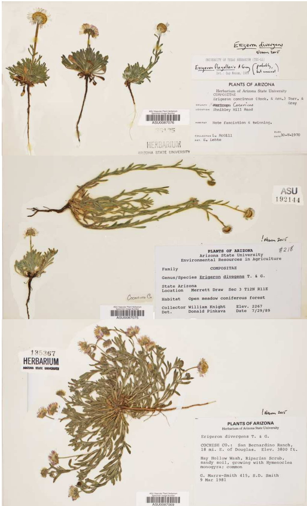
Figure 4. Erigeron divergens , Coconino and Cochise cos., multi-stemmed from the base.