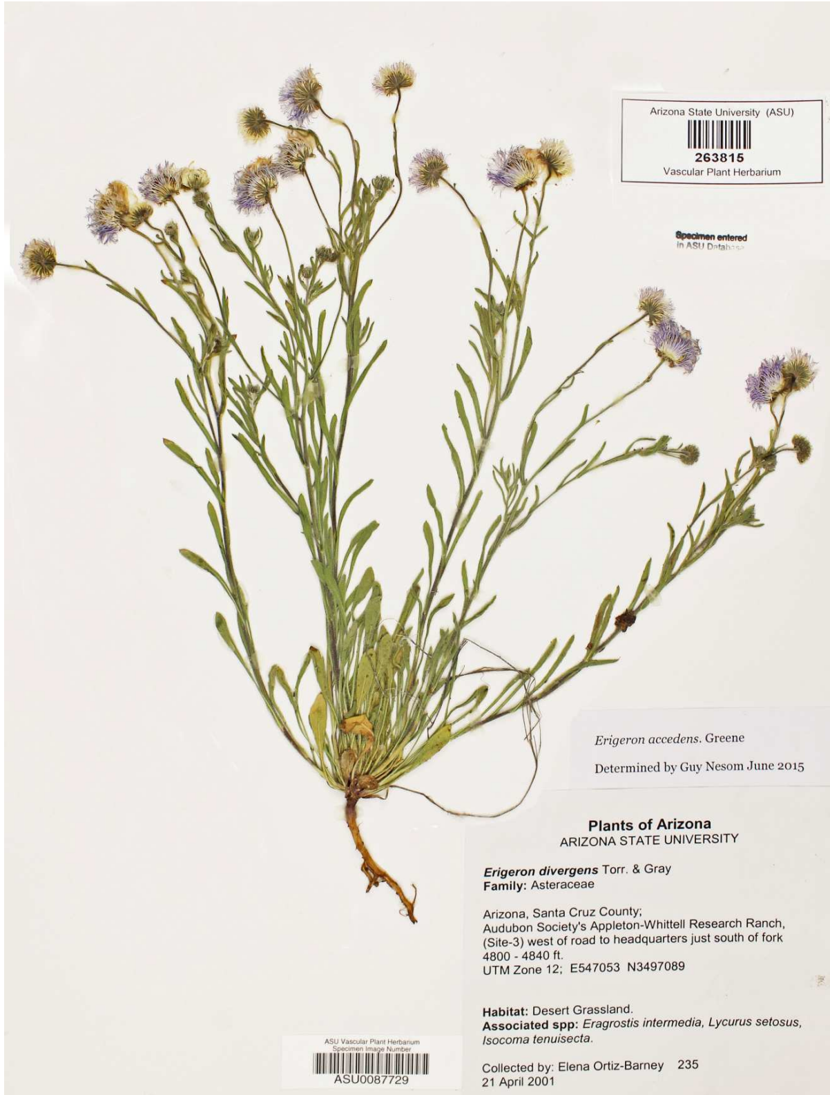
Figure 6. Erigeron incomptus > divergens , Santa Cruz Co., multi-stemmed from the base, with woody, multicapital caudex similar to that of E. incomptus . Lower leaves entire with tendency for long, narrow petioles.