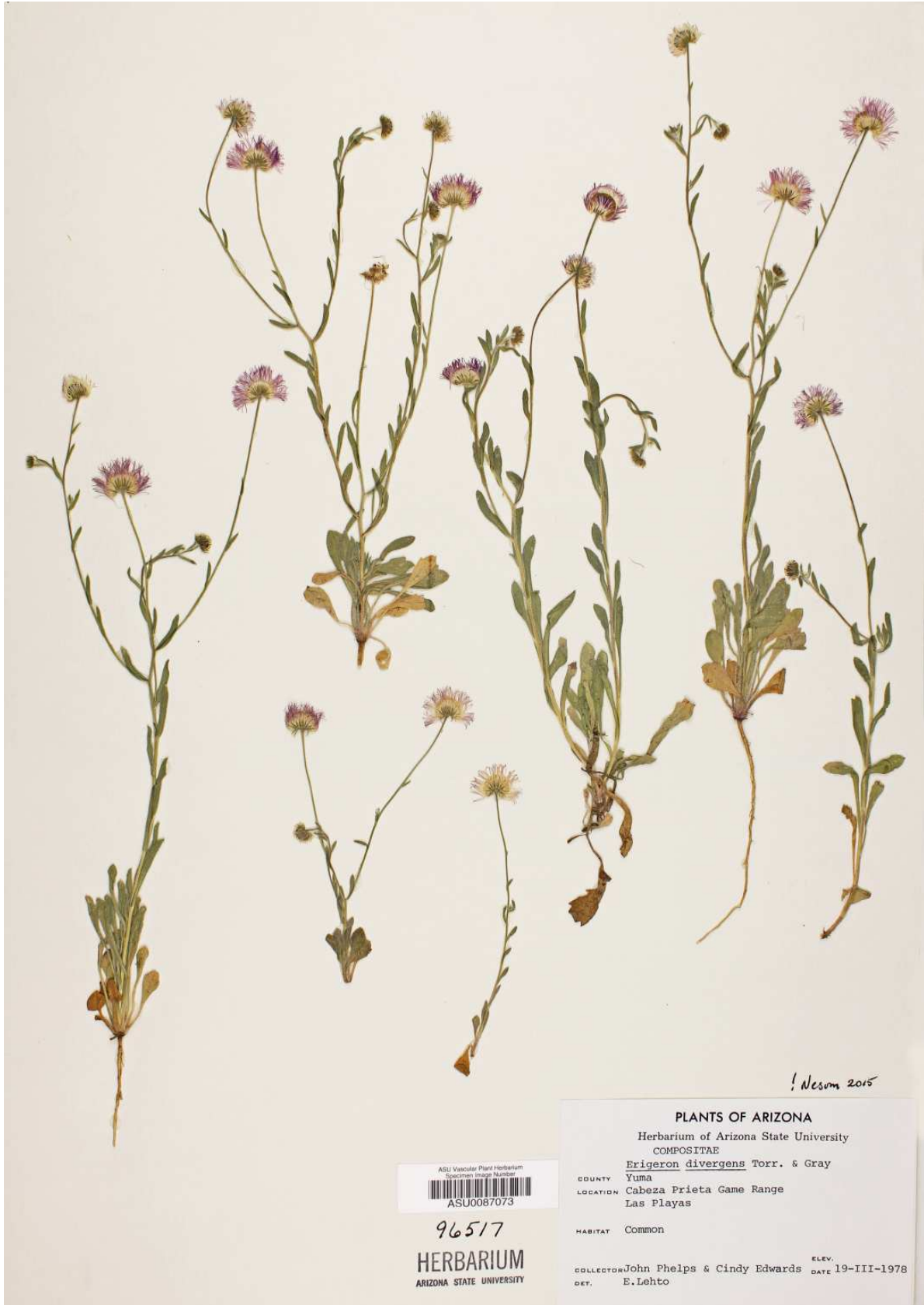
Figure 2. Erigeron divergens , Yuma Co., Arizona, single-stemmed from the base.