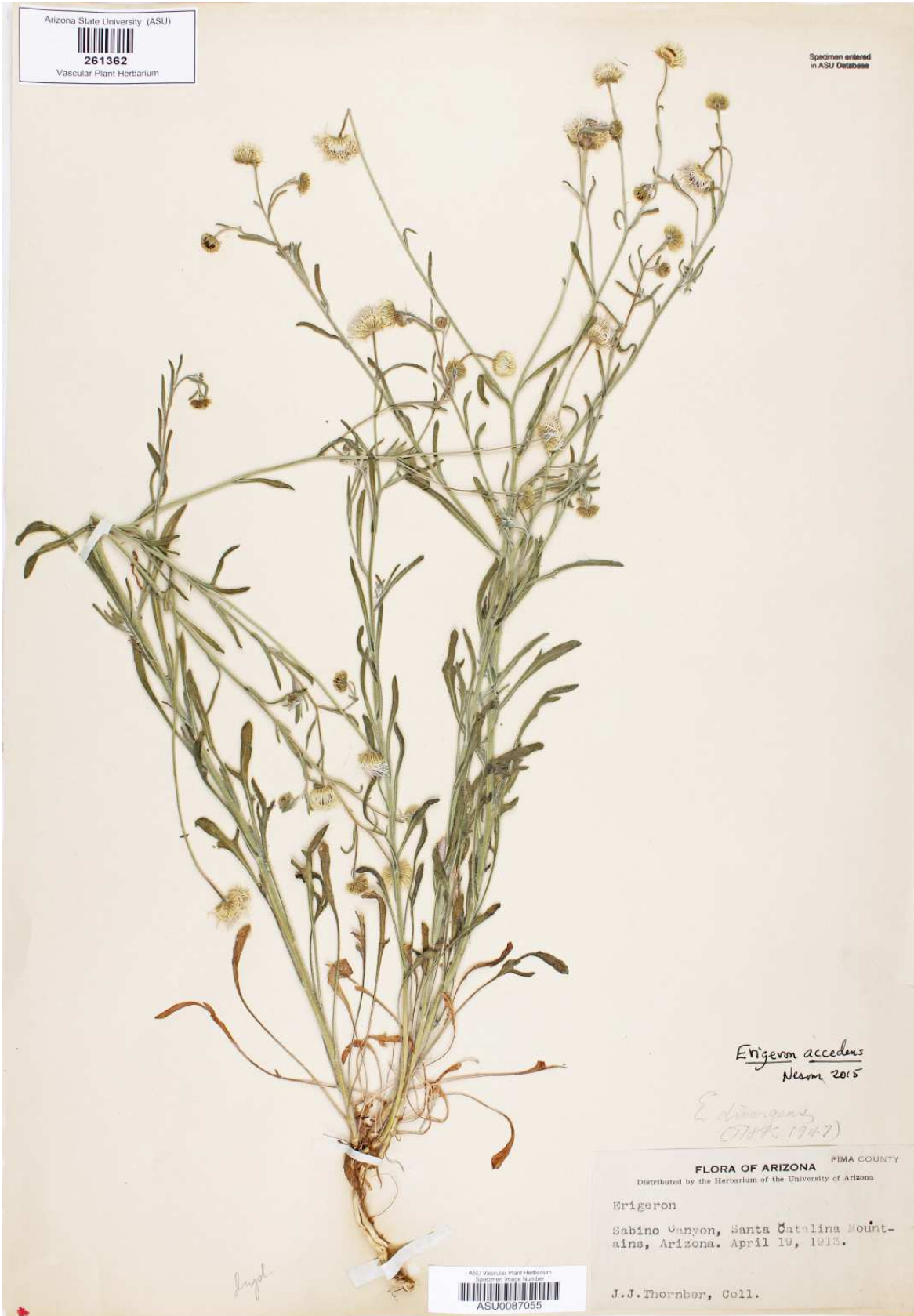
Figure 9. Erigeron incomptus , Pima Co., Arizona.