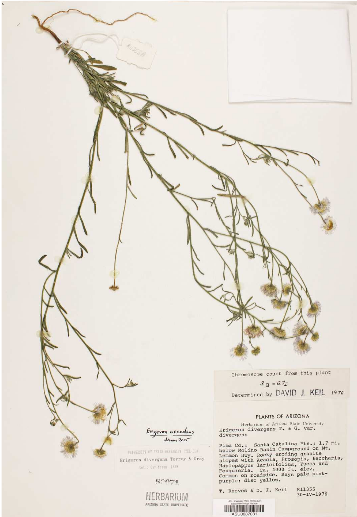
Figure 18. Erigeron incomptus , Pima Co., Arizona. Chromosome number 2n = 27 .