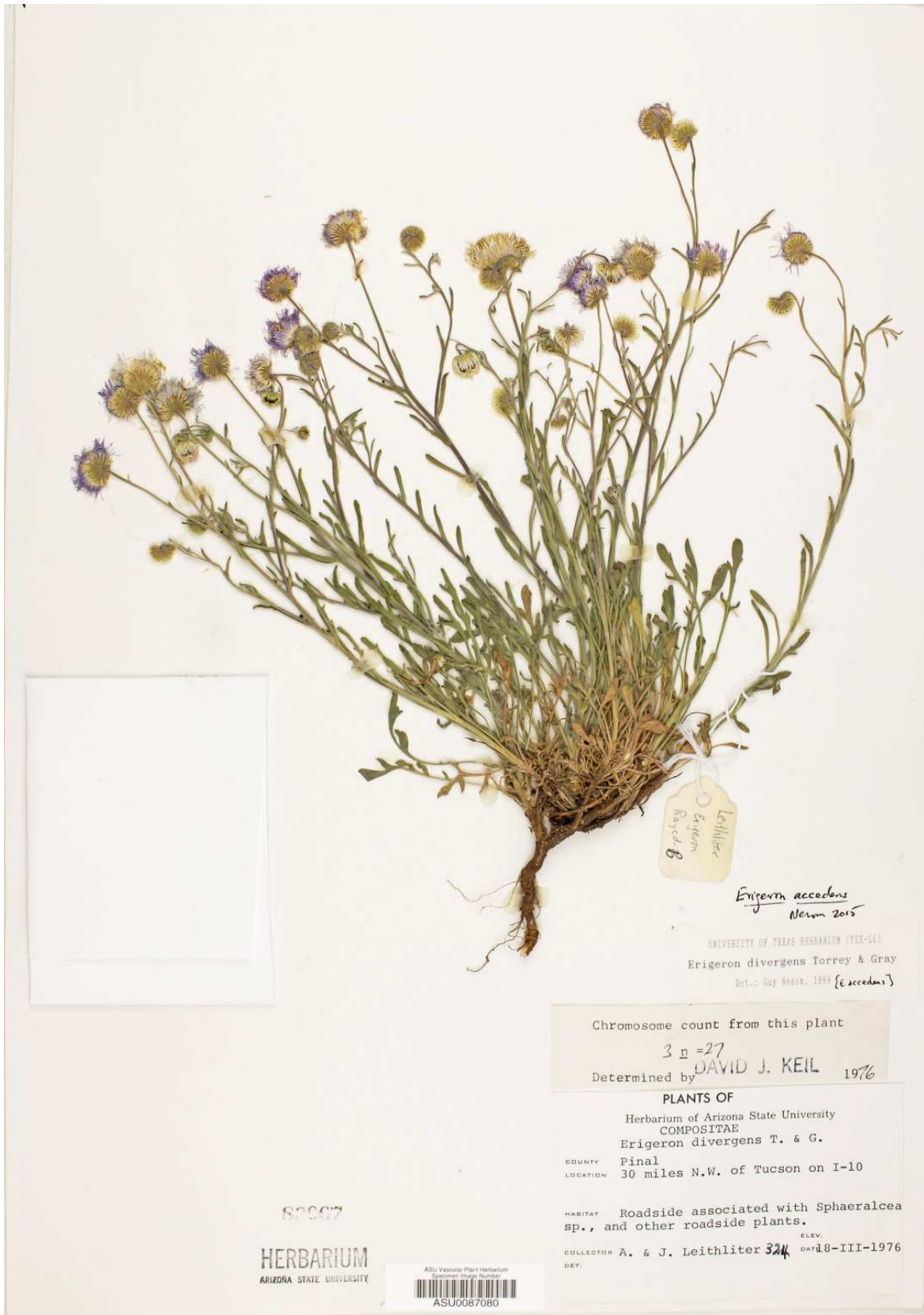
Figure 19. Erigeron aff. incomptus , Pinal Co., Arizona, perhaps a hybrid with E. tracyi . Chromosome number 2n = 27 .