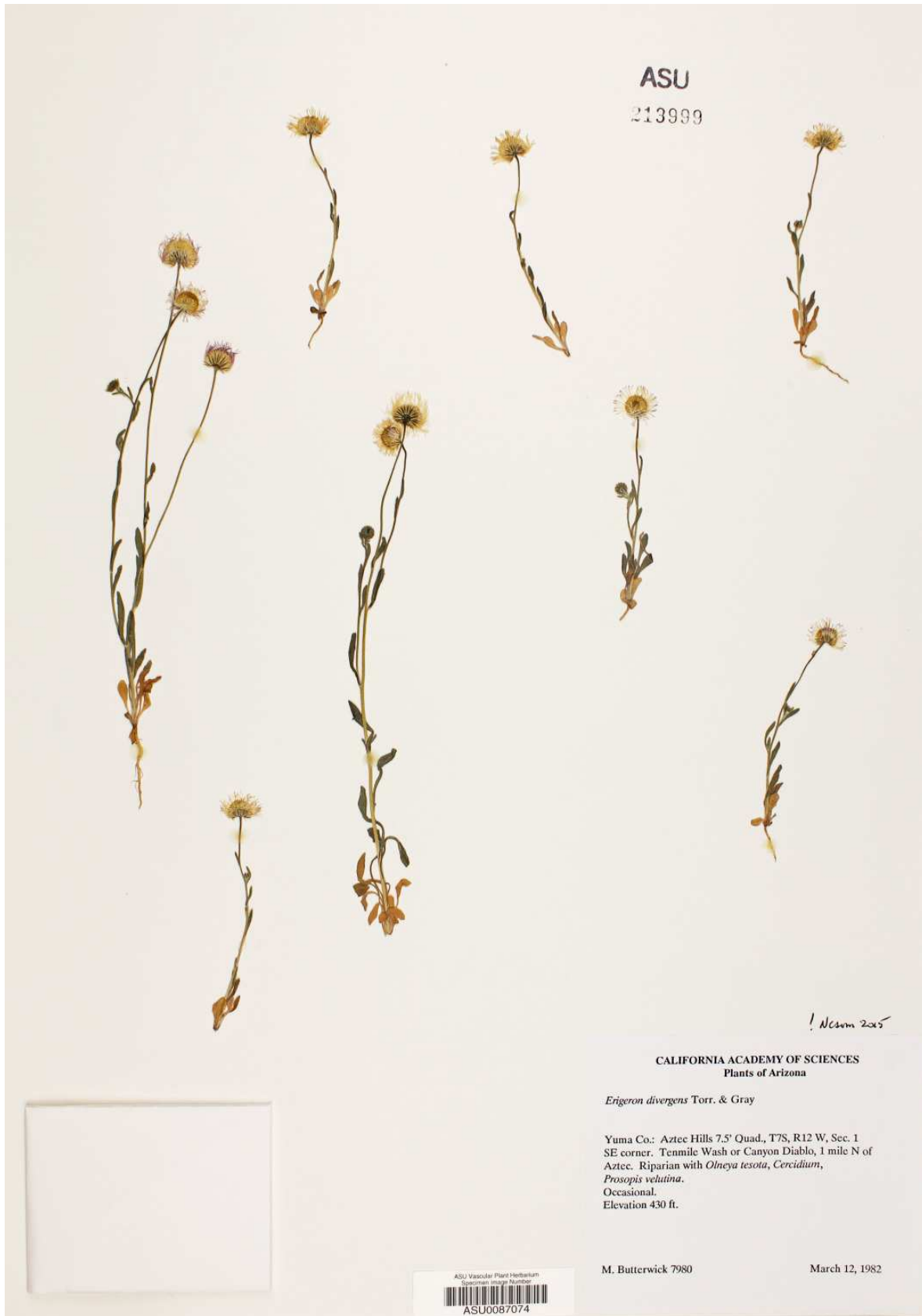
Figure 1. Erigeron divergens , Yuma Co., Arizona, single-stemmed from the base.