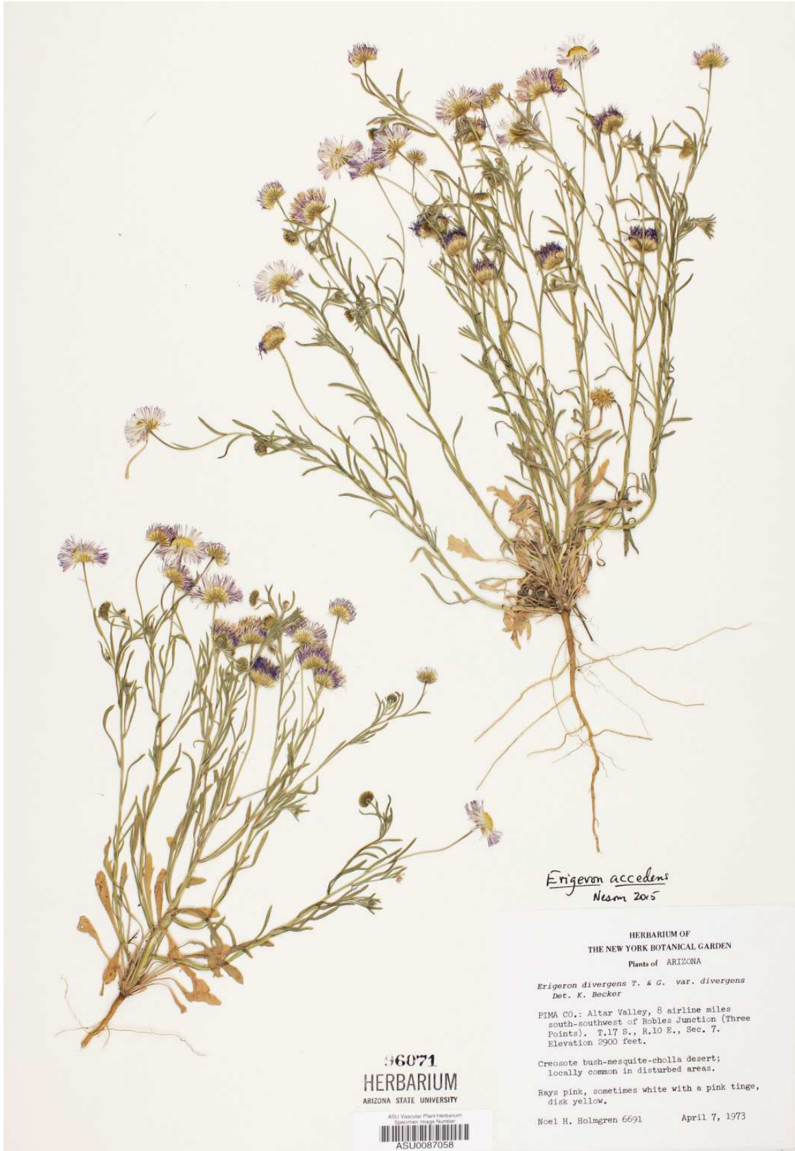
Figure 8. Erigeron incomptus , Pima Co., Arizona.