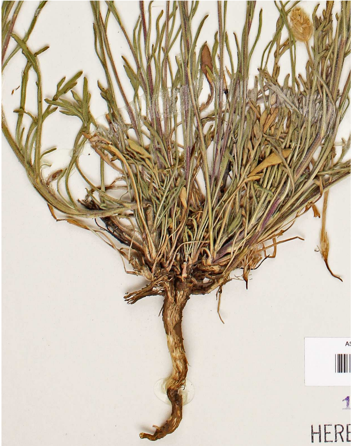
Figure 15. Erigeron incomptus , Gila Co., Arizona, Little 4242 (ASU). Multicapital caudex with characteristic, numerous meristematic apices. The plant apparently was divided in half upon its collection for a specimen.