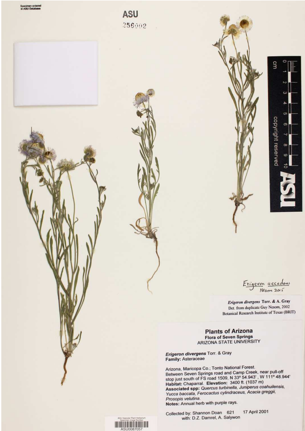
Figure 7. Erigeron incomptus , Maricopa Co., Arizona.