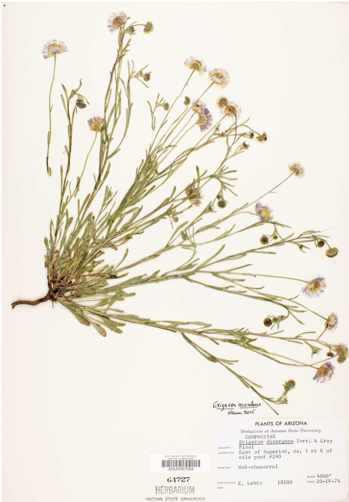
Figure 5. Erigeron incomptus > divergens , Pinal Co., Arizona, multi-stemmed from the base, with woody, multicapital caudex similar to that of E. incomptus . Lower leaves entire with tendency for long, narrow petioles.