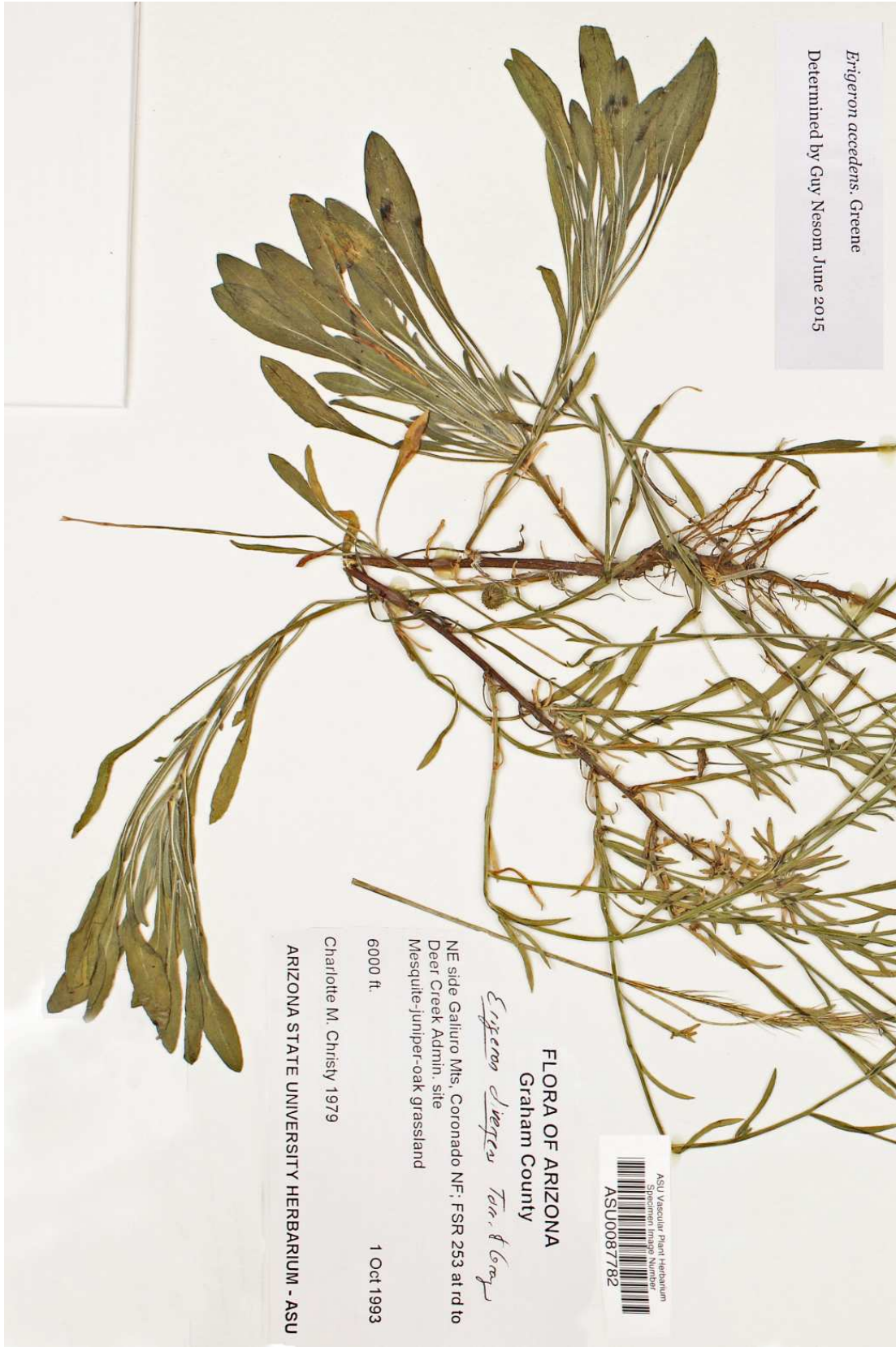
Figure 14. Erigeron incomptus , Graham Co., Arizona. Basal and lower leaves are mostly entire, but note pinnate teeth on one leaf.