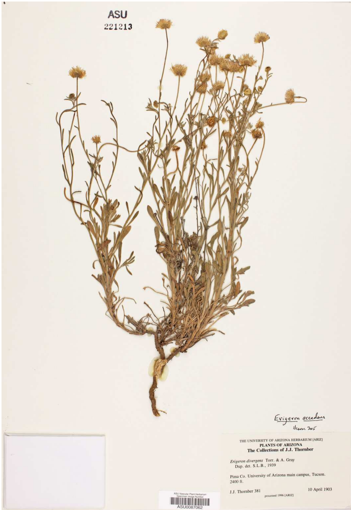
Figure 12. Erigeron incomptus , Pima Co., Arizona.