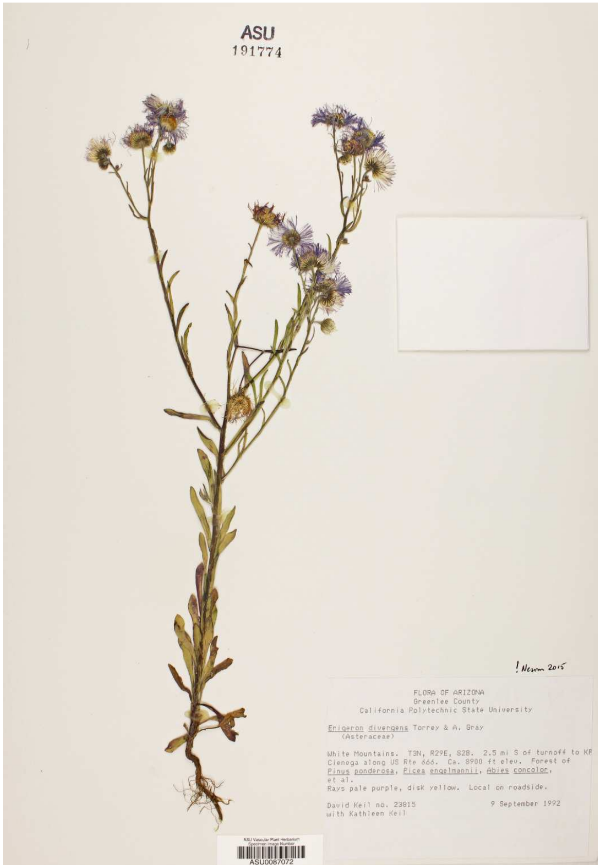
Figure 3. Erigeron divergens , Greenlee Co., Arizona, single-stemmed from the base.