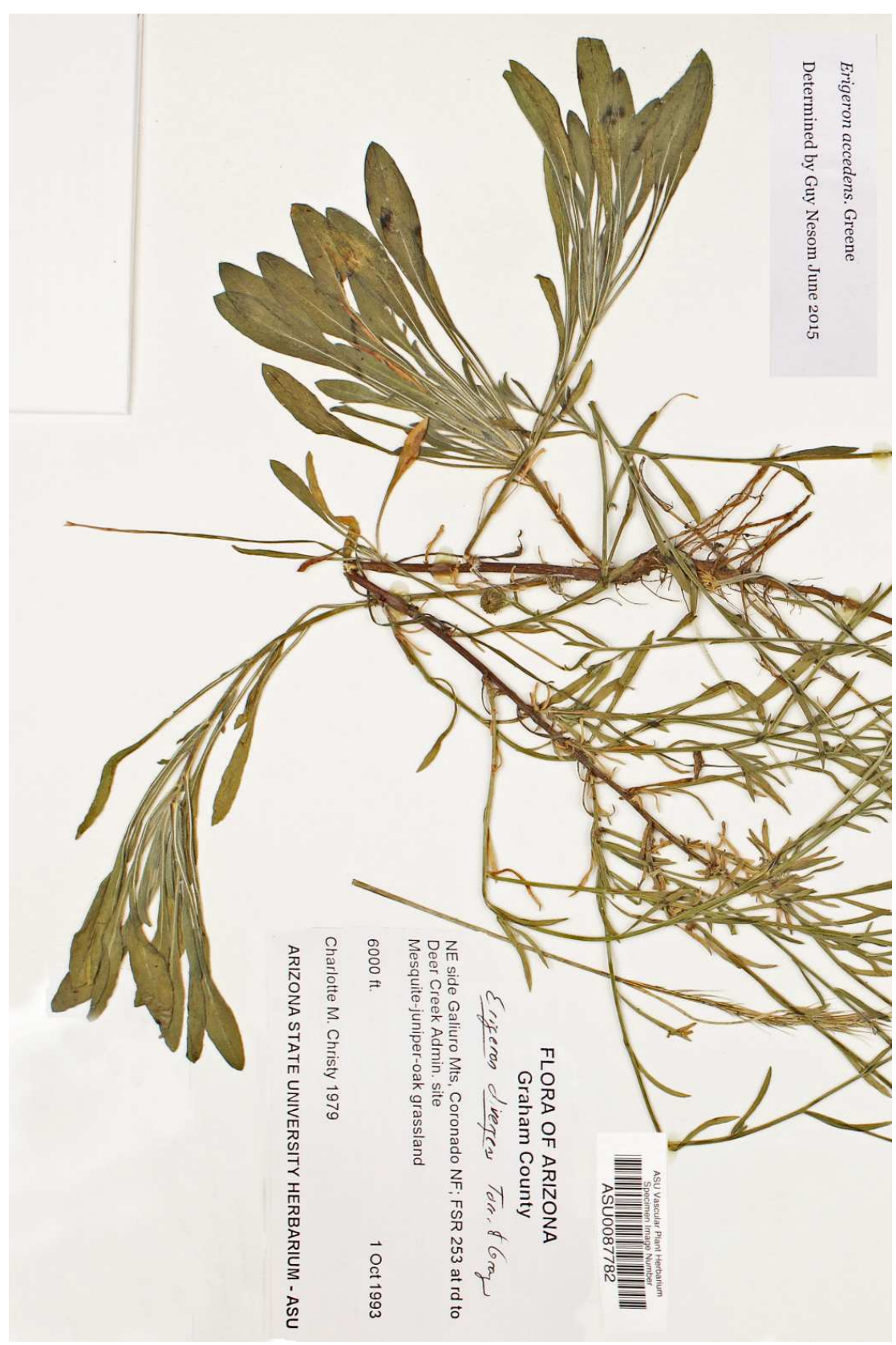
Figure 14. Erigeron incomptus , Graham Co., Arizona. Basal and lower leaves are mostly entire, but note pinnate teeth on one leaf.