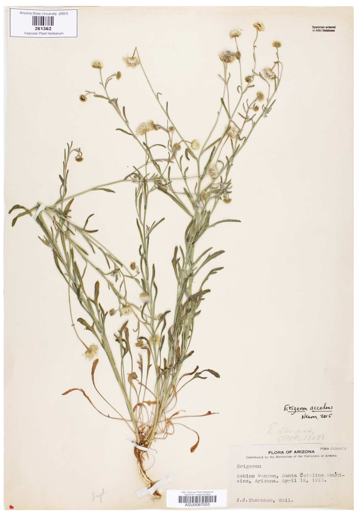
Figure 9. Erigeron incomptus, Pima Co., Arizona.