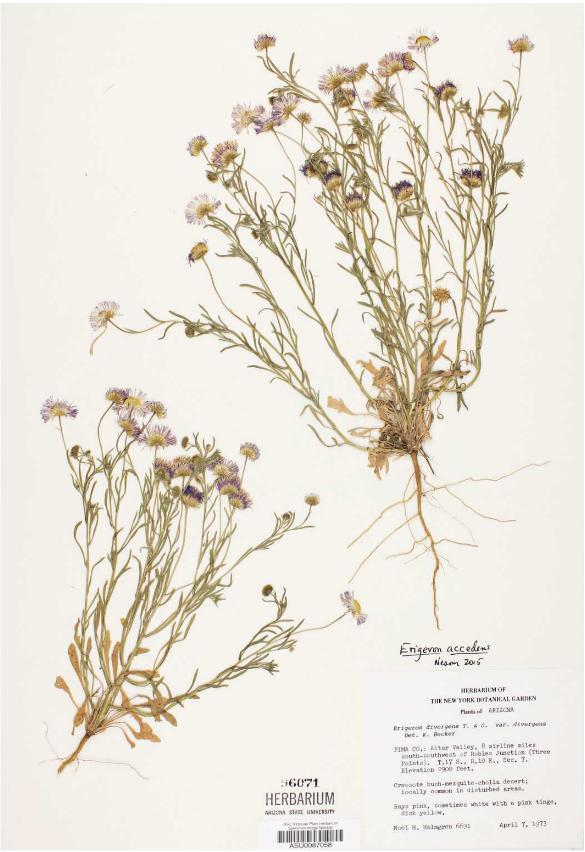
Figure 8. Erigeron incomptus, Pima Co., Arizona.