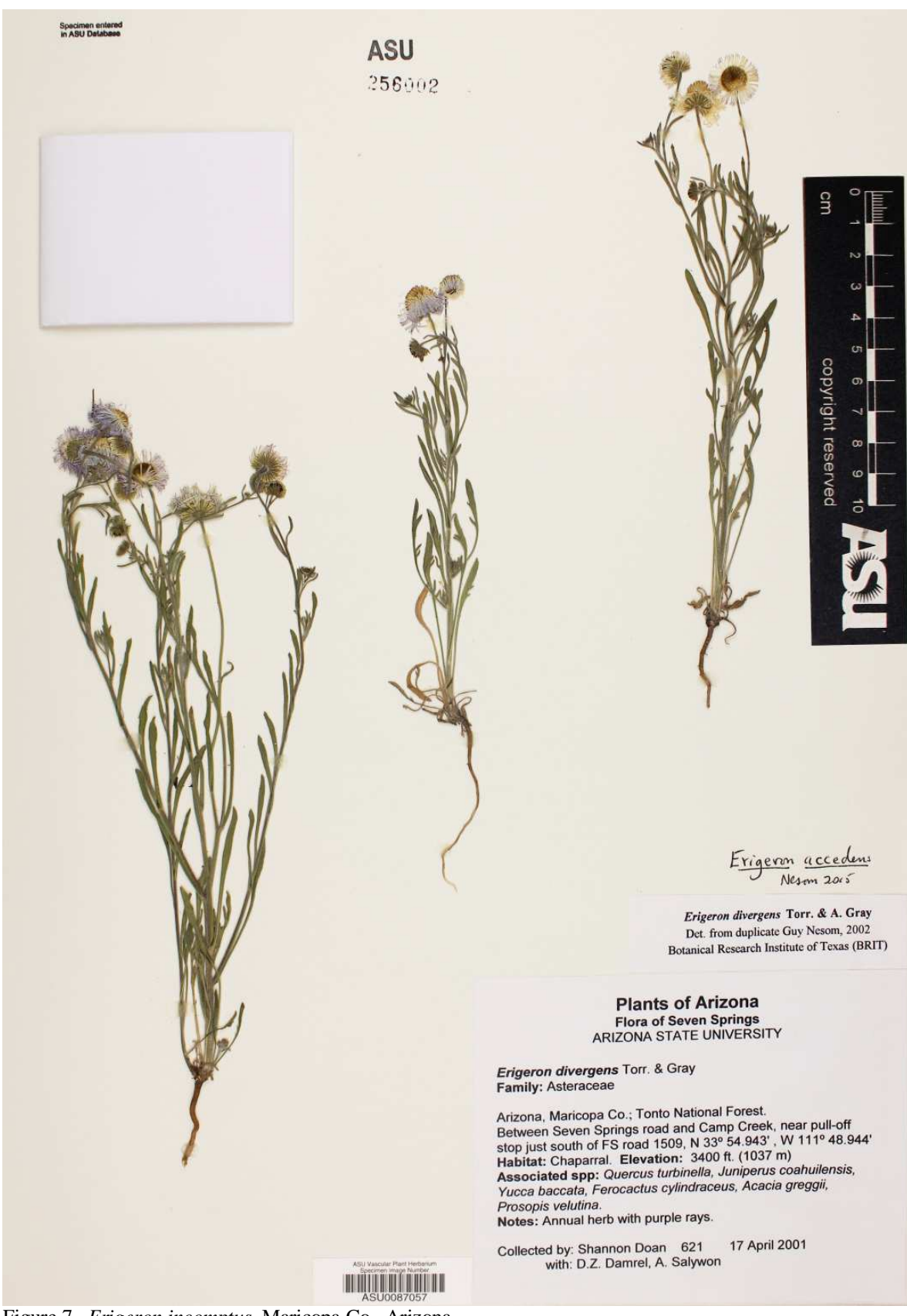
Figure 7. Erigeron incomptus, Maricopa Co., Arizona.