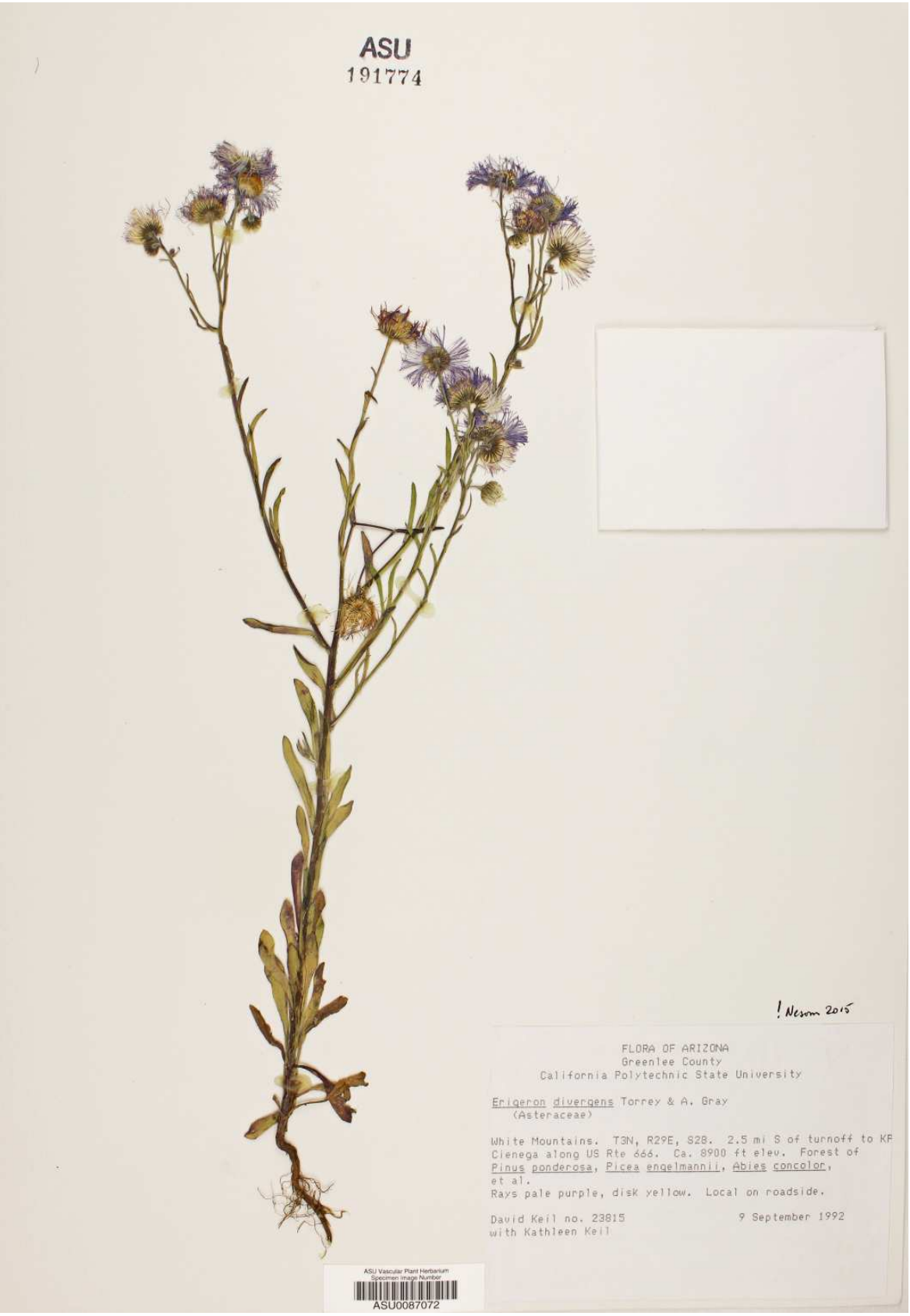
Figure 3. Erigeron divergens, Greenlee Co., Arizona, single-stemmed from the base.