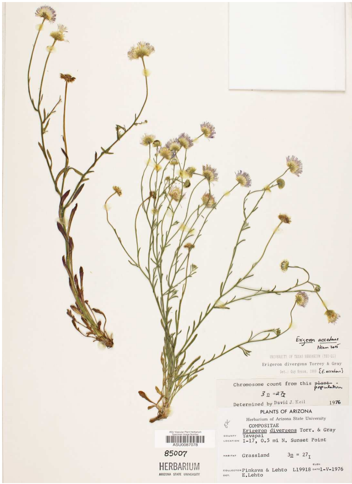
Figure 16. Erigeron incomptus, Yavapai Co., Arizona. Chromosome number 2n = 27.