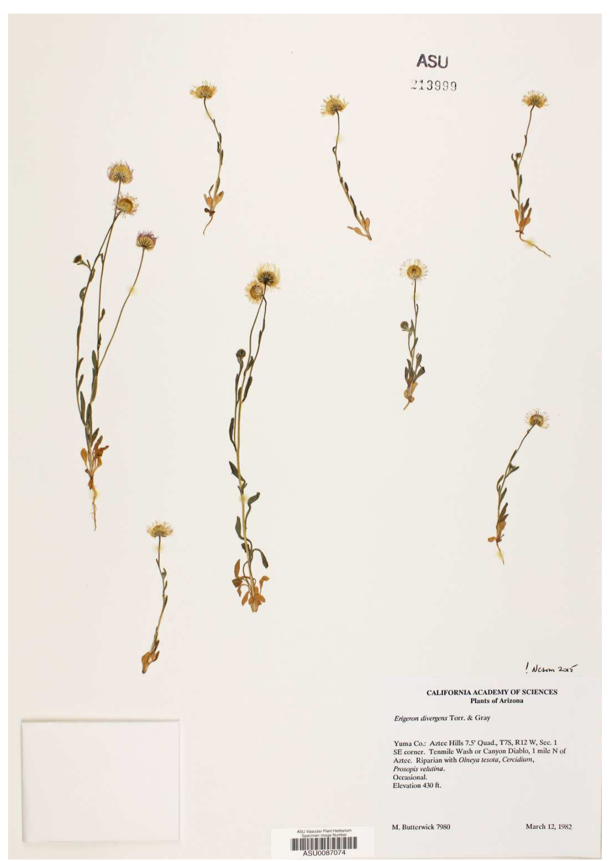
Figure 1. Erigeron divergens, Yuma Co., Arizona, single-stemmed from the base.