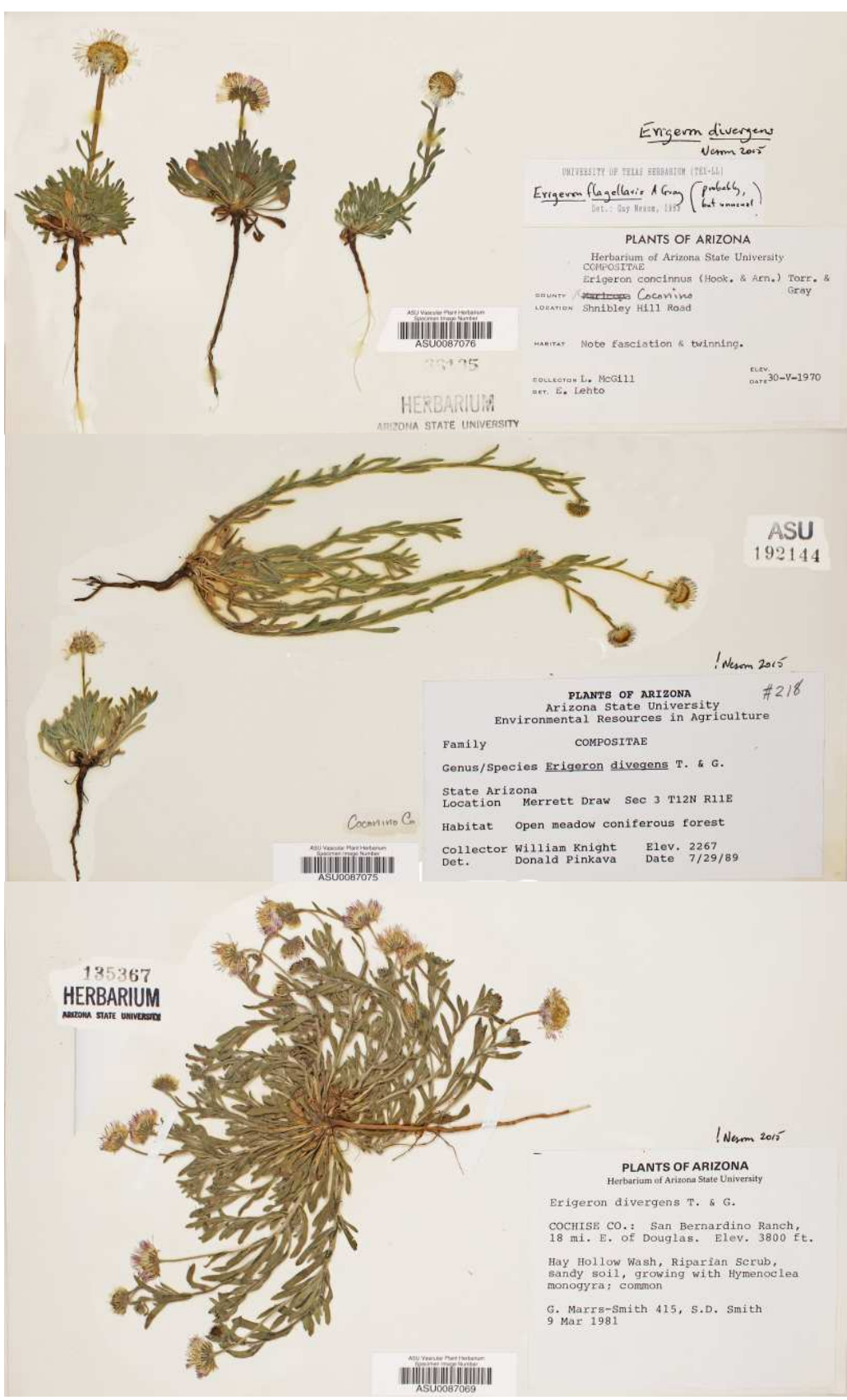
Figure 4. Erigeron divergens, Coconino and Cochise cos., multi-stemmed from the base.