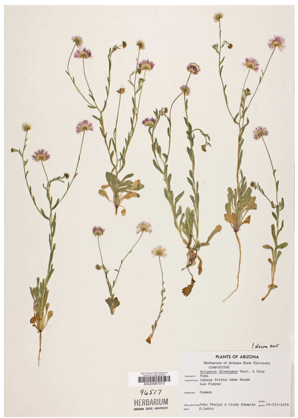
Figure 2. Erigeron divergens, Yuma Co., Arizona, single-stemmed from the base.