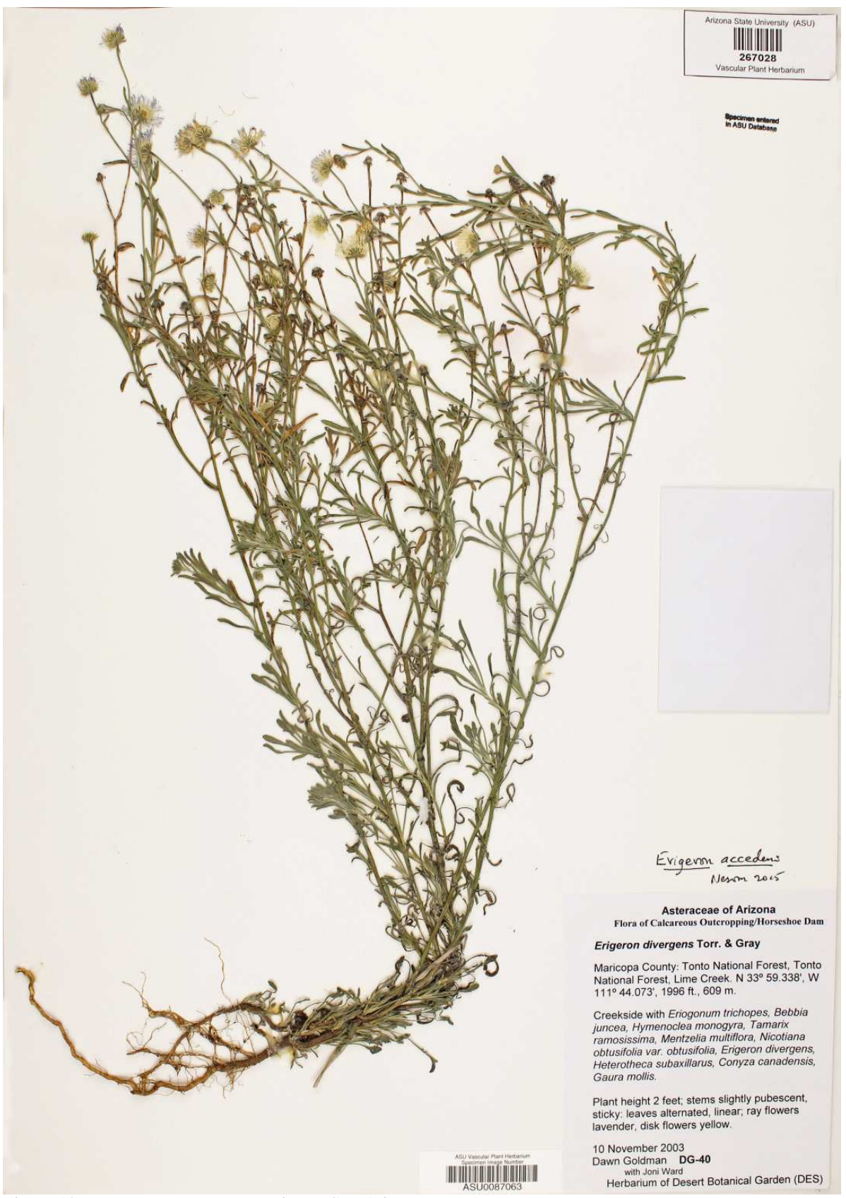
Figure 10. Erigeron incomptus, Maricopa Co., Arizona.