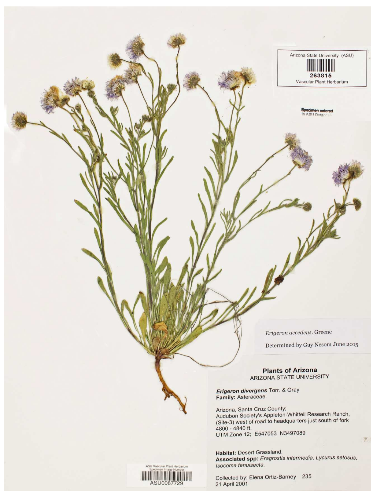
Figure 6. Erigeron incomptus > divergens , Santa Cruz Co., multi-stemmed from the base, with woody, multicipital caudex similar to that of E. incomptus . Lower leaves entire with tendency for long, narrow petioles.