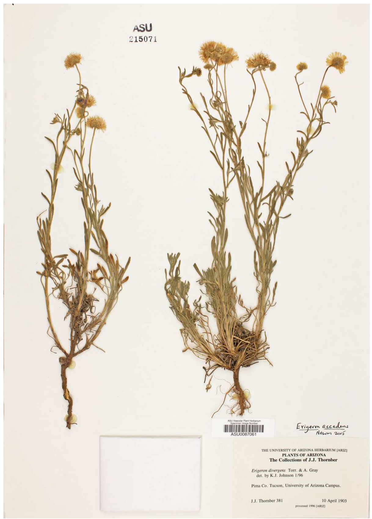
Figure 11. Erigeron incomptus, Pima Co., Arizona.