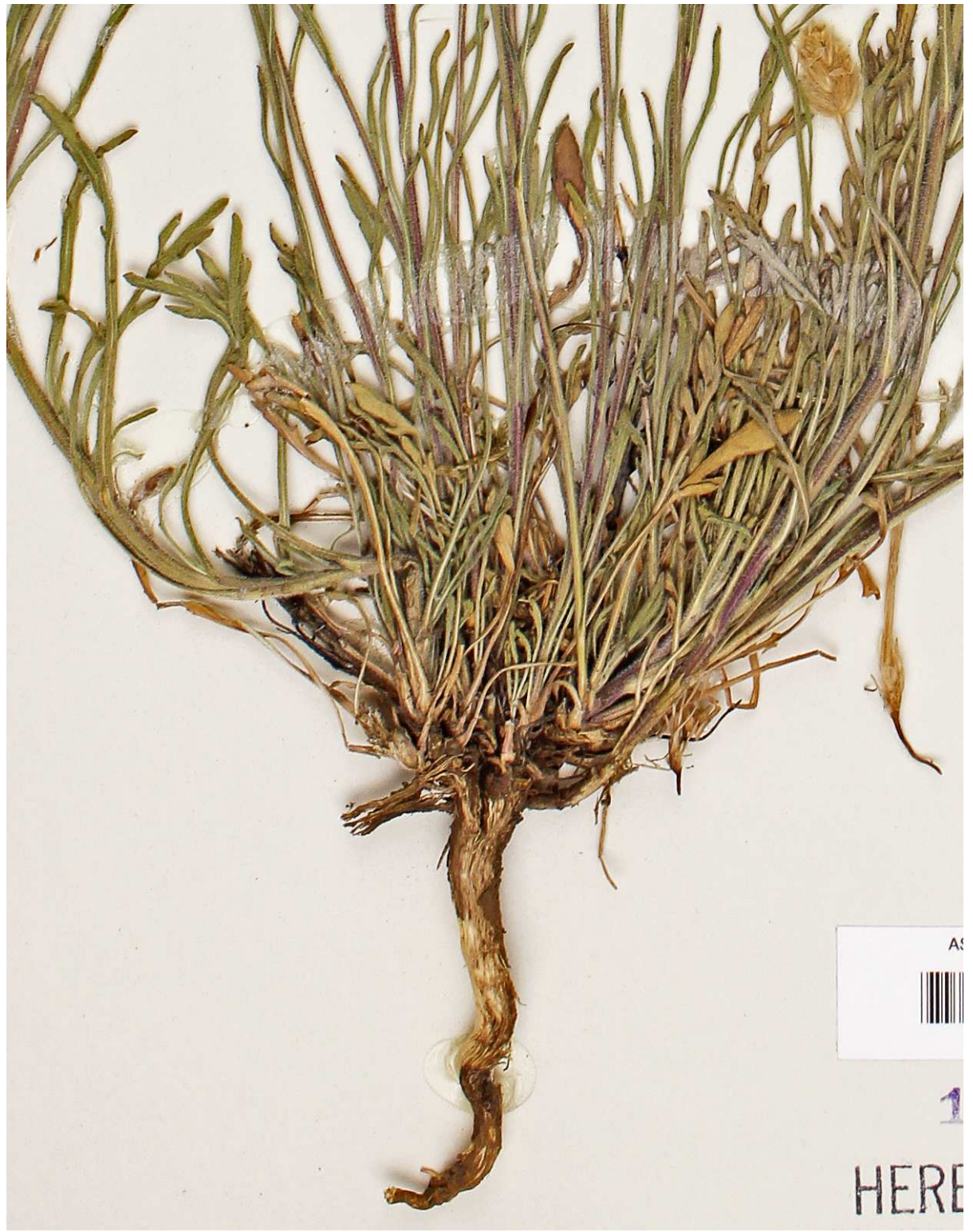
Figure 15. Erigeron incomptus , Gila Co., Arizona, Little 4242 (ASU). Multicipital caudex with characteristic, numerous meristematic apices. The plant apparently was divided in half upon its collection for a specimen.