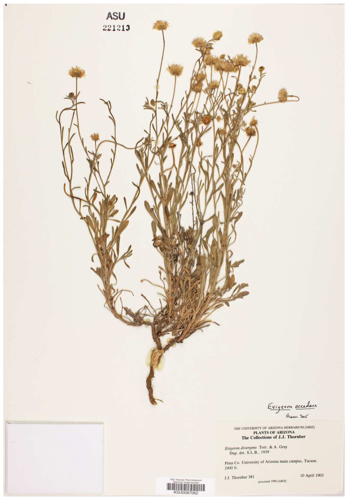
Figure 12. Erigeron incomptus, Pima Co., Arizona.