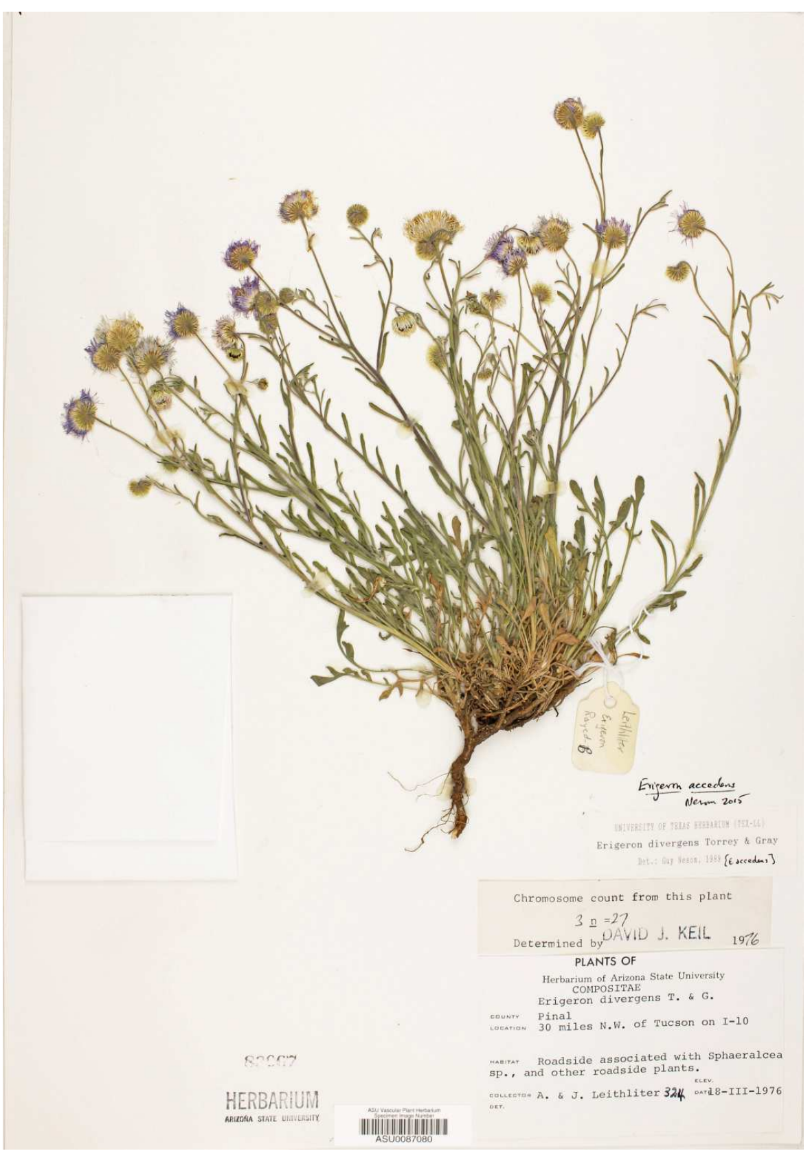
Figure 19. Erigeron aff. incomptus , Pinal Co., Arizona, perhaps a hybrid with E. tracyi . Chromosome number 2n = 27.