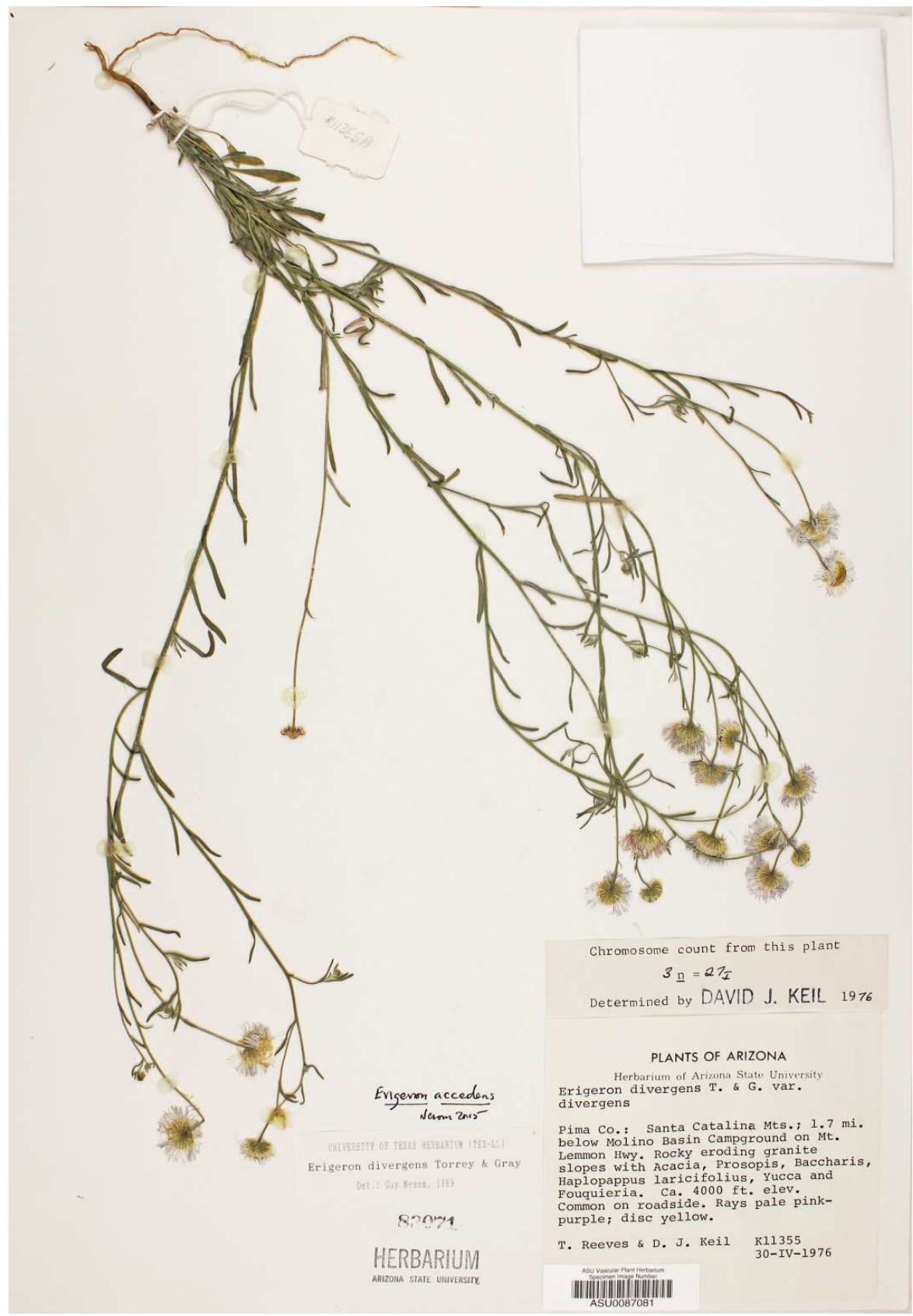
Figure 18. Erigeron incomptus , Pima Co., Arizona. Chromosome number 2n = 27.