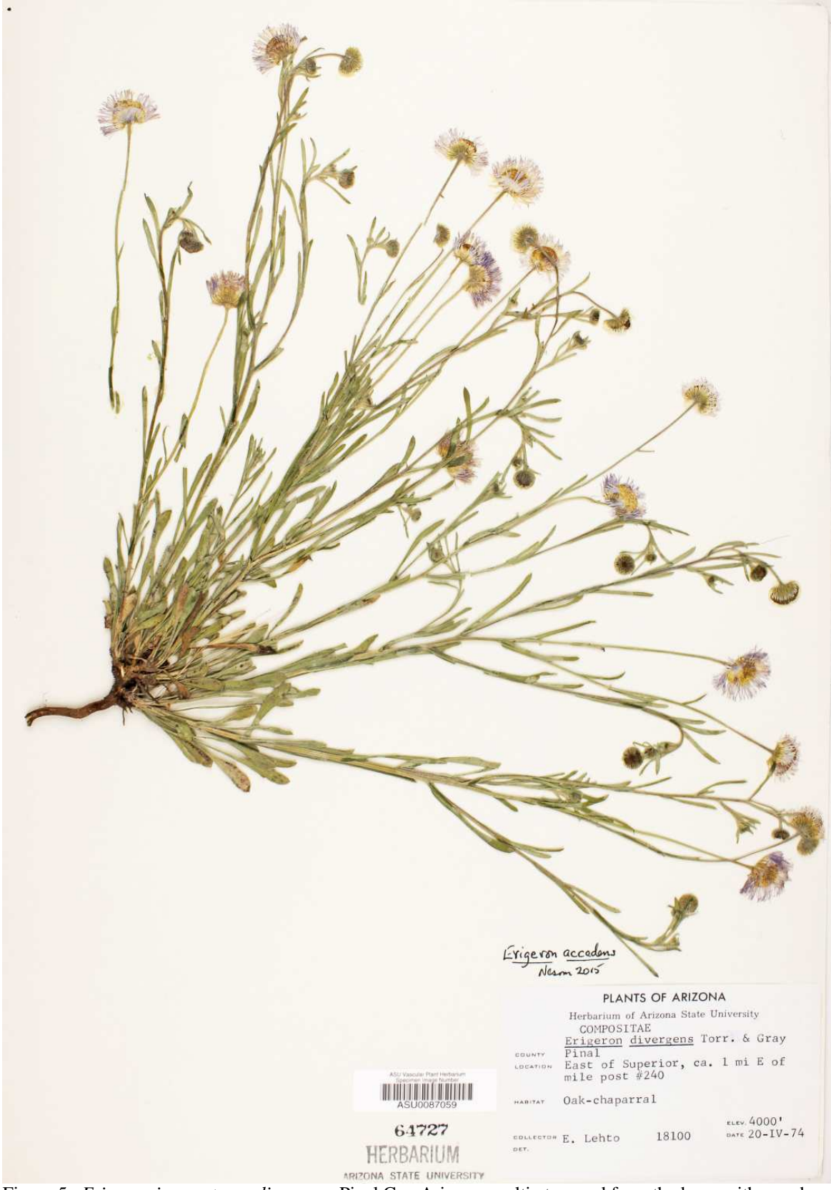
Figure 5. Erigeron incomptus > divergens , Pinal Co., Arizona, multi-stemmed from the base, with woody, multicipital caudex similar to that of E. incomptus . Lower leaves entire with tendency for long, narrow petioles.