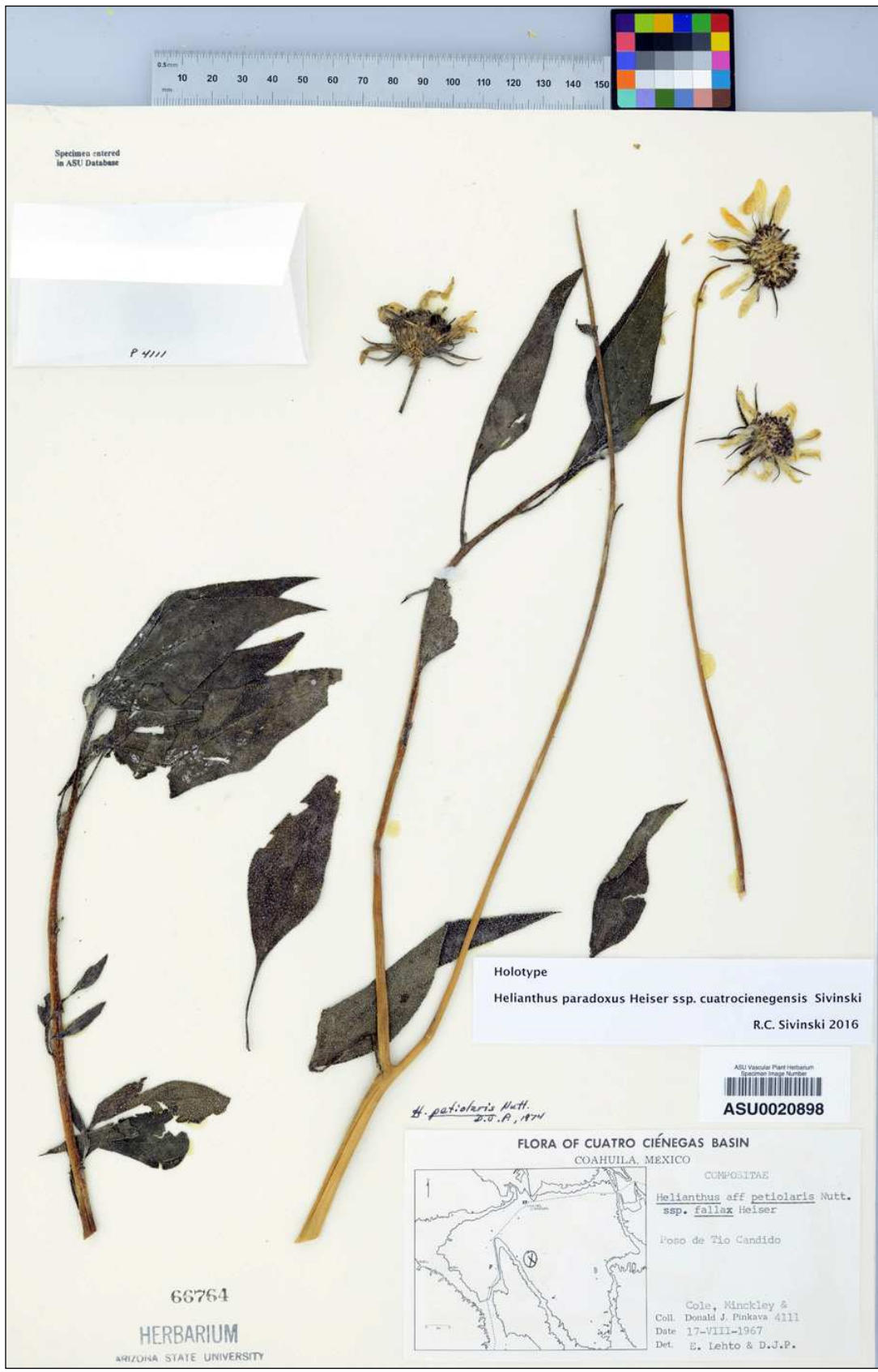
Figure 1. Holotype of Helianthus paradoxus subsp. cuatrocienegensis, ASU.