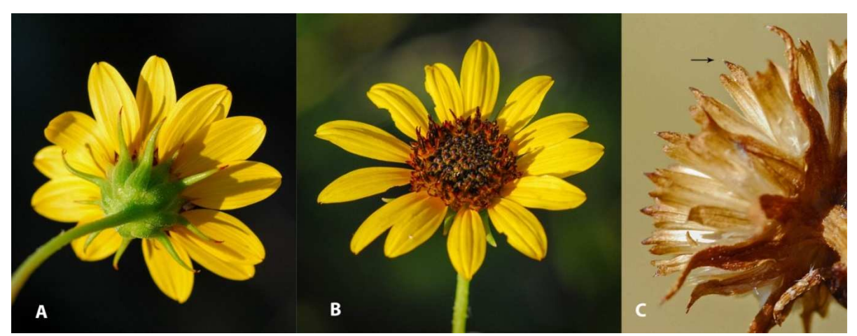
Figure 3. Helianthus paradoxus subsp. cuatrocienegensis capitulum morphology. A. Involucre with long, subulate outer phyllaries. B. Reddish brown disk with central paleae lacking white cilia. C. Central paleae in previous year's flower head showing short, acute terminal lobes.