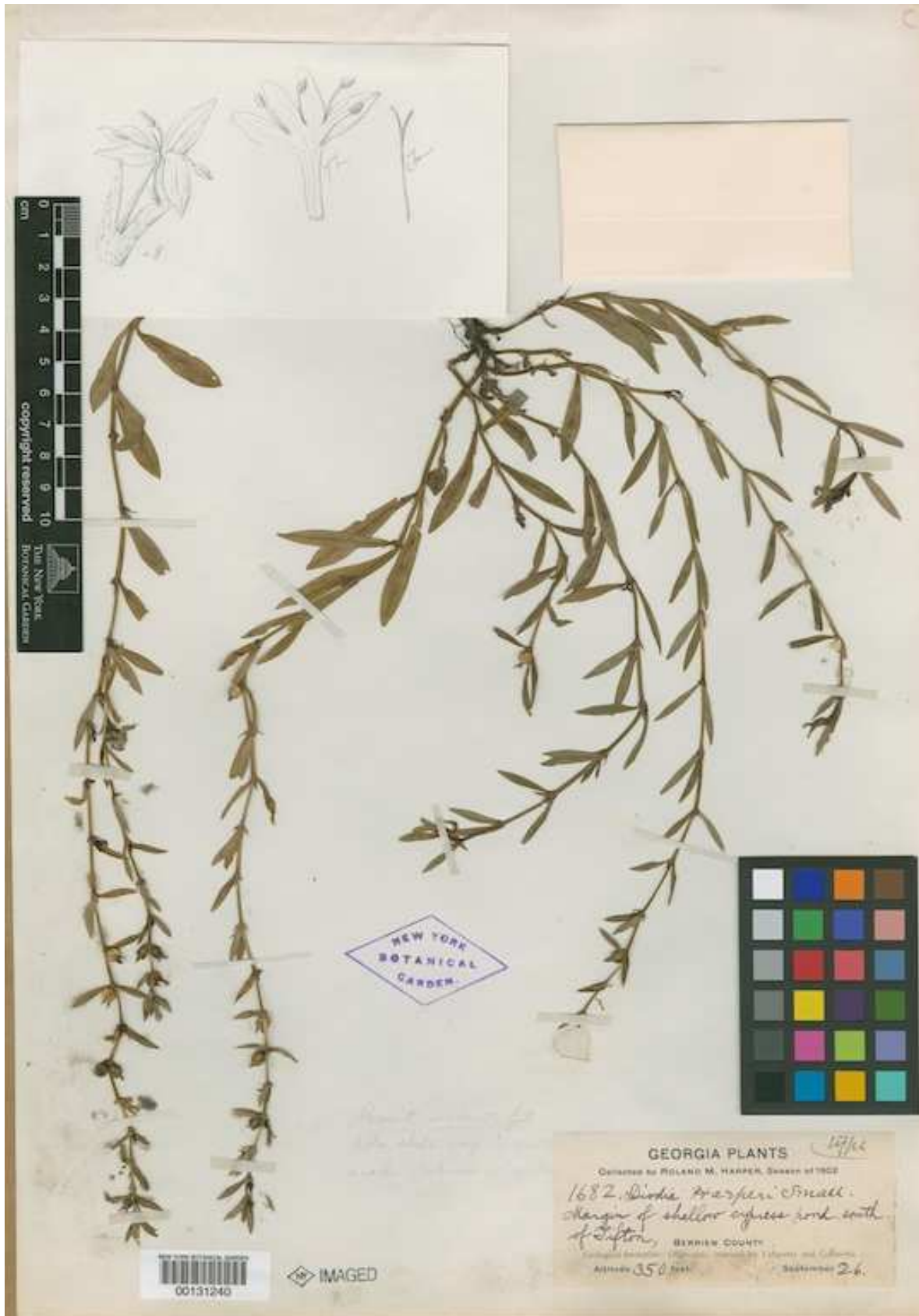
Figure 2. Holotype of Diodia harperi Small (Harper 1682, NY).