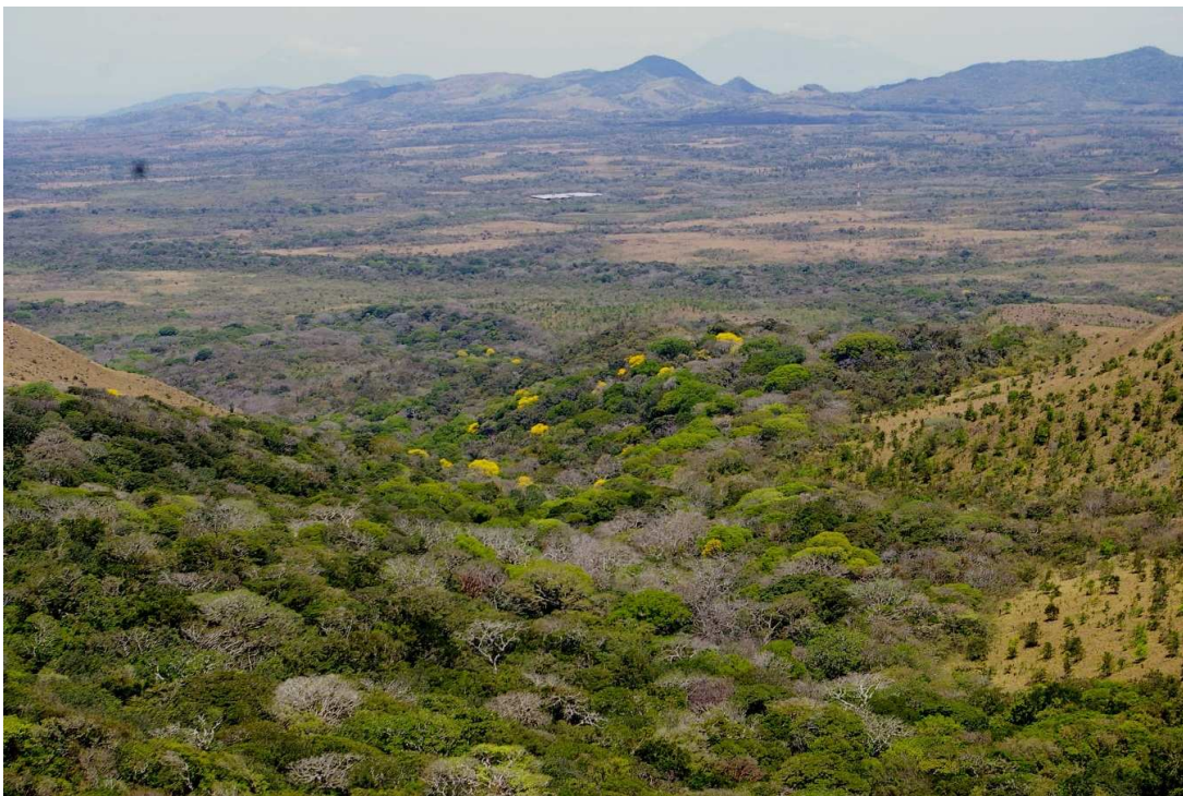
Figure 3. Landscape view of Calyptranthes guanacastensis habitat: dry semideciduous to evergreen seasonal forests patches along a watershed.