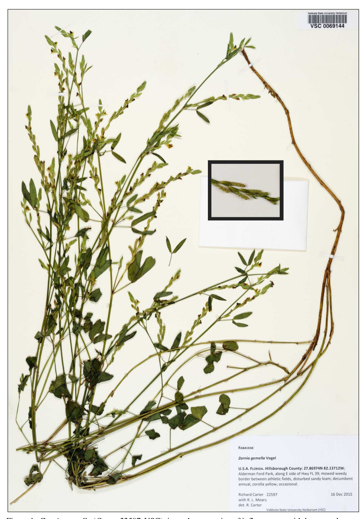
Figure 1. Zornia gemella (Carter 22597, VSC); inset shows portion of inflorescence with bracts and exserted loments.