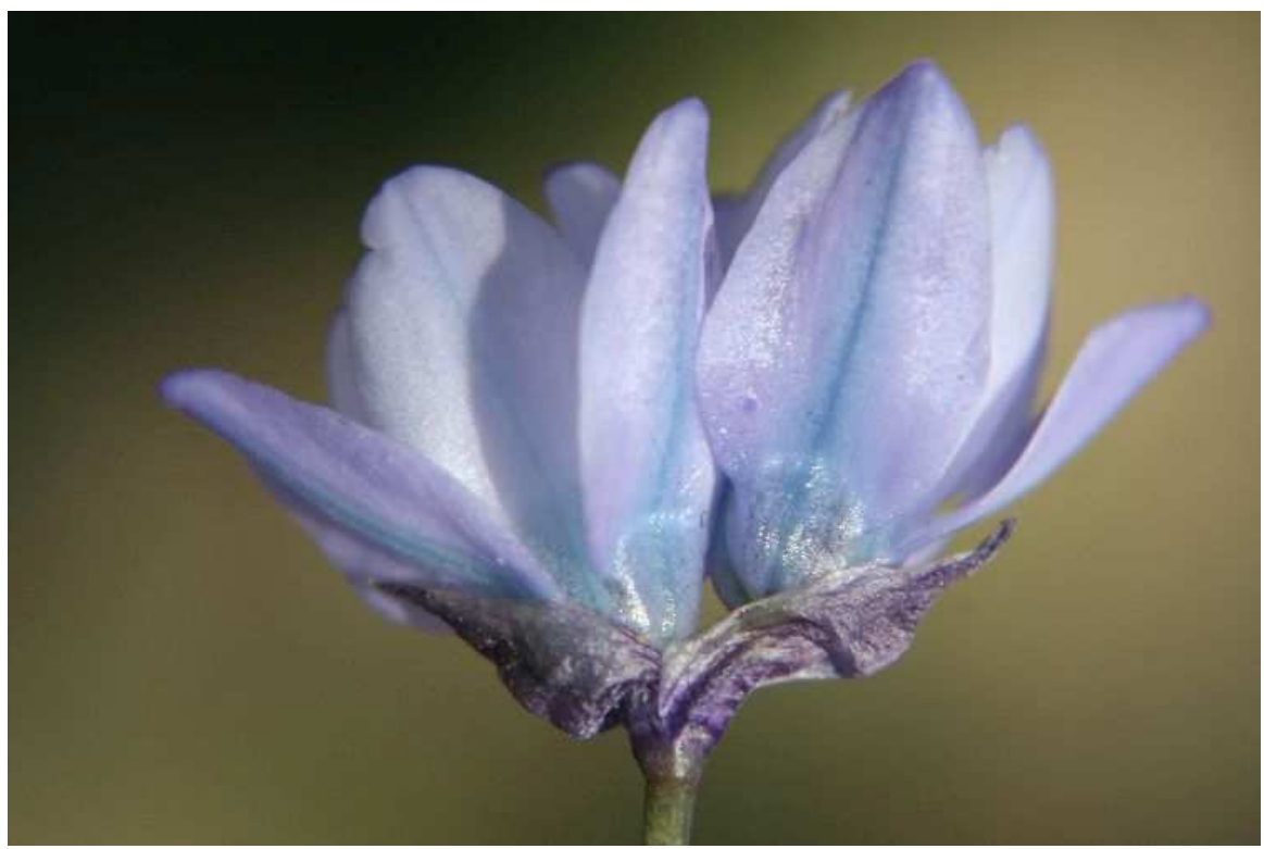
Figure 5. Dipterostemon capitatum subsp. lacuna-vernalis . The flowers are characterized by broadly ovate outer perianth lobes and very short perianth tubes (less than or equal to 4 mm).