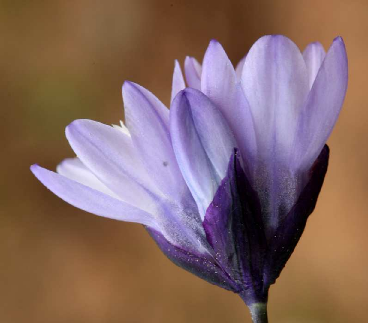
Figure 3. Dipterostemon capitatus subsp. capitatus . The inflorescences are characterized by dark bracts and short pedicels.