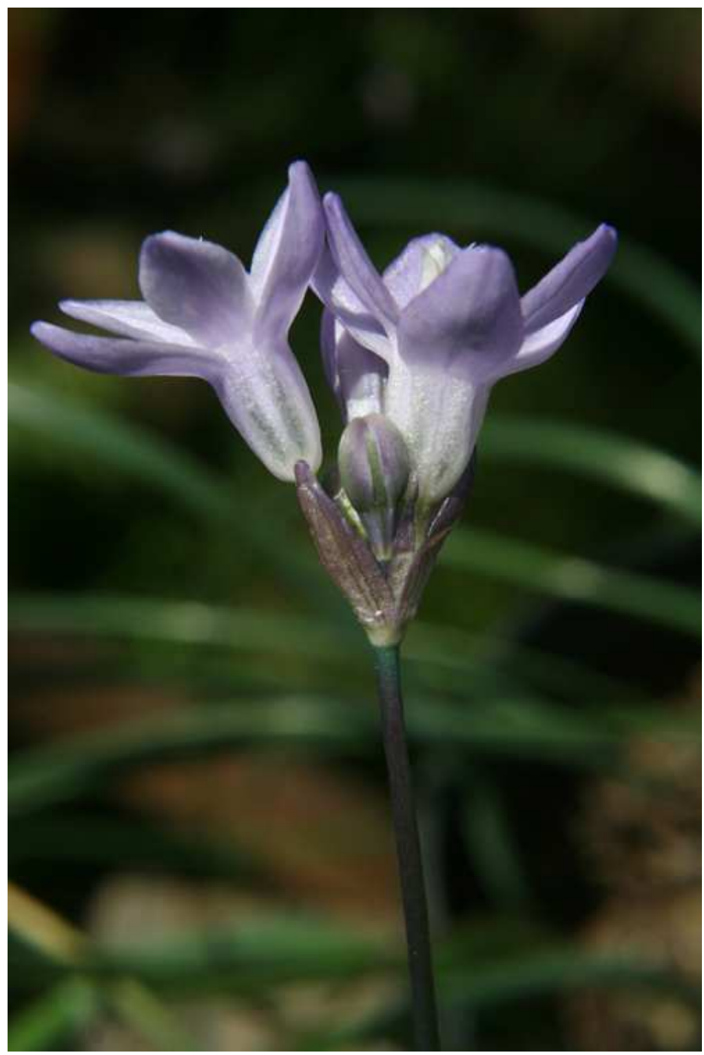
Figure 4. Dipterostemon capitatus subsp. pauciflorus . The inflorescences are characterized by pale bracts and long pedicels.