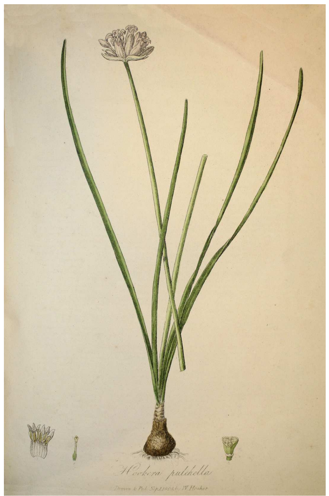
Figure 1. Hookera pulchellum . Illustrated by William Hooker in the Paradisus Londinensis , 1808. The insets illustrate the open corolla, pistil, and a transverse section of the young fruit.