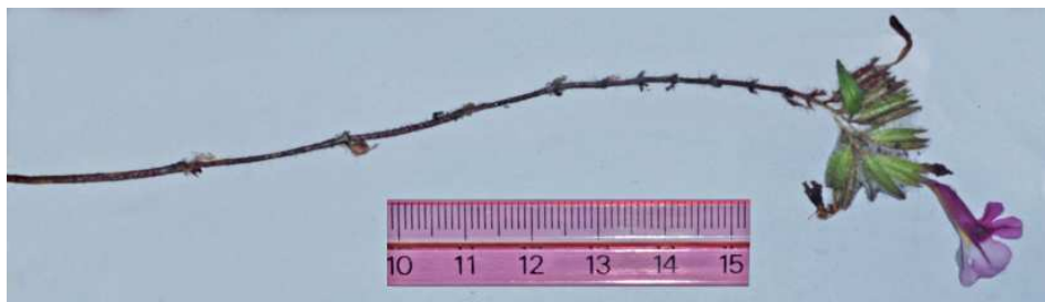
Figure 4. Diplacus graniticola . Eleven out of 18 nodes stripped of leaves and calyces showing the extremely close distal internode lengths in a mature plant. Hetch-Hetchy area. Photo © Steve Schoenig, September 2016.