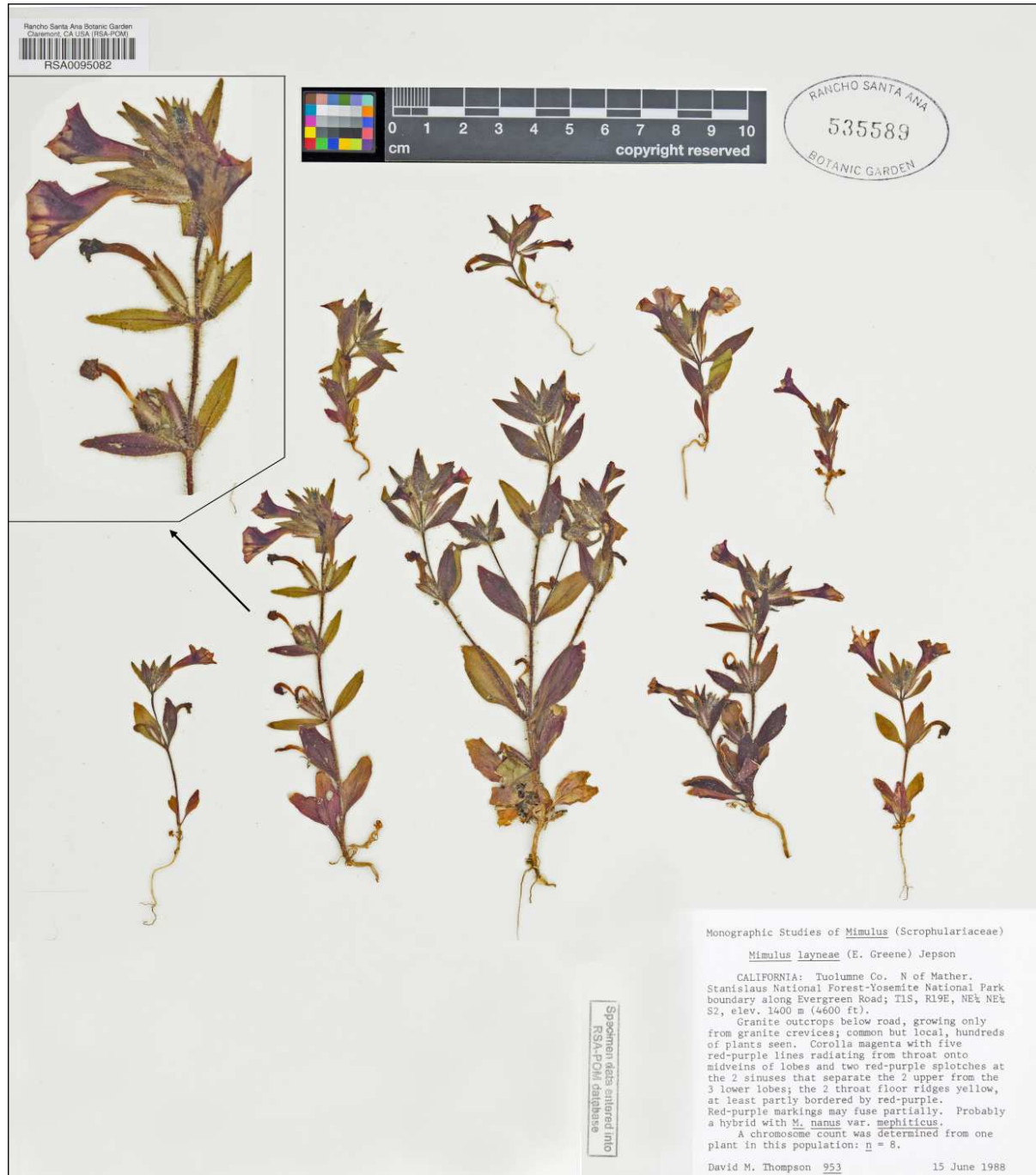
Figure 1. Diplacus graniticola , holotype (rearranged for the illustration), RSA.

Similar to Diplacus layneae in its dark-drying herbage, vestiture of gland-tipped hairs, flowers at all nodes and usually 2 per node, calyx strong ribbed and plicate, not inflated, corollas lavender to magenta, nearly regular to weakly bilabiate, and ciliate anthers; different from D. layneae in its (1) fidelity to cracks in granite, (2) flowering nodes 4–15(–20) in mature plants, distal internodes shorter than leaves, (3) vestiture of longer hairs, (4) calyces without white-membranous intercostal areas and broadly darkened ribs, and (5) distinctive and consistent corolla markings. See key couplet below for details.