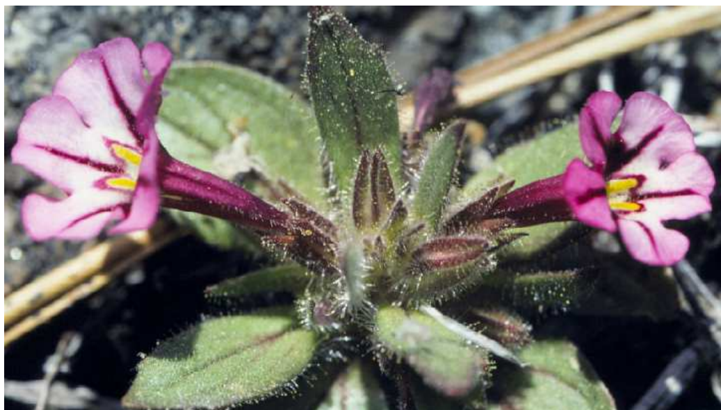
Figure 6. Diplacus graniticola , Hume Lake, Fresno Co. Photo © Steve Schoenig, 2 June 2007.