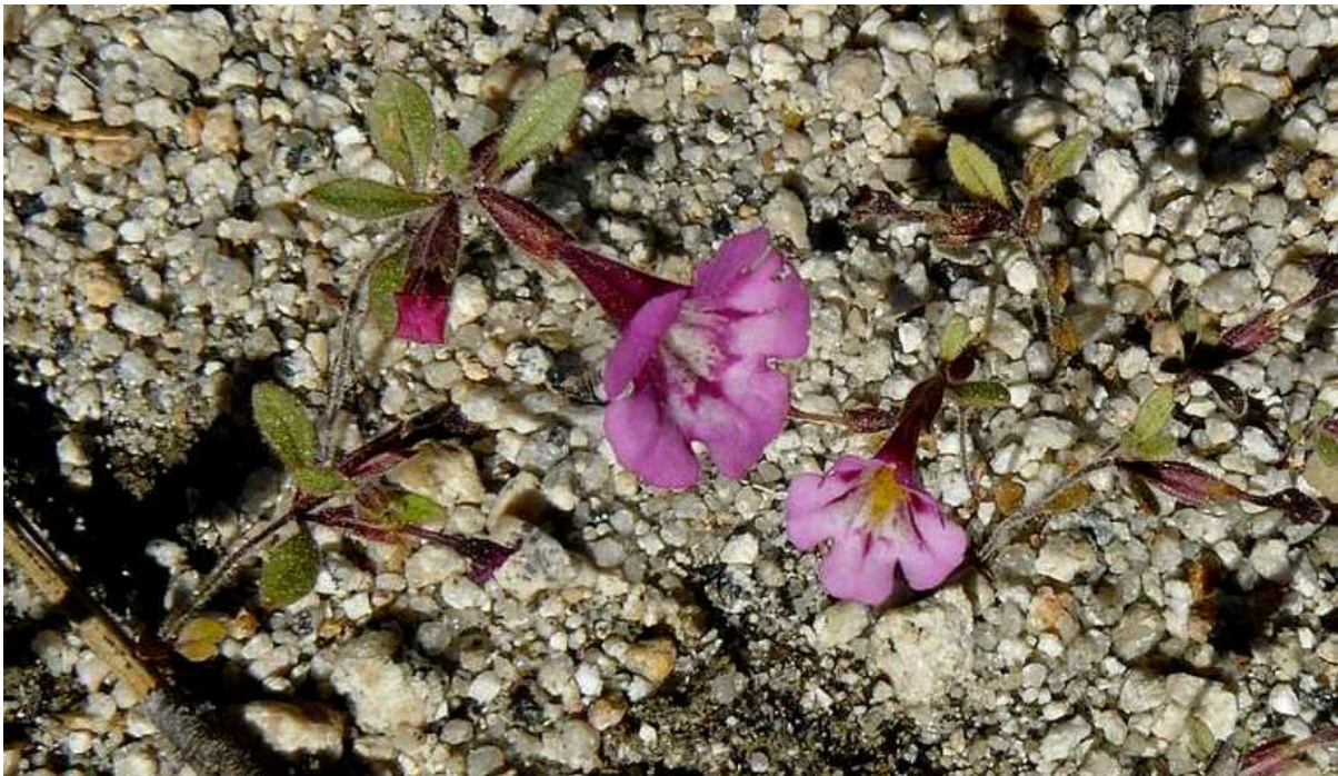
Figure 12. Diplacus layneae in granite gravel, Yosemite Valley, Bridal Veil Fall Vista, Mariposa Co. 23 July 2011.