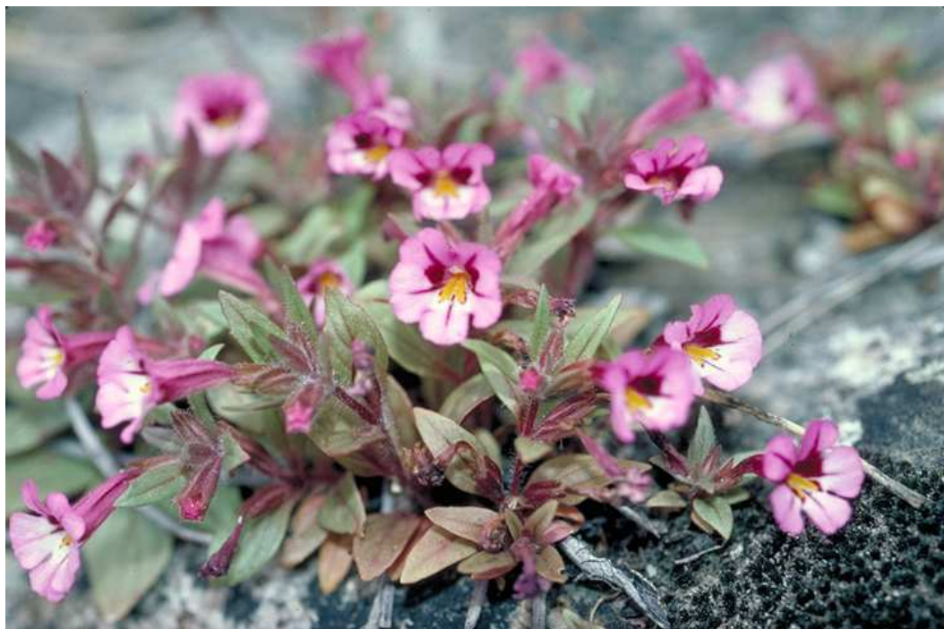
Figure 5. Diplacus graniticola , Hetch-Hetchy, Tuolumne Co. Photo © Steve Schoenig, 1 July 1993.