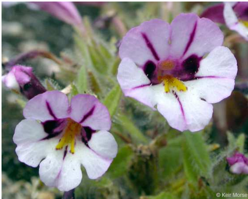
Figure 10. Diplacus graniticola , Yosemite National Park. Photo © Keir Morse, 15 July 2005.