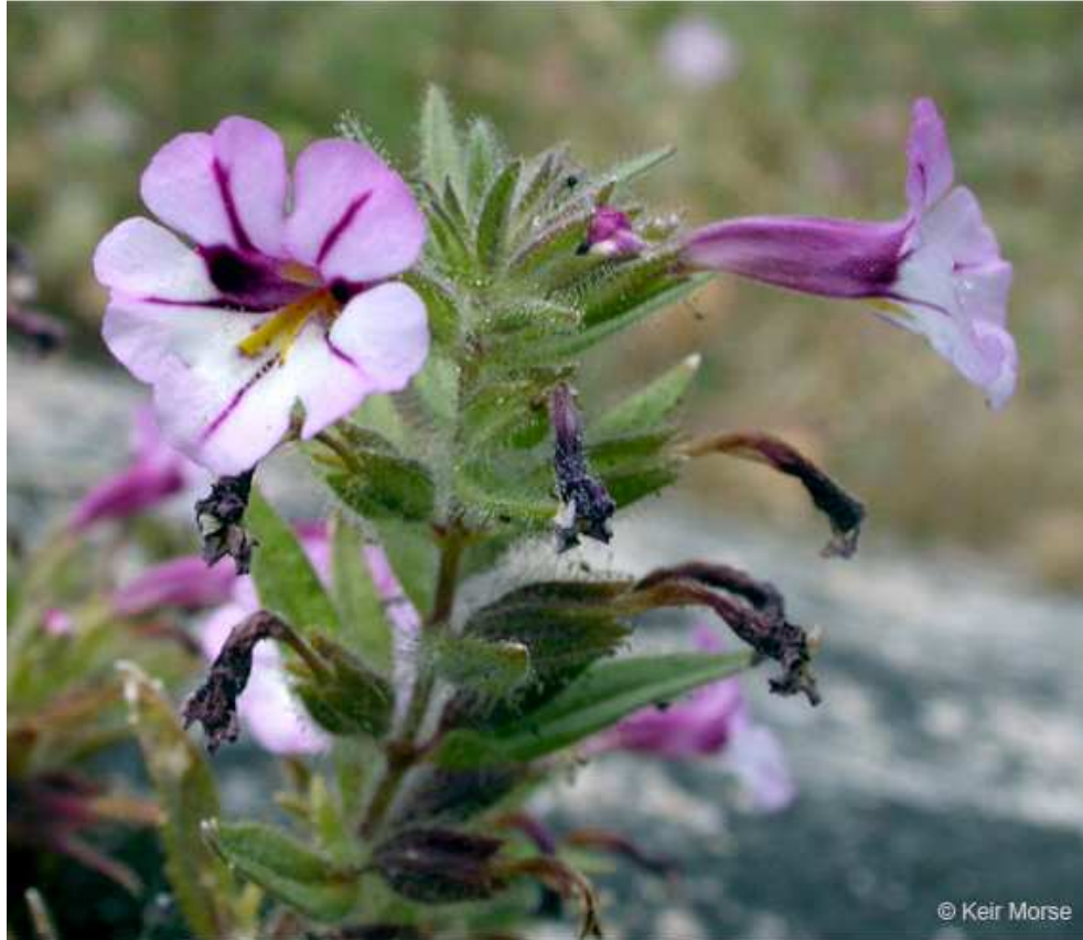
Figure 9. Diplacus graniticola , Yosemite National Park. Photo © Keir Morse, 15 July 2005.