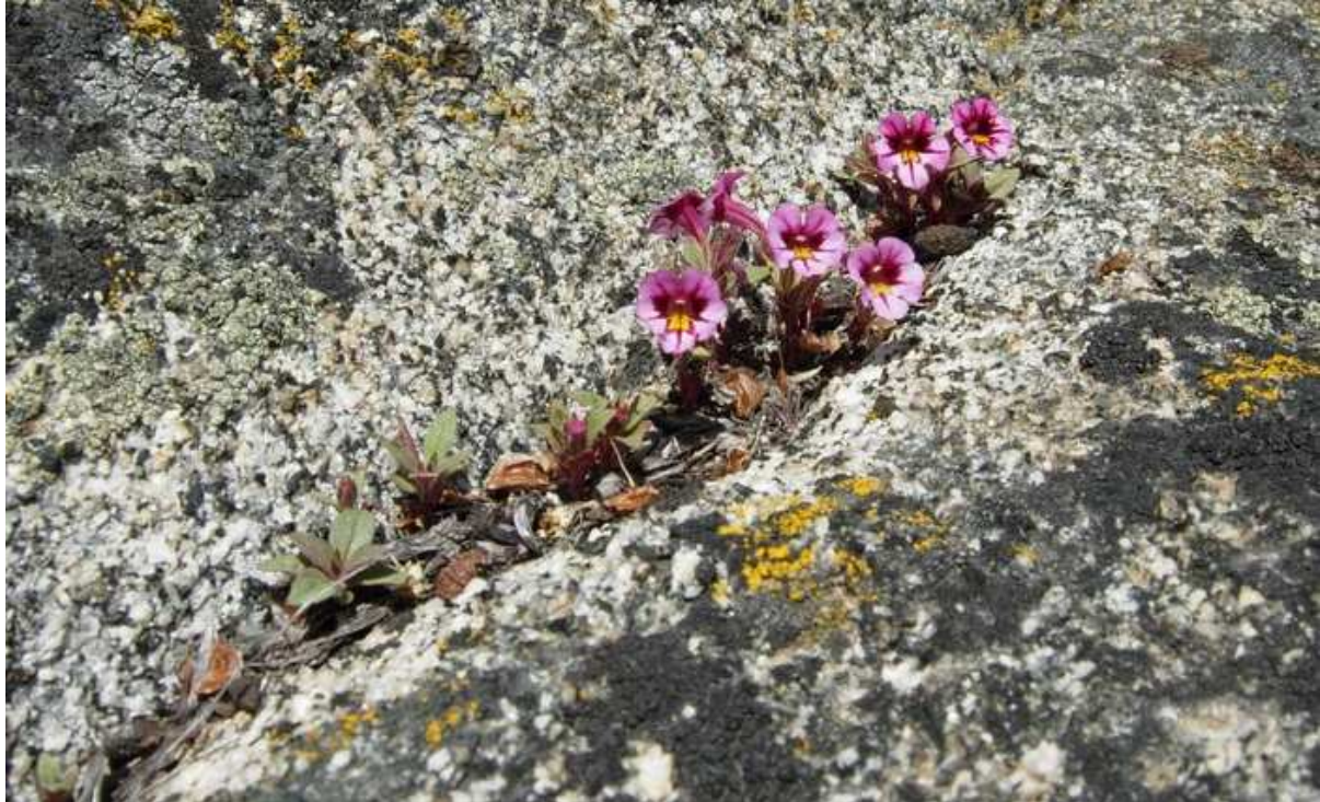
Figure 7. Diplacus graniticola , Hume Lake, Fresno Co. Photo © Neal Kramer, 2 June 2007.