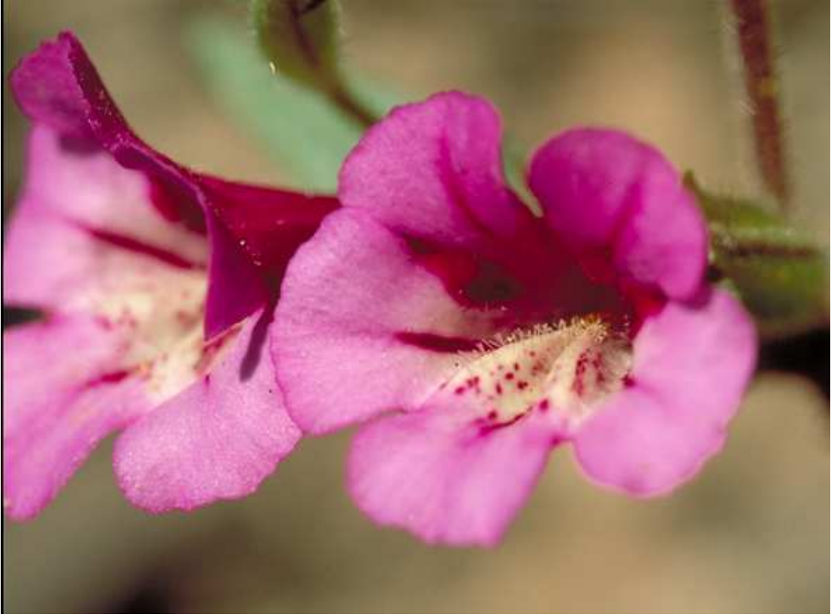
Figure 13. Diplacus layneae near Angwin, Napa Co. Photo © Steve Schoenig, May 1998.