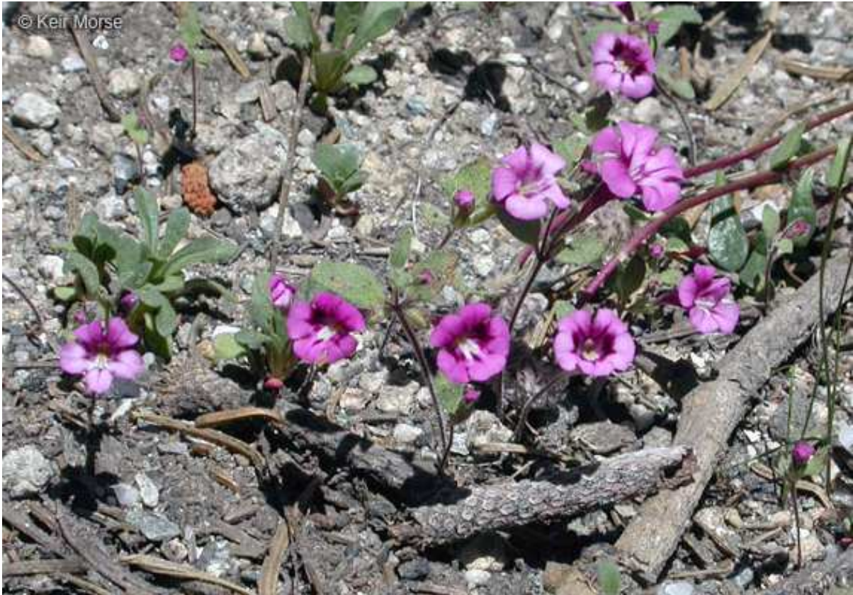
Figure 11. Diplacus layneae in gravelly soil immediately derived from granite, Yosemite National Park. Photo © Keir Morse, 12 July 2005.