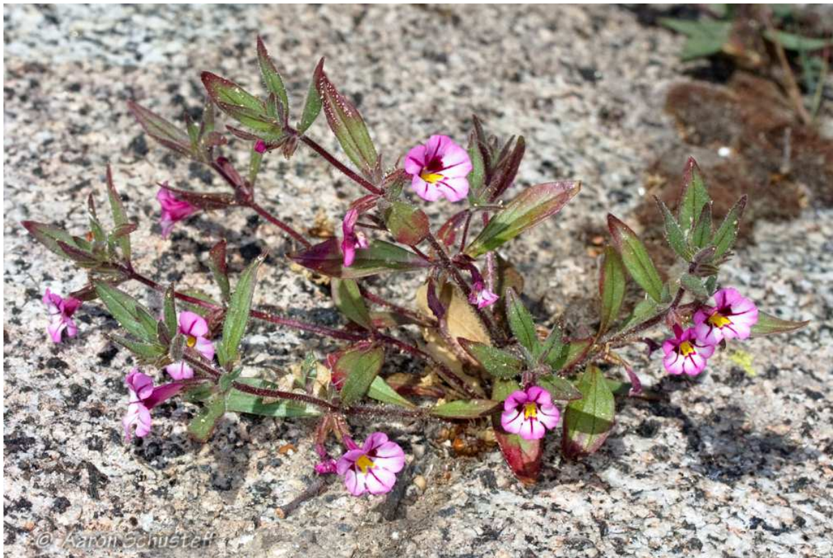
Figure 8. Diplacus graniticola , San Joaquin River Gorge BLM Management Area, Fresno Co. Photo © Aaron Schusteff, 20 April 2013.