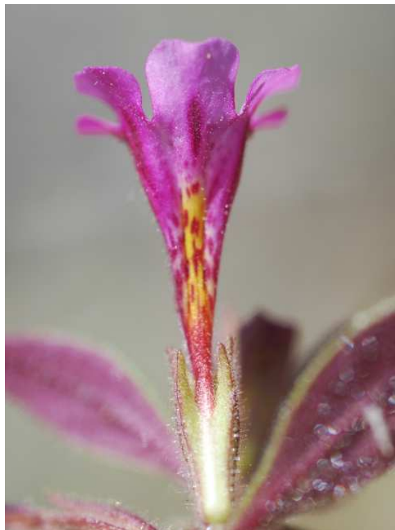
Figure 3. Diplacus graniticola (left) and Diplacus layneae (right) ventral view of corolla tube-throats showing color and pattern differences. These plants were 3 meters apart in granitic crevices and on adjacent scree respectively. Hetch-Hetchy area, Tuolumne Co. Photos © Steve Schoenig, May 2016.