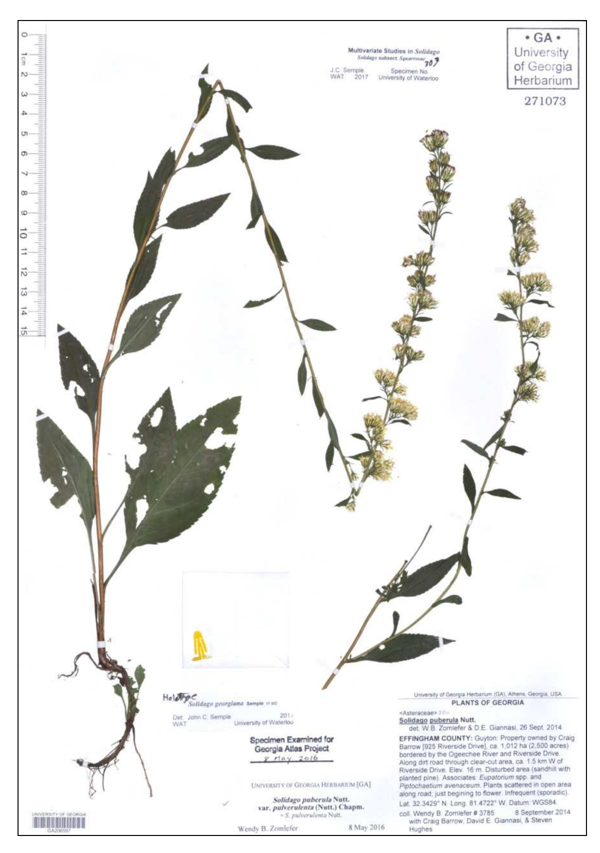
Figure 1. Holotype of Solidago georgiana, Zomlefer et al. 3785 (GA from Effingham Co., Georgia.