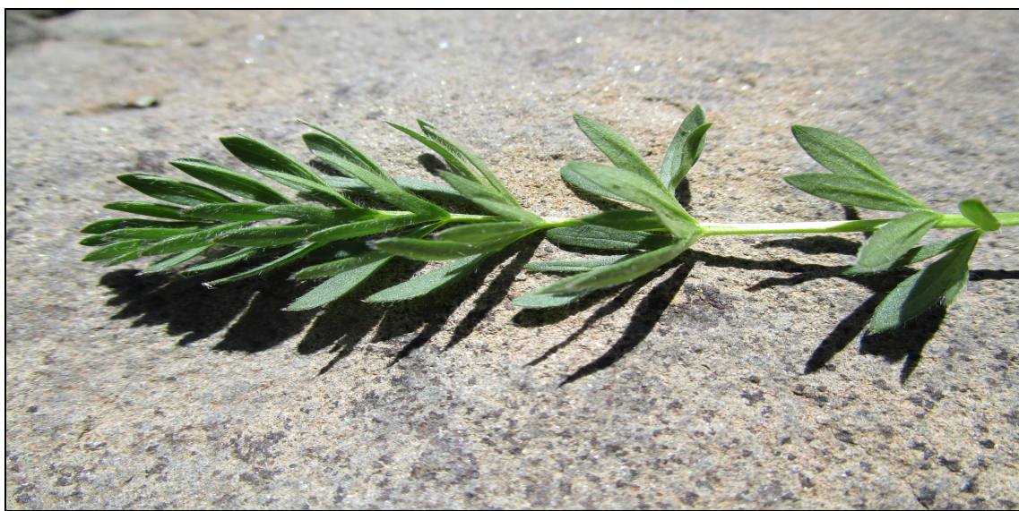
Figure 1. Semiverticillate leaf of Potentilla versicolor var. versicolor on Steens Mountain.

As now circumscribed, Potentilla versicolor is distinguished by its somewhat thickened taproot, simple to few-branched caudex, prostrate to ascending stems that are usually more than 1.5 times as long as the leaves, pinnate leaves with confluent terminal leaflets, usually sparse to absent vestiture (more variable on Gearhart Mountain), and a diffuse inflorescence with relatively straight pedicels. Leaflets are palmately and deeply divided into narrowly elliptic or linear-lanceolate teeth or segments, which when fresh appear semiverticillate (Fig. 1). Intertwined cottony hairs are usually absent or sparse, with the latter state possibly resulting from intergradation with co-occurring P. breweri . Petals, filaments, and styles tend to be somewhat shorter in P. versicolor than in P. breweri . Vigorous populations are most often found on shallow rocky soils, often near outcrops and/or with abundant cobble-size rocks, which are moist early in the season but dry out as the season progresses.