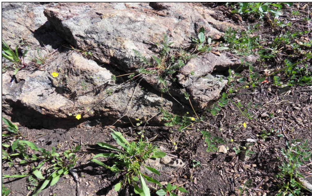
Figure 3. Plants of Potentilla versicolor var. darrachii at the type locality. The rock crevice habitat is not typical but provides better photographic contrast than bare ground.