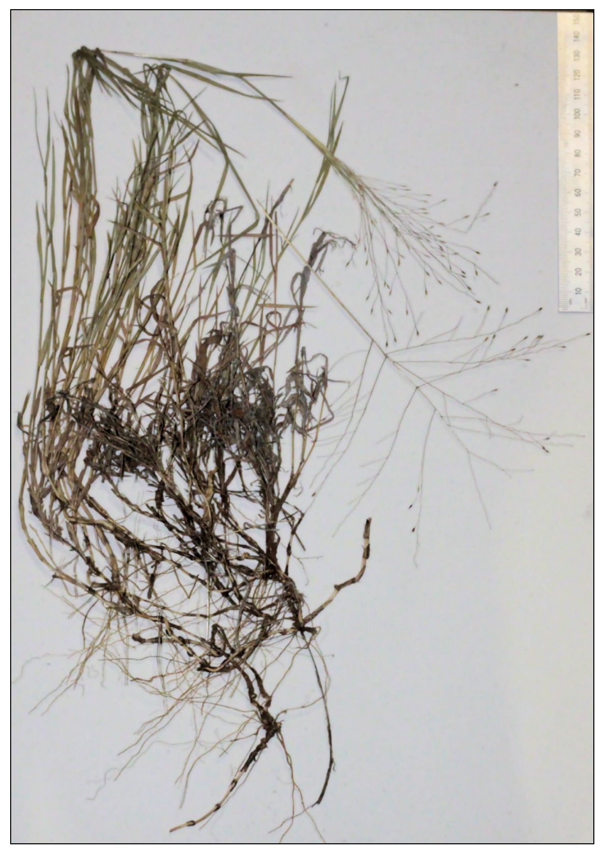
Figure 2. Leptoloma syrticola from the type collection (Wipff 308). Photo © Annette R. Wipff, May 2018.