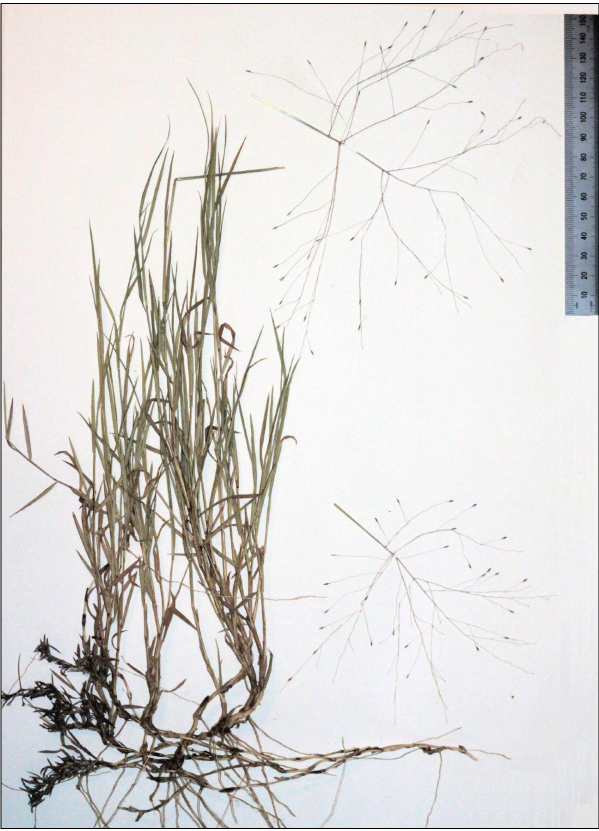
Figure 1. Leptoloma syrticola from the type collection (Wipff 308).