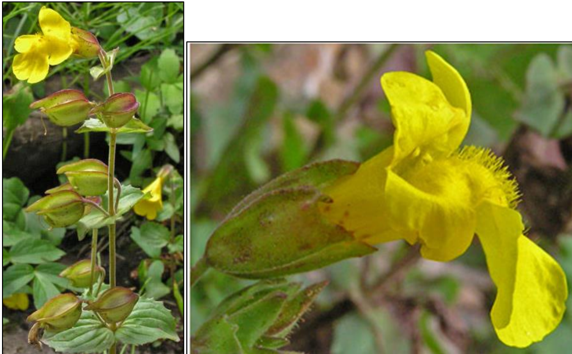
Figure 2. Erythranthe guttata in Colorado, the “minor morph.” Left: Groundhog Meadow Trail, Rio Grande Co.. Right: Wildcat Trail, Montezuma Co.