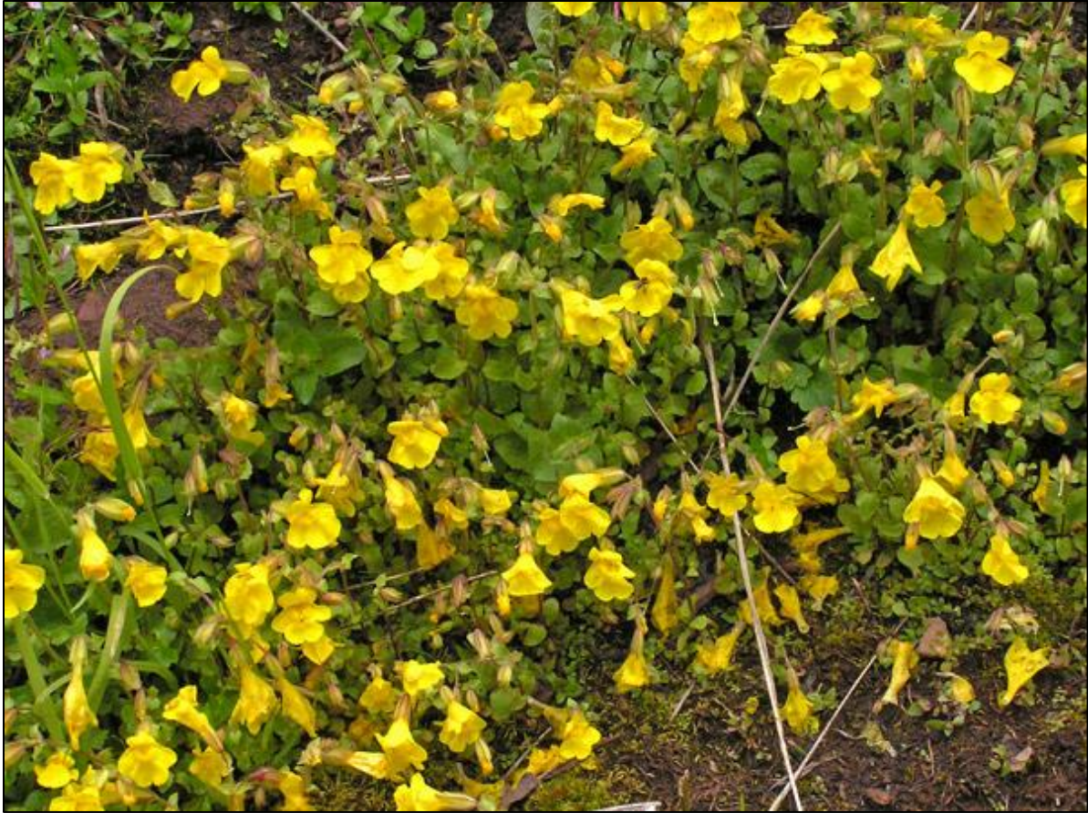
Figure 3. Erythranthe guttata in Colorado, along Wildcat Canyon Stream, Montezuma Co.