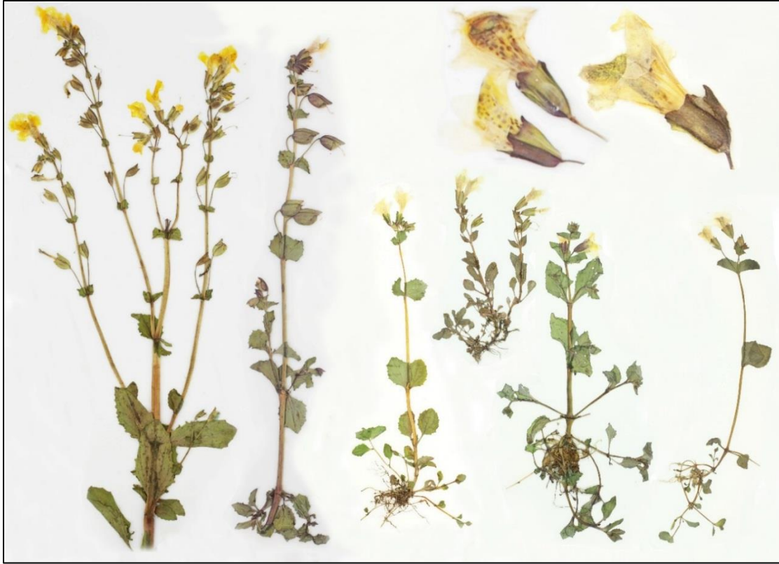
Figure 1. Erythranthe guttata in Colorado, the “minor morph.” The minor morph usually produces a few distal flowers but variants can produce a raceme like that often seen in broadly distributed E. guttata .