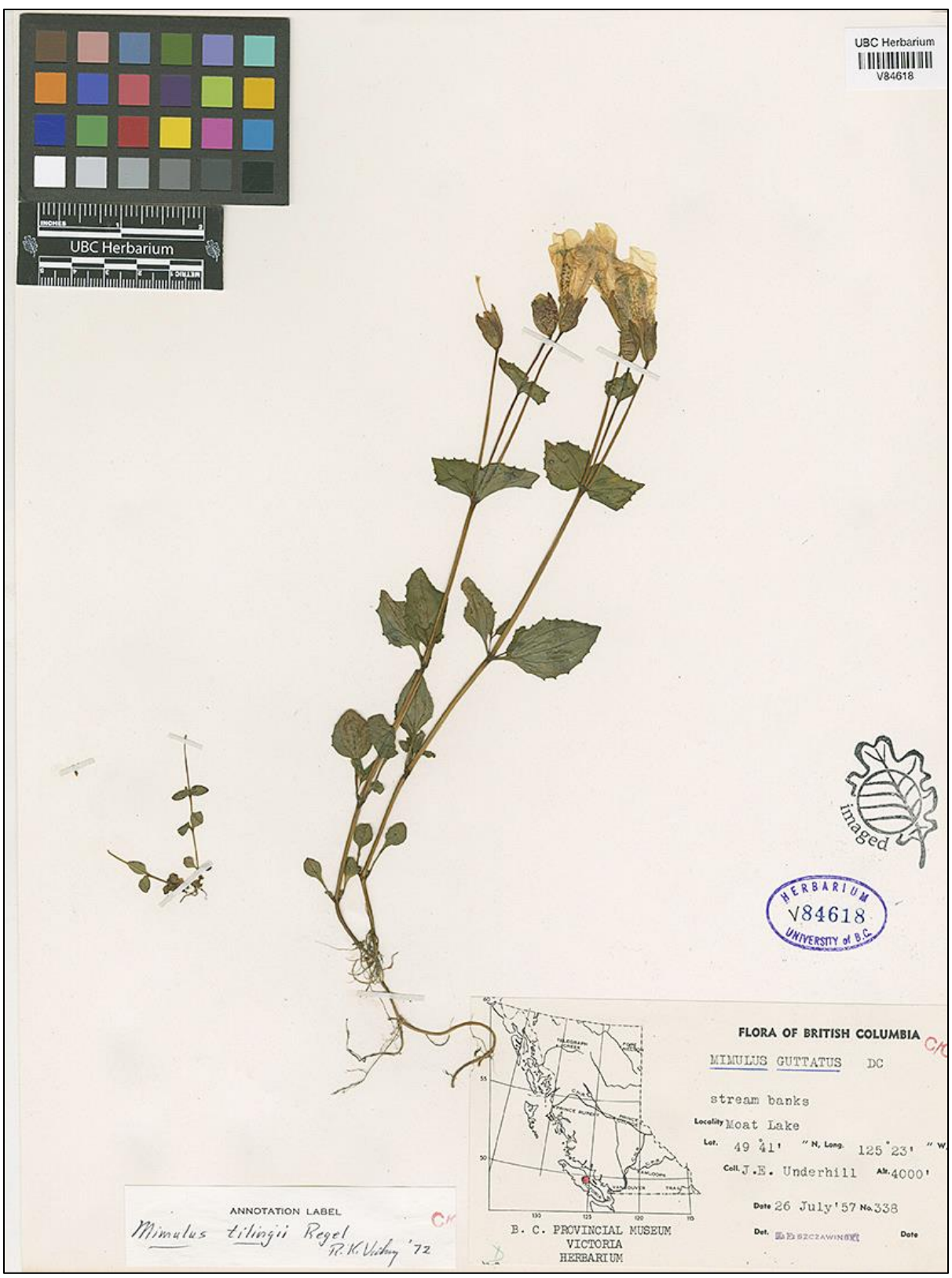
Figure 9. Erythranthe veronicifolia. Vancouver Island, Underhill 338 (UBC).