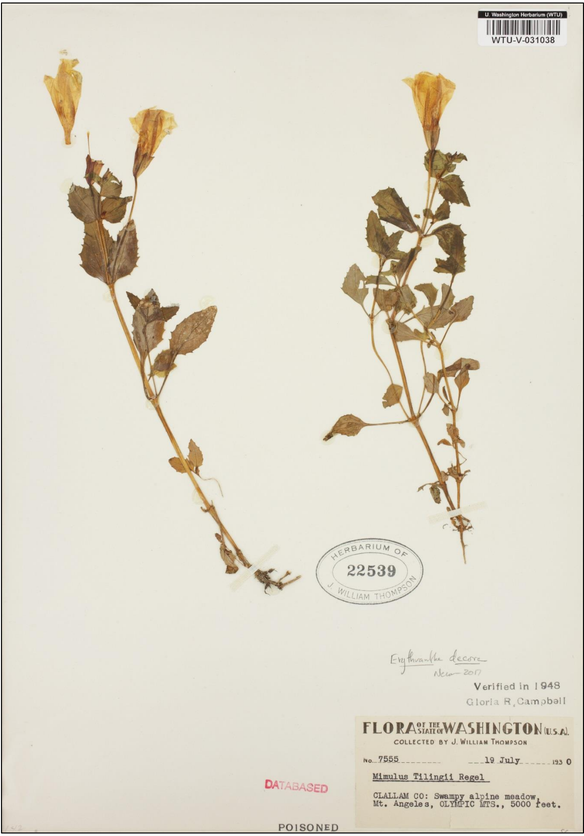
Figure 5. Erythranthe veronicifolia. Olympic Mountains, Thompson 7555, WTU.