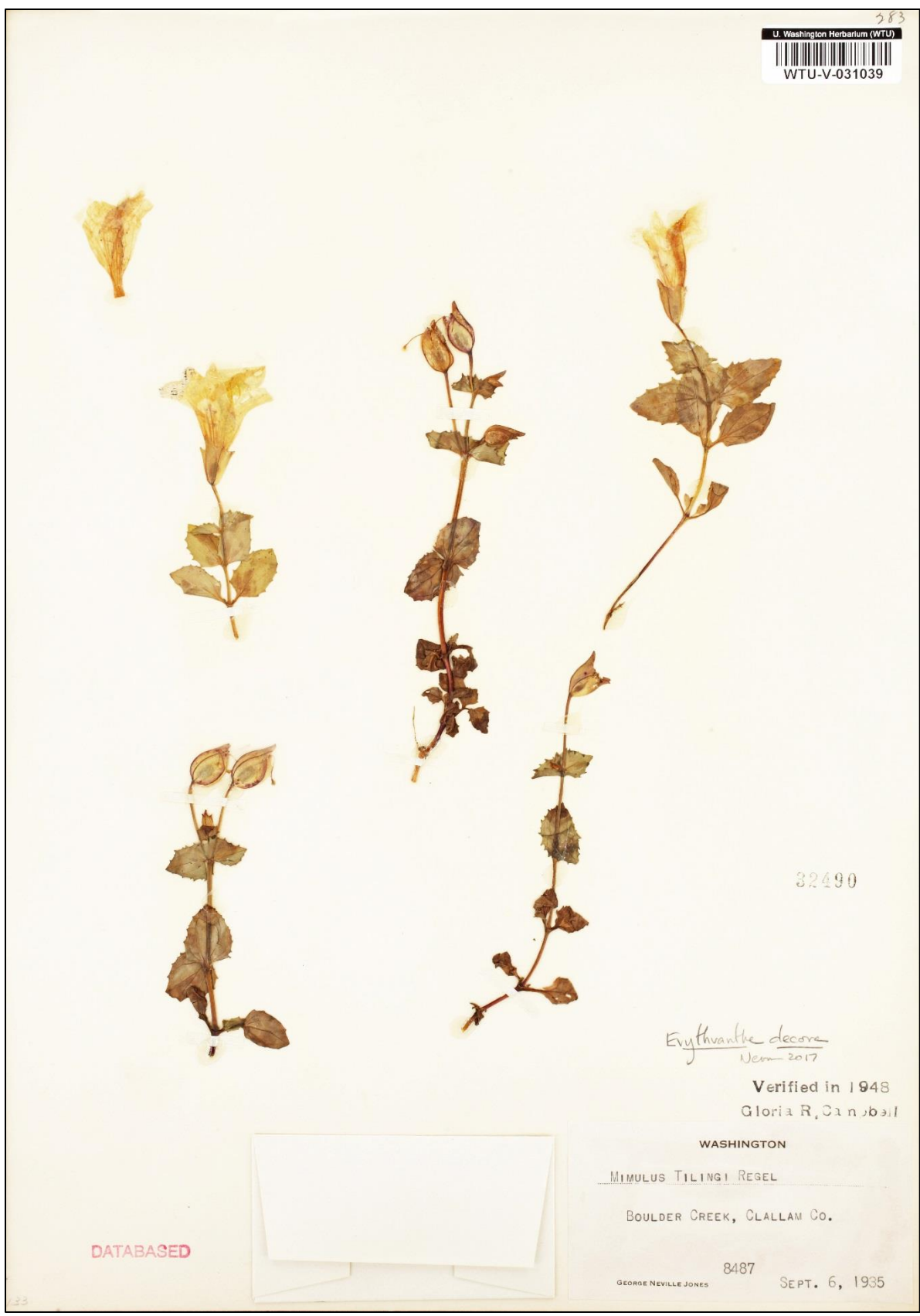
Figure 6. Erythranthe veronicifolia. Olympic Mountains, Jones 8487, WTU.