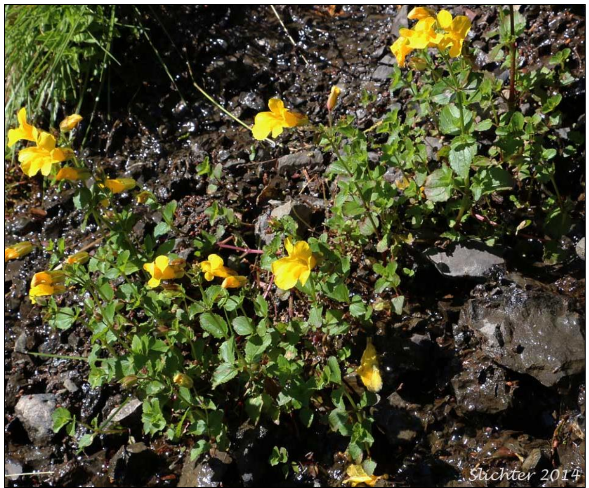
Figure 10. Erythranthe veronicifolia in Olympic National Park. "Moist area near the trailhead for the switchback trail up the south side of Klahhane Ridge" (Slichter 2016). Photo by Paul Slichter, 26 July 2014, used by permission. Klahhane Ridge is between Mt. Angeles and Rocky Peak, about 1 mile west of Mt. Angeles.