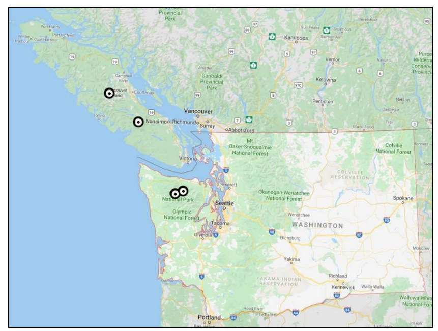
Figure 1. Distribution of Erythranthe veronicifolia. Detailed localities are shown in Fig. 2.

Erythranthe veronicifolia has been commonly collected in the Mt. Angeles area of the Olympic Mountains — typical E. decora occurs there sympatrically (e.g., Mink Lake above Sol Duc Hot Springs, Pennell & Meyer 21228 , PH). Typical E. caespitosa also occurs on Mt. Angeles (e.g., Thompson 5540 , PH) — some plants may resemble small individuals of E. veronicifolia (with short stems, small leaves), but E. caespitosa has mostly procumbent stems, smaller leaves with fewer teeth, glabrous calyces, and smaller corollas.