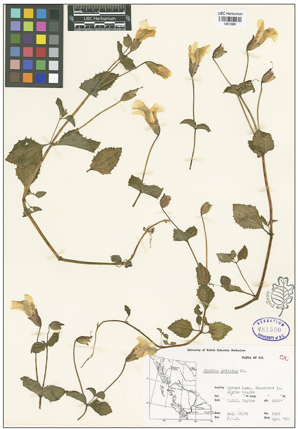
Figure 8. Erythranthe veronicifolia. Vancouver Island, Taylor 1267 (UBC).