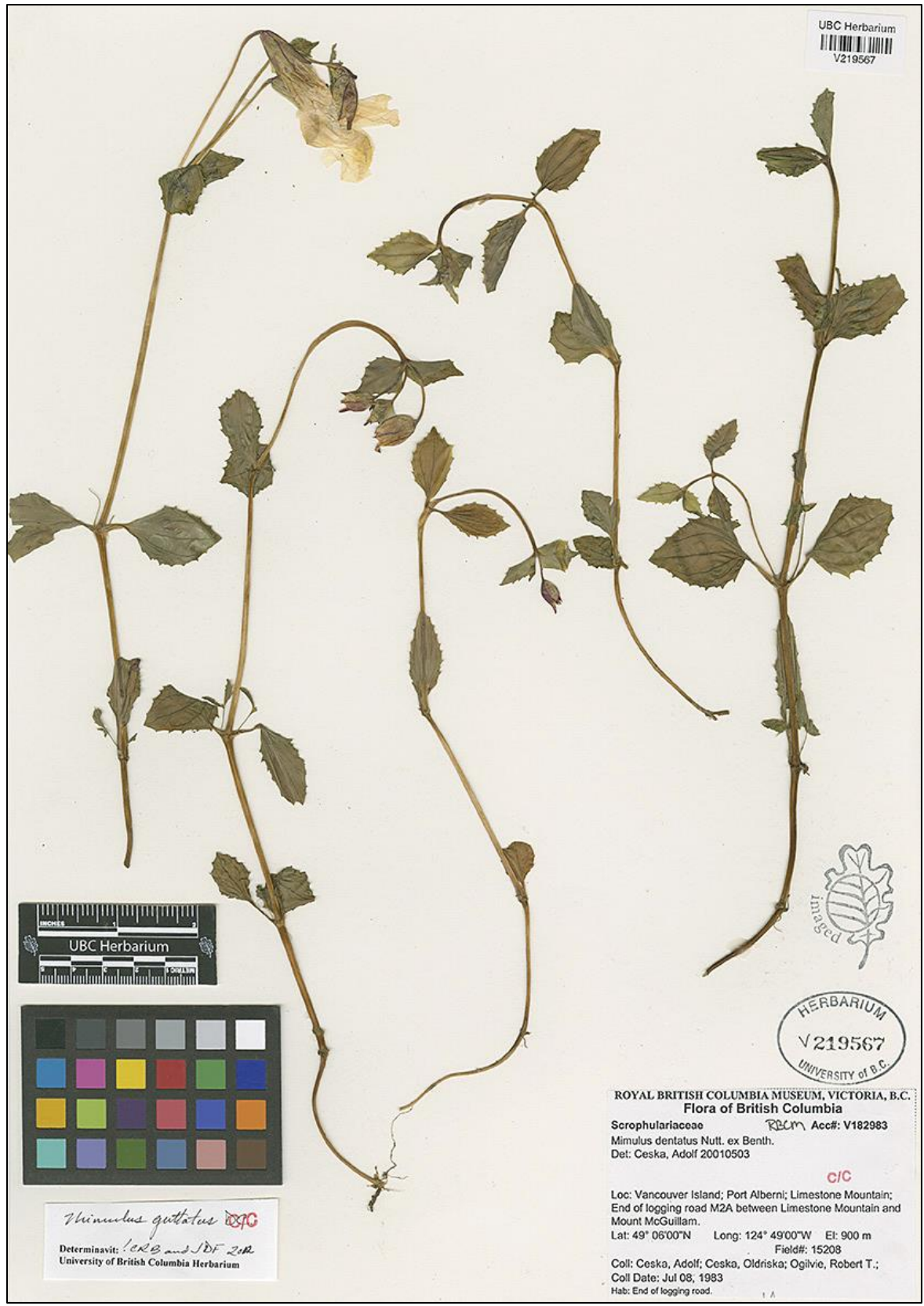
Figure 7. Erythranthe veronicifolia. Vancouver Island, Ceska et al. 15208 (UBC).