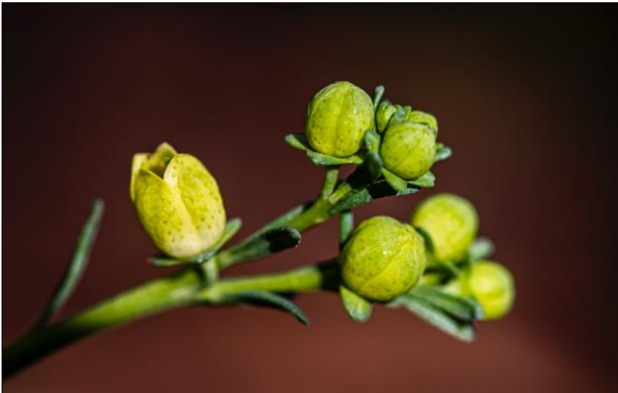
Figure 2. Thamnosma texana var. texana , central or south Texas.