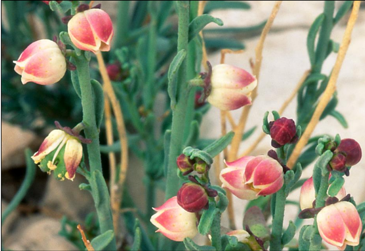
Figure 1. Thamnosma texana var. purpurea , Big Bend National Park.