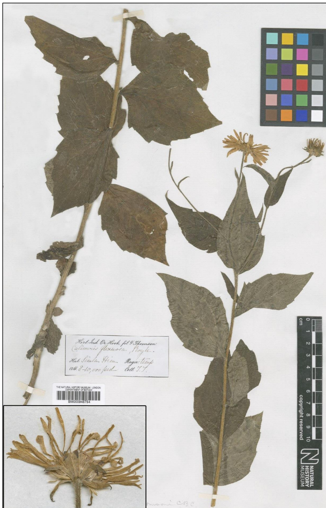
Figure 12. Cordiofontis flexuosa . Representative collection, Simlen, Himalaya, Thomson s.n. (BM).