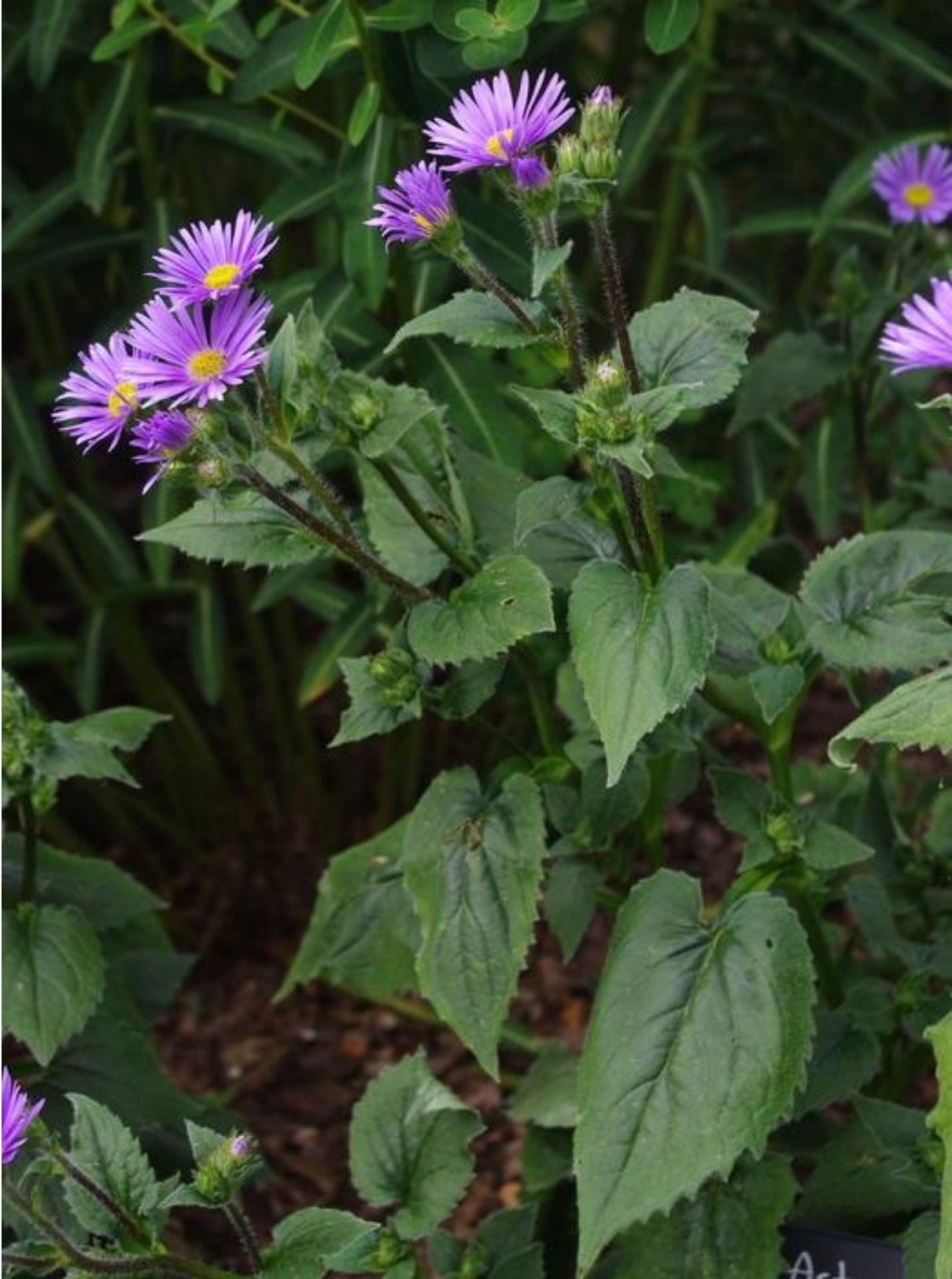
Figure 15. Cordiofontis peduncularis . Beth Chatto's Plants & Gardens (website).