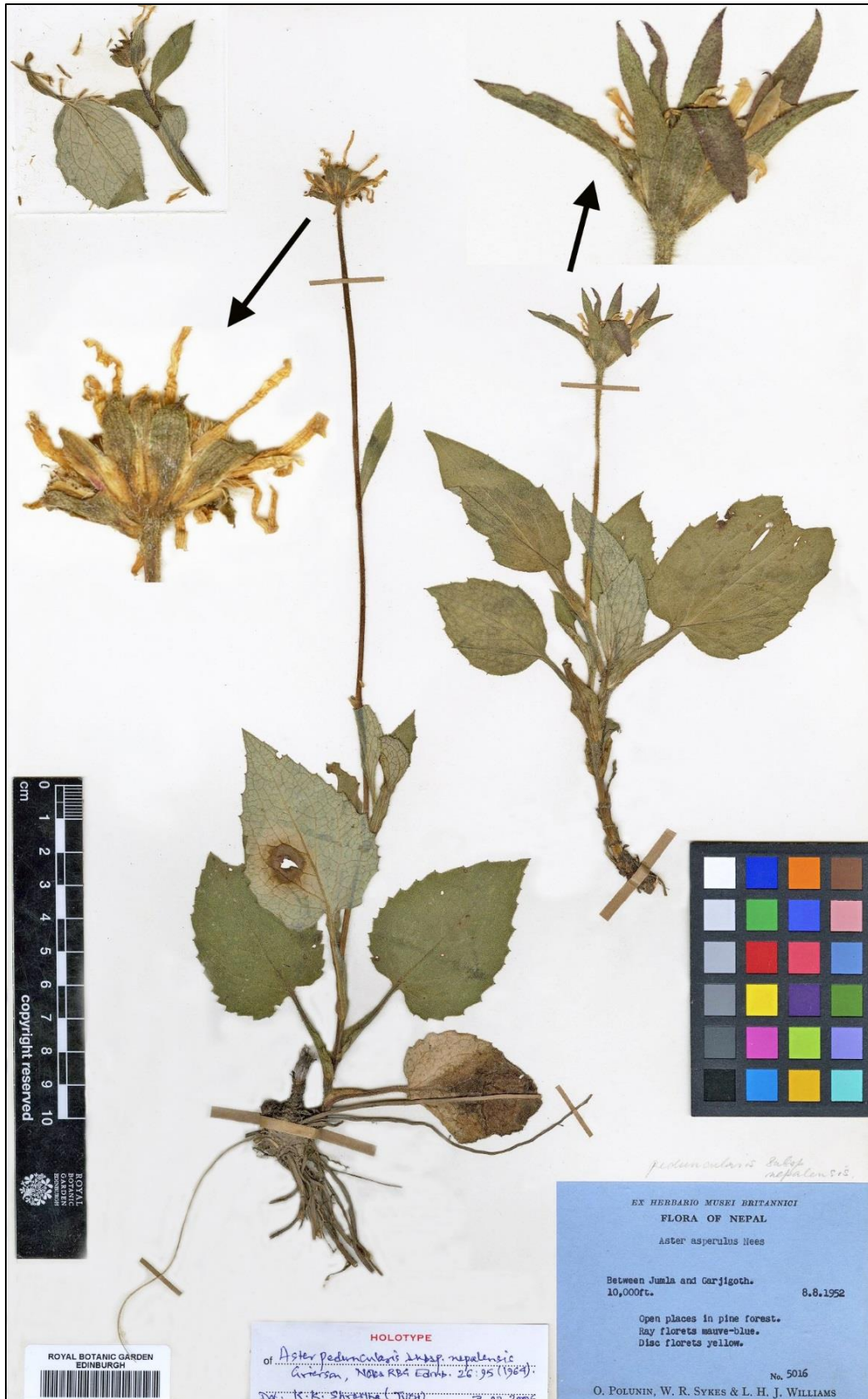
Figure 4. Cordiofontis nepalensis . Holotype (E).