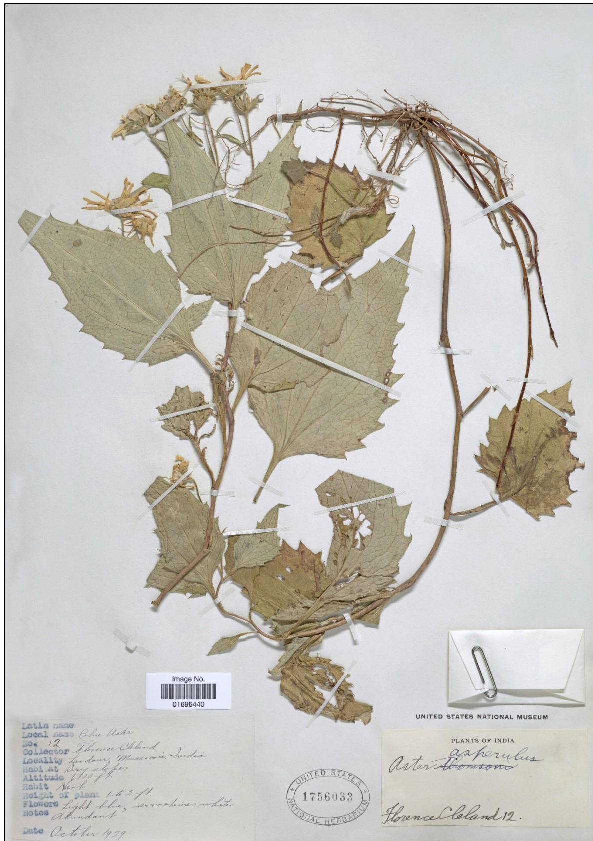
Figure 2. Cordiofontis peduncularis . Representative collection, Uttarakhand (E).