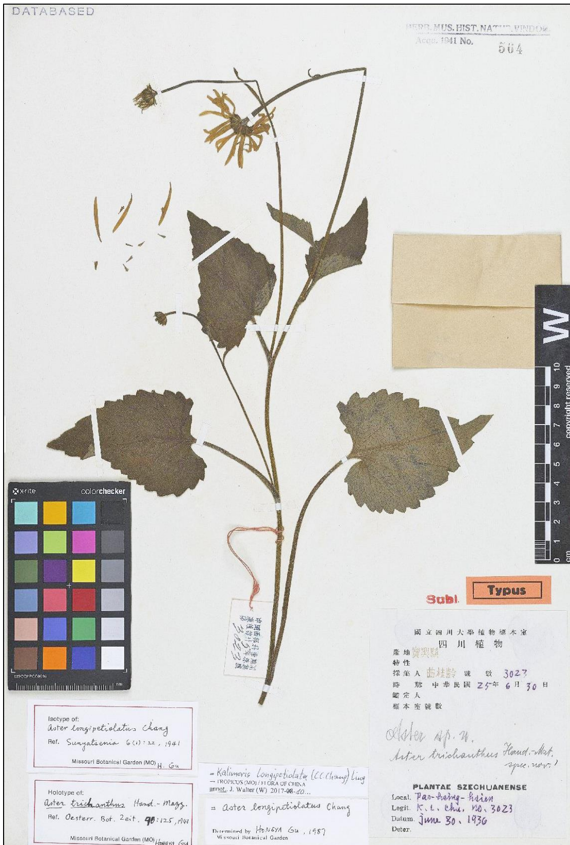
Figure 7. Cordiofontis longipetiolata . Chang 3023 (W). Holotype of Aster trichanthus and isotype of Aster longipetiolatus .