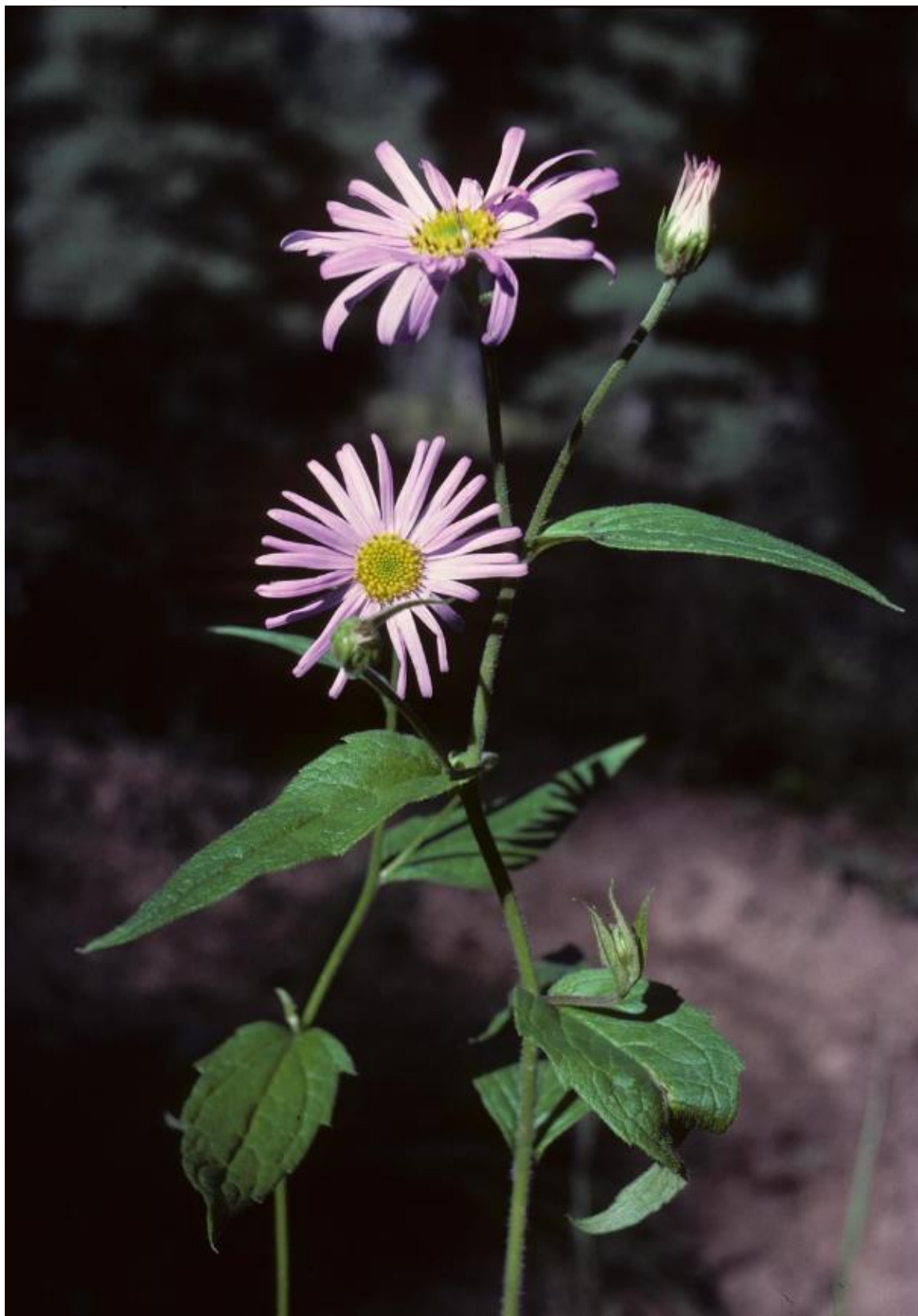
Figure 16. Cordiofontis flexuosa . Lidderwat in Jammu & Kashnmir.