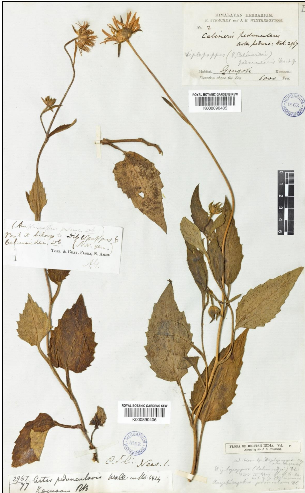
Figure 1. Cordiofontis peduncularis . Holotype of Aster peduncularis Wall. ex Nees (Wallich 2967/77, K-Wallich).