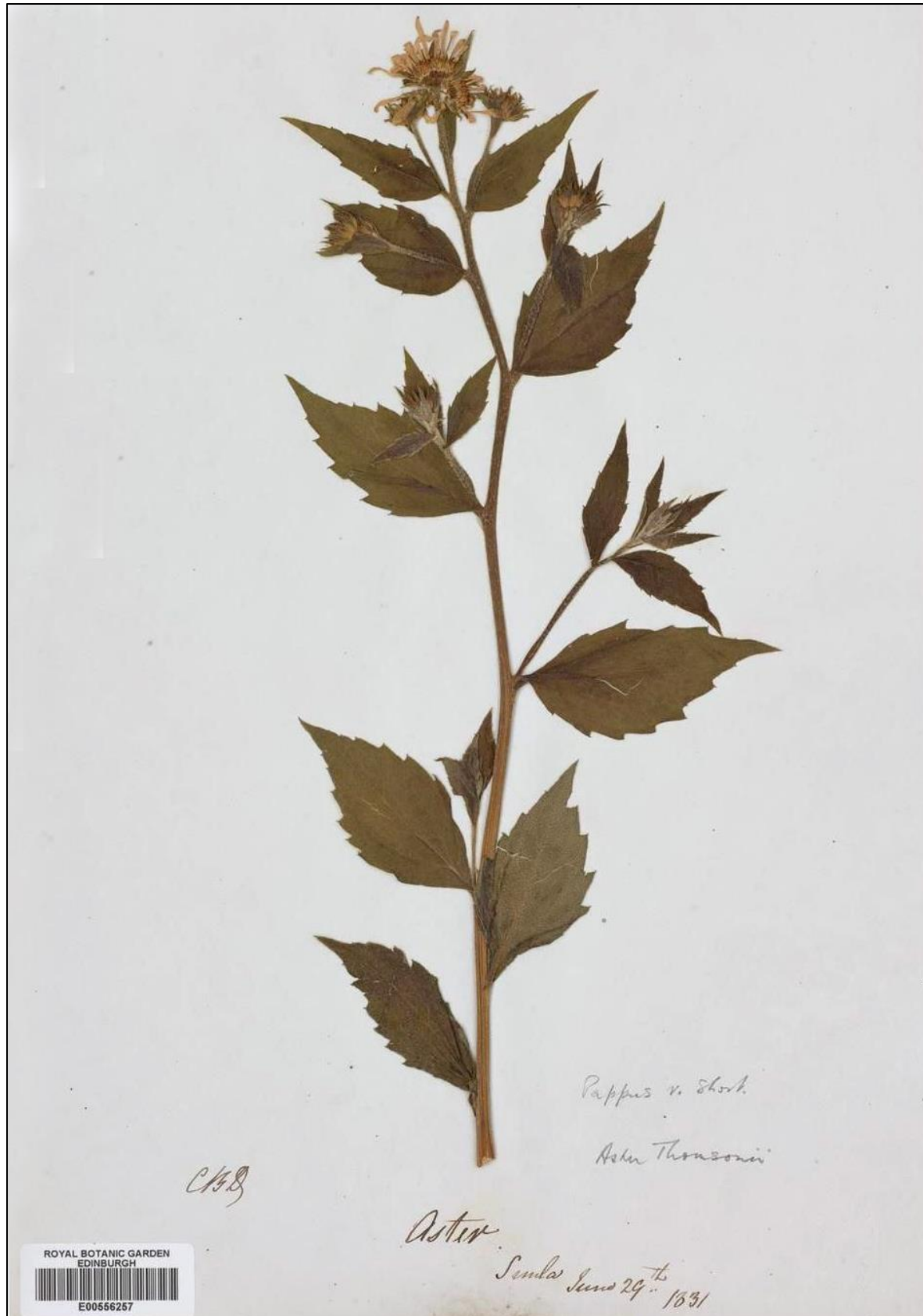
Figure 14. Cordiofontis flexuosa . Representative collection (E).