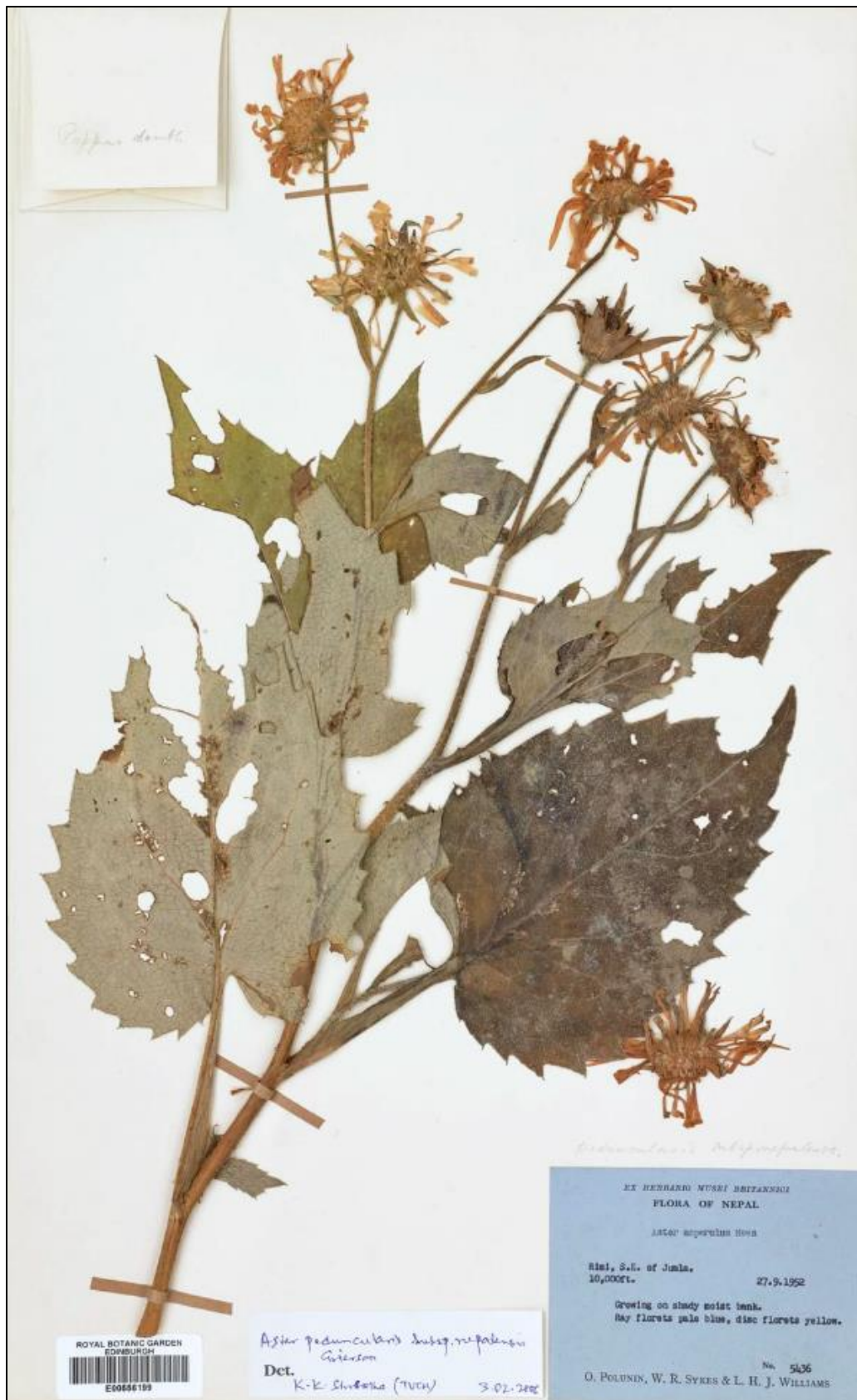
Figure 6. Cordiofontis nepalensis . Representative collection, Polunin et al. 5436 (E).