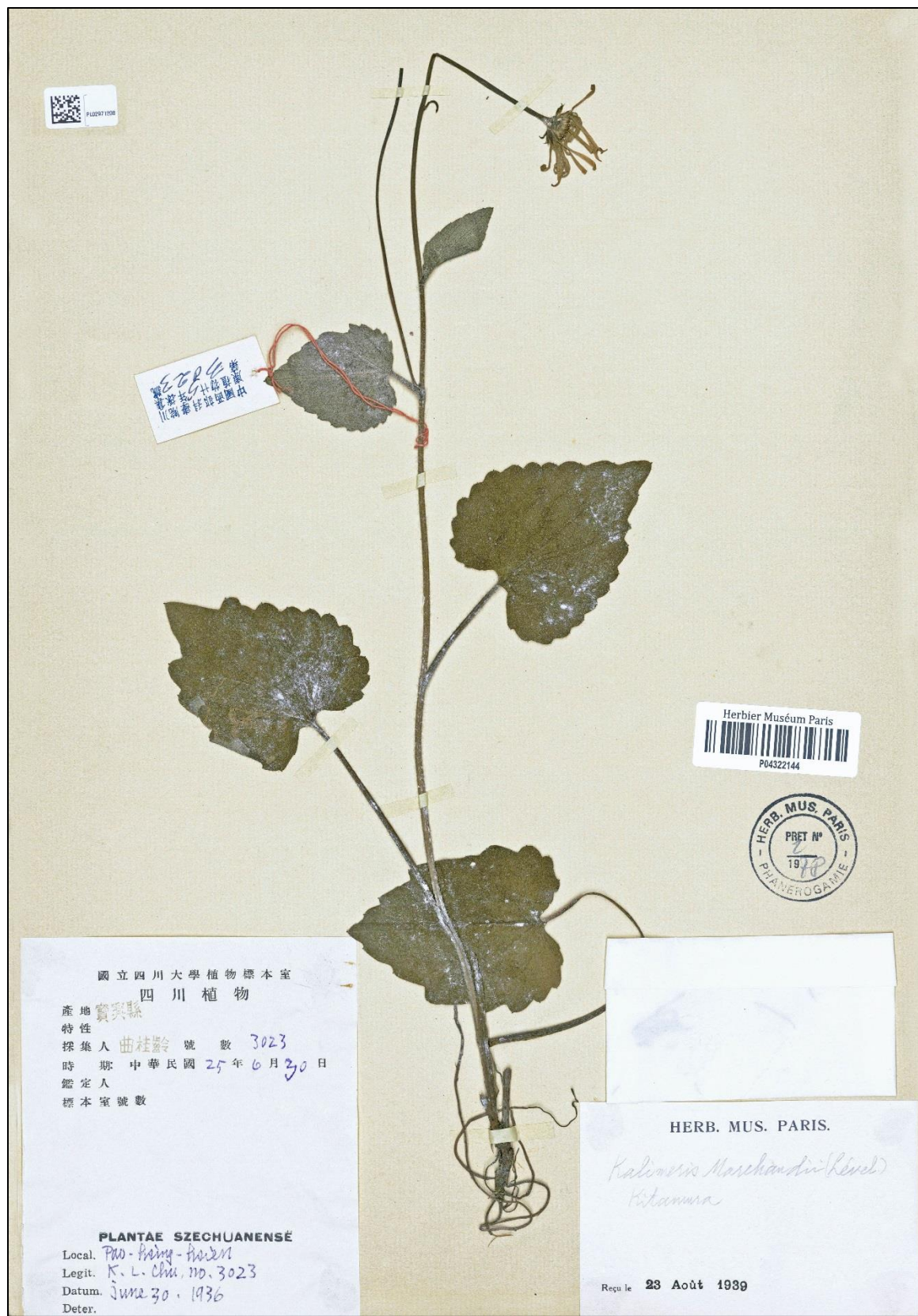
Figure 8. Cordiofontis longipetiolata . Chang 3023 (P). Isotype of Aster trichanthus and isotype of Aster longipetiolatus . Basal leaves have petioles with a dilated, clasping base.