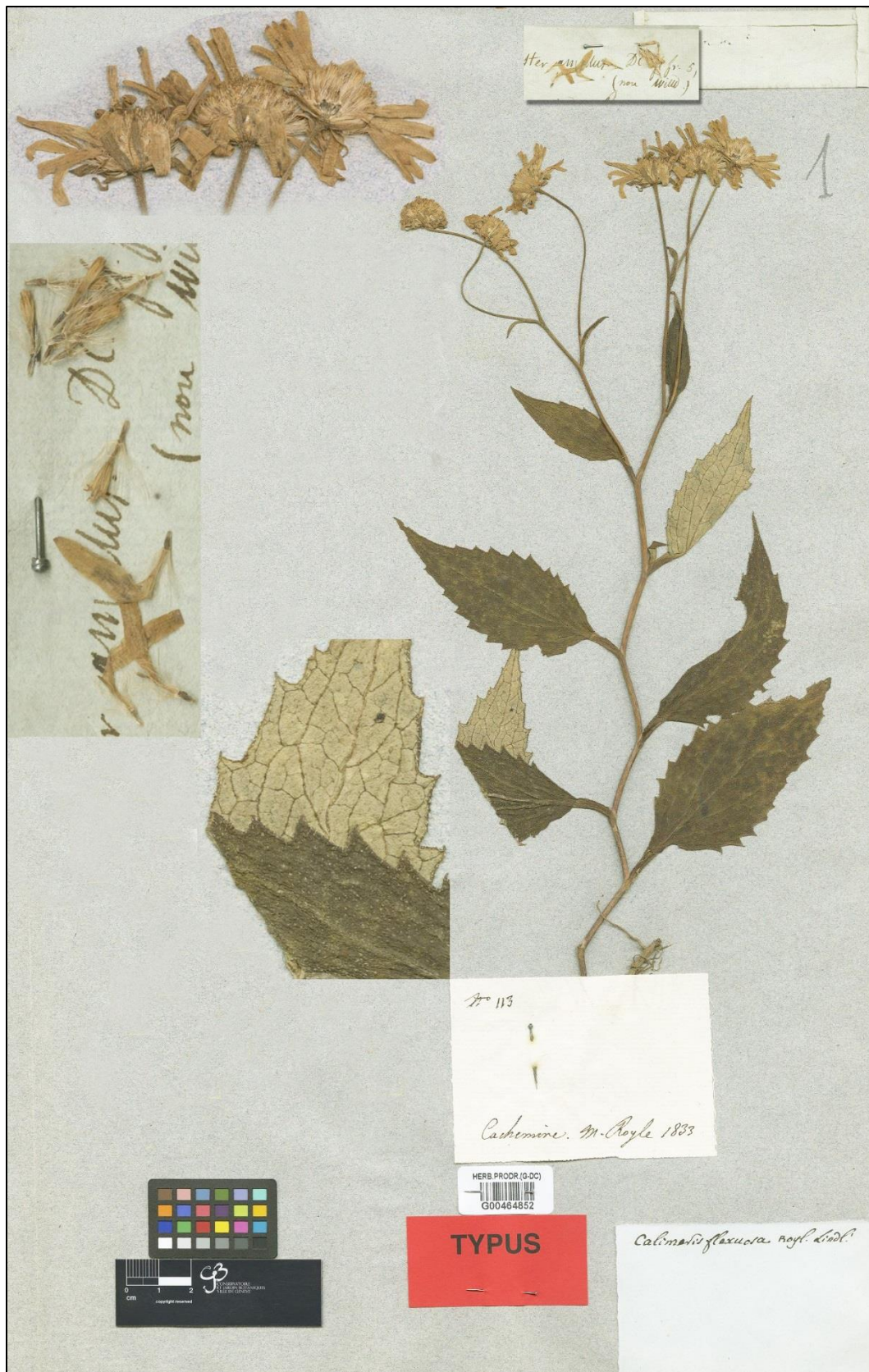
Figure 11. Cordiofontis flexuosa . Holotype, Calimeris flexuosa Royle ex Lindl. in DC. (G-DC).