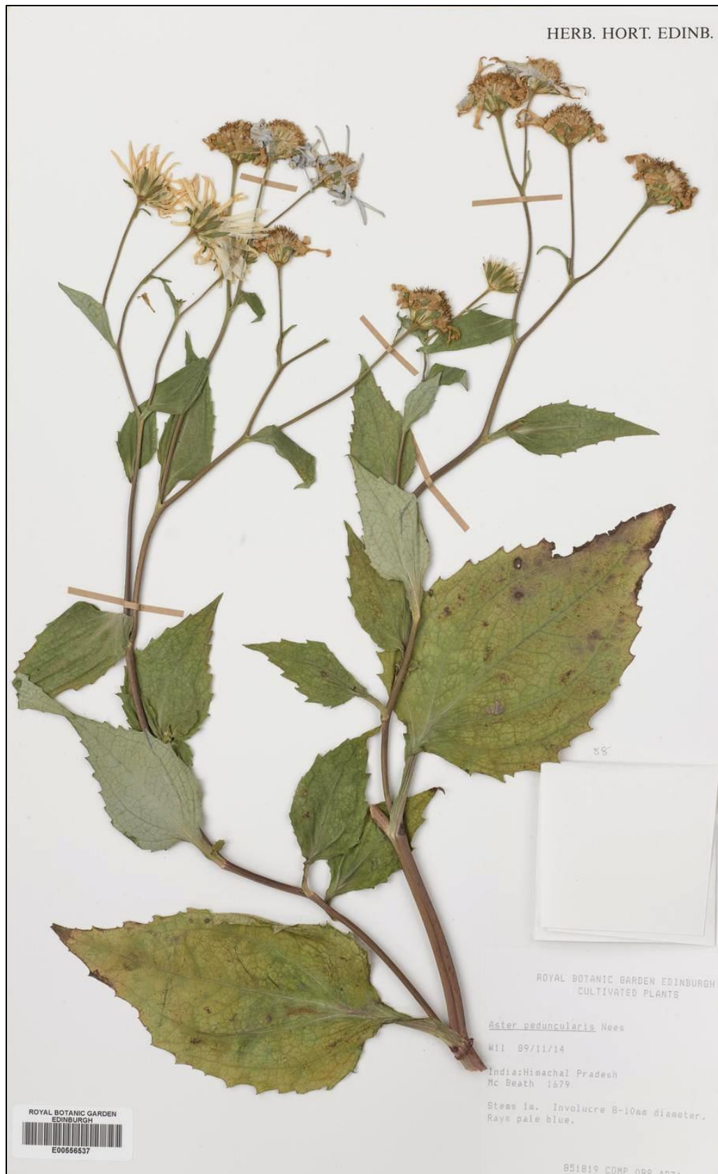
Figure 3. Cordiofontis peduncularis . Representative collection, Himachal Pradesh (E).