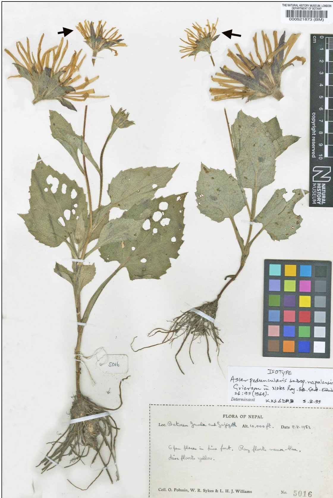
Figure 5. Cordiofontis nepalensis . Isotype (BM).