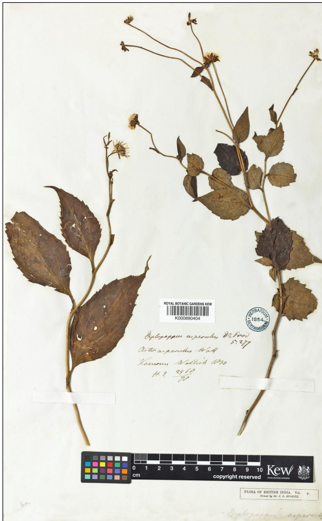
Figure 13. Cordiofontis flexuosa . Isotype of Diplopappus asperulus DC. ( Aster asperulus of Wallich, 2968/78, K-W).