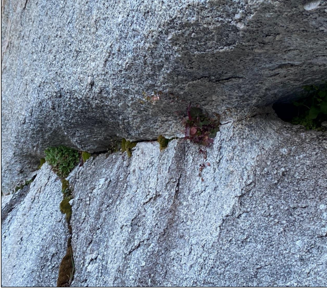
Figure 16. Erythranthe angulosa . Habitat on granite cliff face at the type locality. Photo by Matt Berger, 17 Jul 2020.