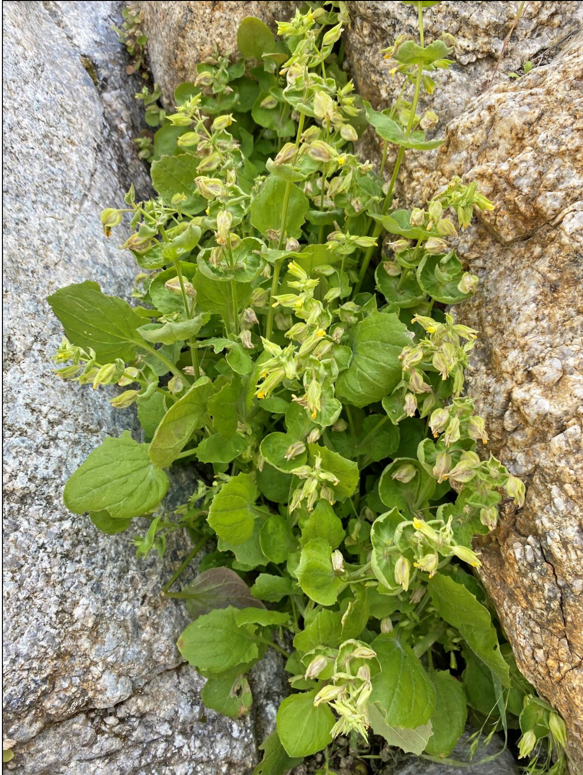
Figure 3. Erythranthe bergeri . Cluster of plants from narrow crevice in granite, showing the distinction/transition from proximal, petiolate leaves to distal, perfoliate ones.