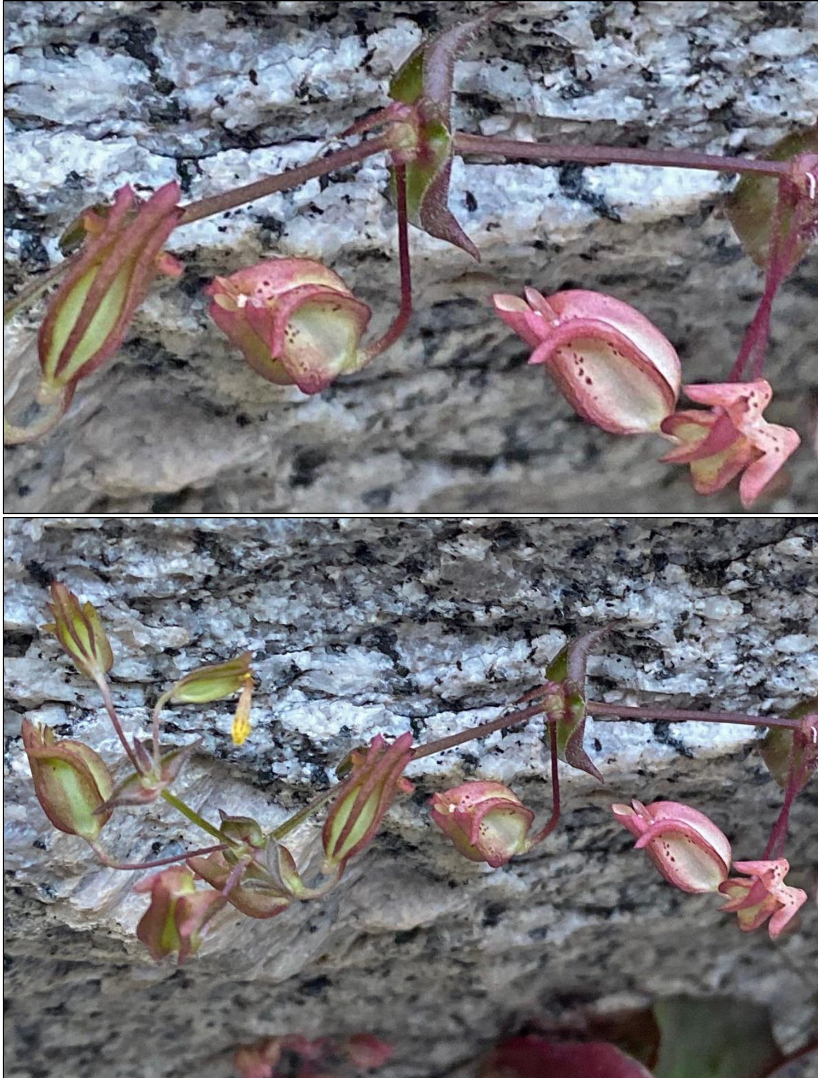
Figure 19. Erythranthe angulosa . Inflorescence from same plant as in Figure 17.