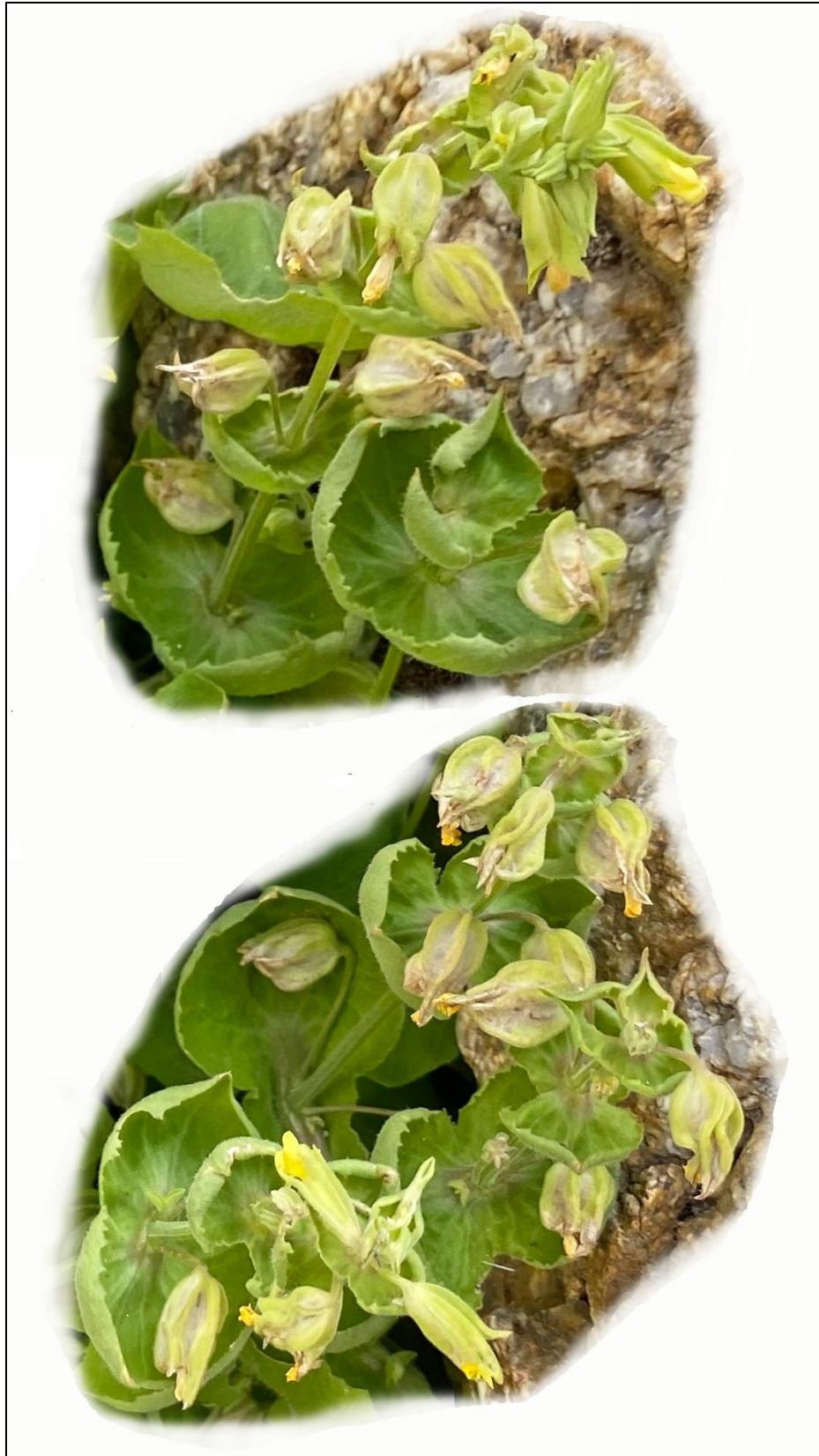
Figure 5. Erythranthe bergeri . Inflorescences and upper cauline leaves, showing the cuplike structures formed by distal connate-perfoliate leaves. Details from Figure 3.