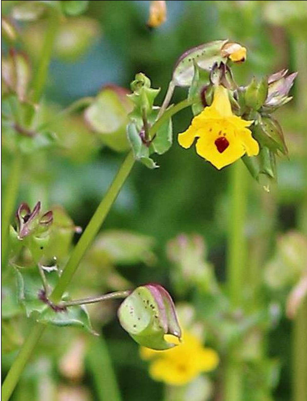
Figure 13. Erythranthe nasuta , Fresno Co., California, June 2017. Distal leaves are epetiolate with bases contiguous but not connate.