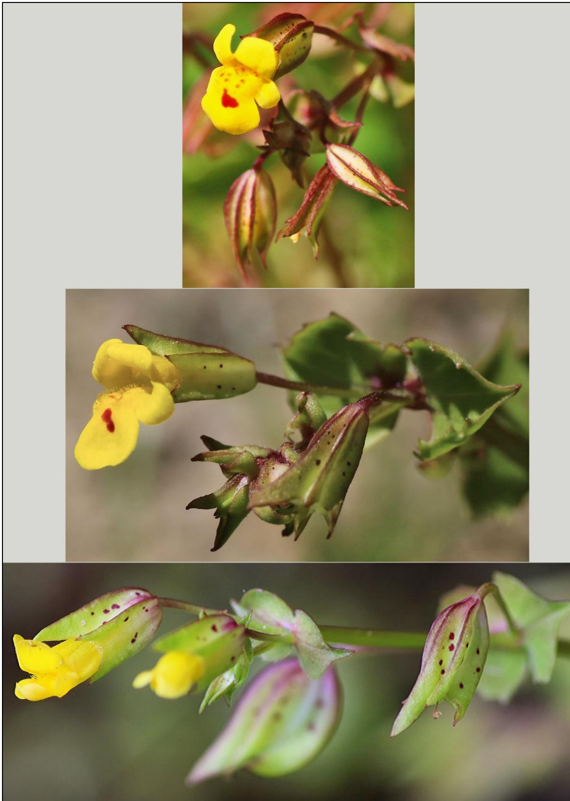
Figure 14. Erythranthe nasuta . Top and middle : Monterey Co., California, April 2019. Bottom : El Dorado Co., California, May 2019. Variation in flower morphology.