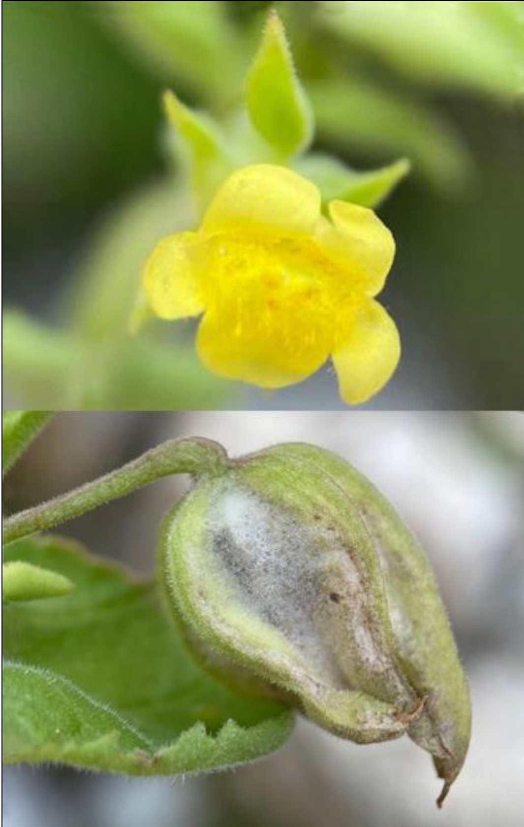
Figure 9. Erythranthe bergeri . Corolla and mature calyx.