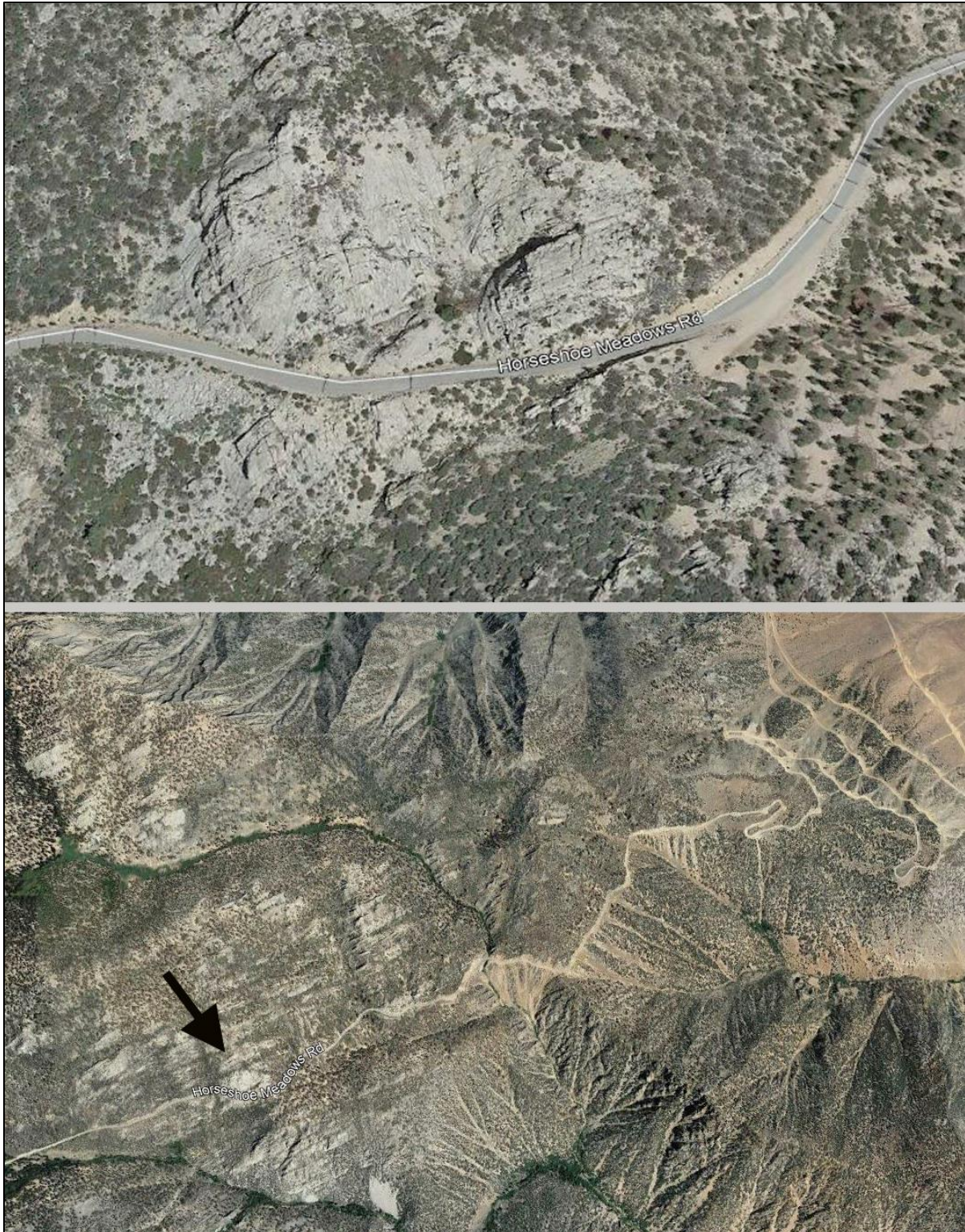
Figure 15. Locality of Erythranthe angulosa . Top : Granite cliffs and faces at the type locality along Horseshoe Meadows Road. Bottom : Arrow points to the area of bare, exposed granite pictured in the upper photo.