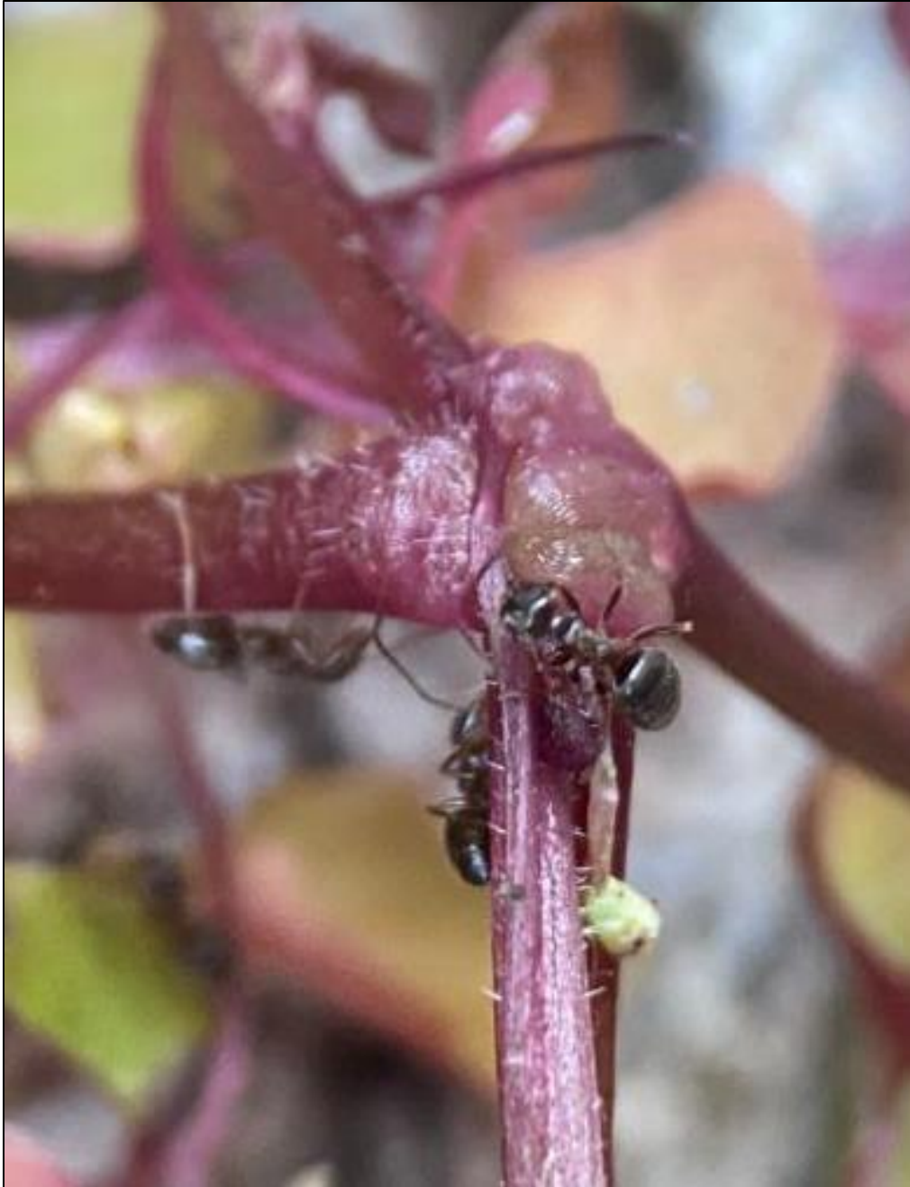
Figure 24. Erythranthe angulosa . Swollen axillary organs at stem and peduncle bases.