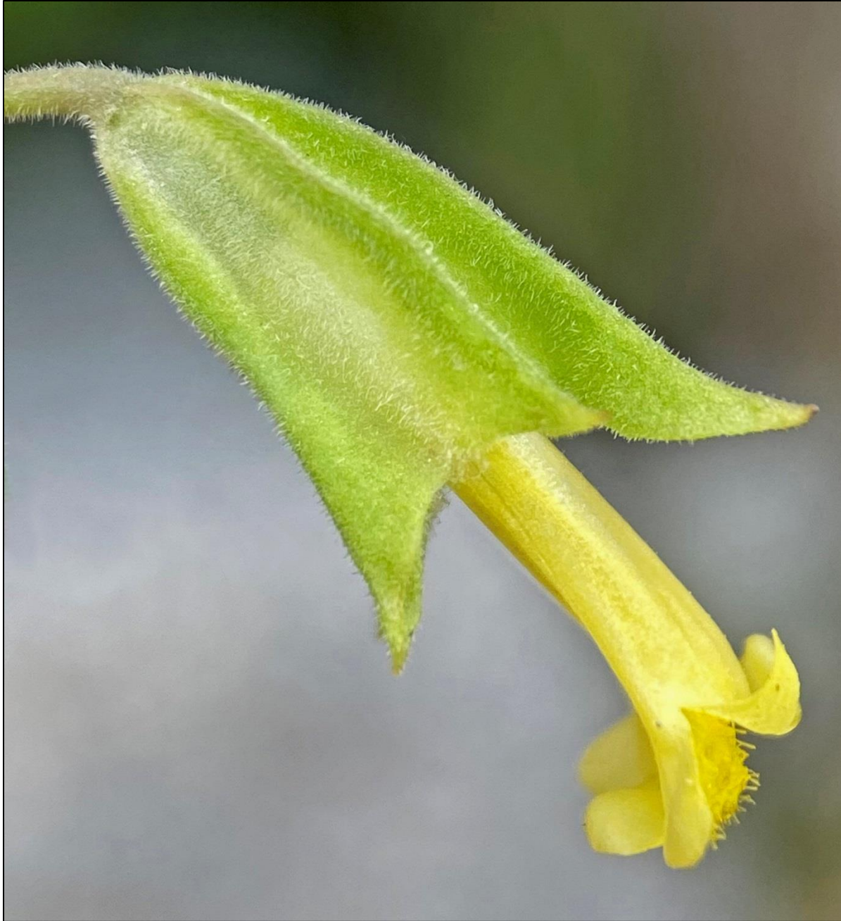
Figure 8. Erythranthe bergeri . Calyx and corolla. Photos in Figs. 6 and 9 show corollas with a broader tube-throat and faint red markings on its base.