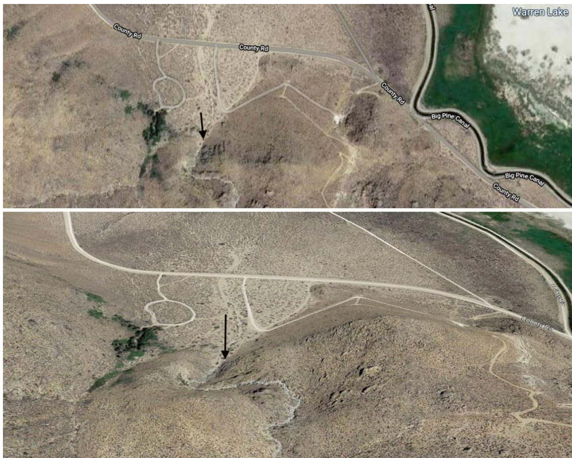
Figure 1. Locality of Erythranthe bergeri . Cracks and fissures of granite outcrop near mouth of large, seasonally wet wash, northwest of Big Pine, Inyo County. Google Earth and Google Maps.

Among the species of subgroup E, the closest evolutionary relative of Erythranthe bergeri is hypothesized here to be E. nasuta , emphasizing their 4-angled stems and overlap in vestiture. Erythranthe nasuta does not produce the pervasively hirtellous vestiture characteristic of E. bergeri but the adaxial leaf surfaces usually are hirtellous and stems and calyces are variably so (between populations). Hirtellous vestiture also is produced by E. microphylla and especially variants of E. guttata sensu stricto.