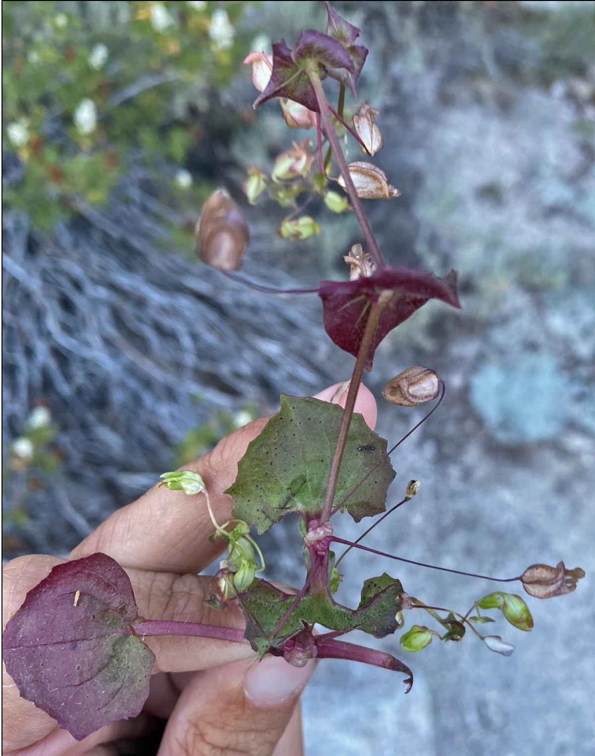
Figure 21. Erythranthe angulosa . Ant on green adaxial leaf surface. This branch comprises the holotype: Photo by Matt Berger.