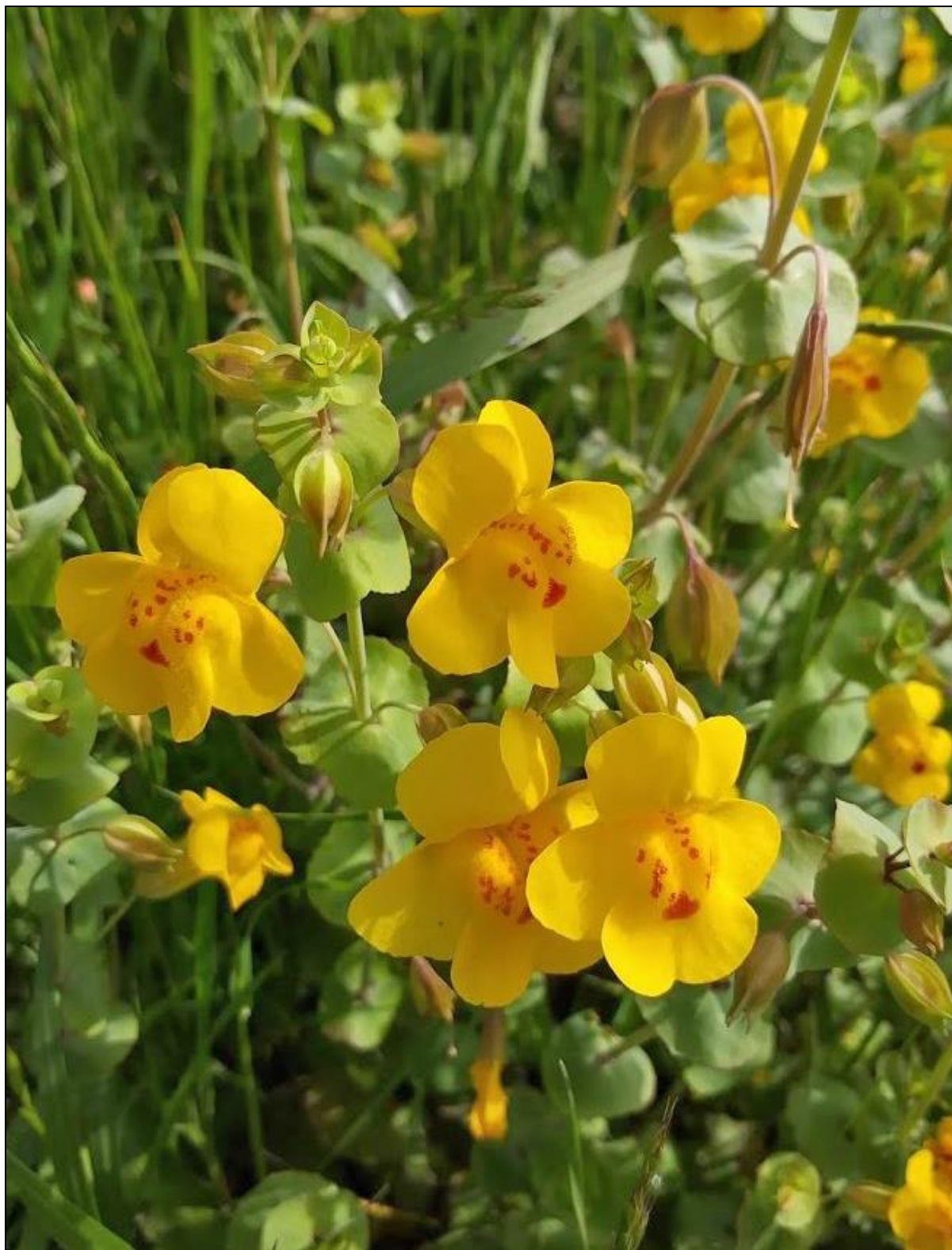
Figure 10. Erythranthe glaucescens , Butte County, California, May 2018. The connate-perfoliate leaves probably developed independently of those of E. bergeri .