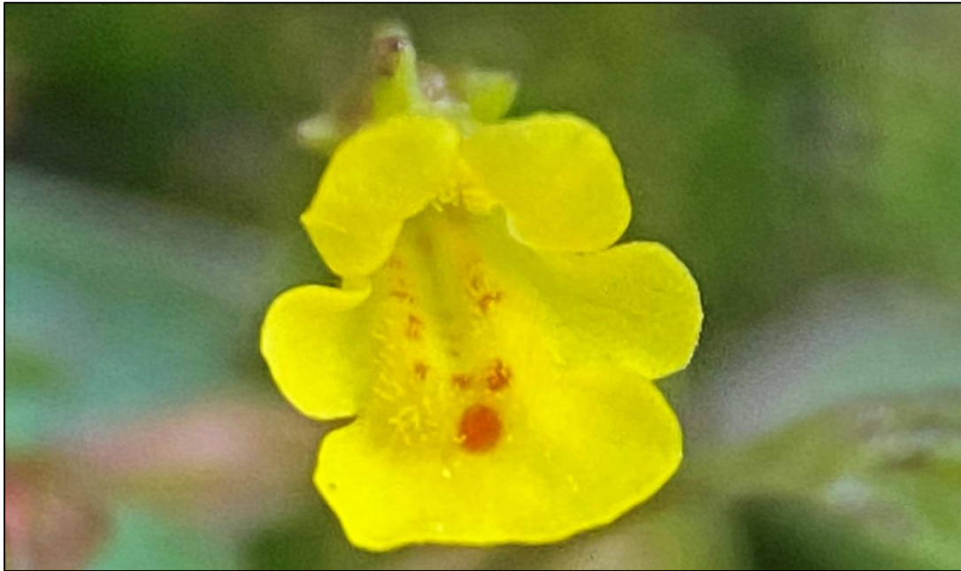
Figure 17. Erythranthe angulosa . Corolla.