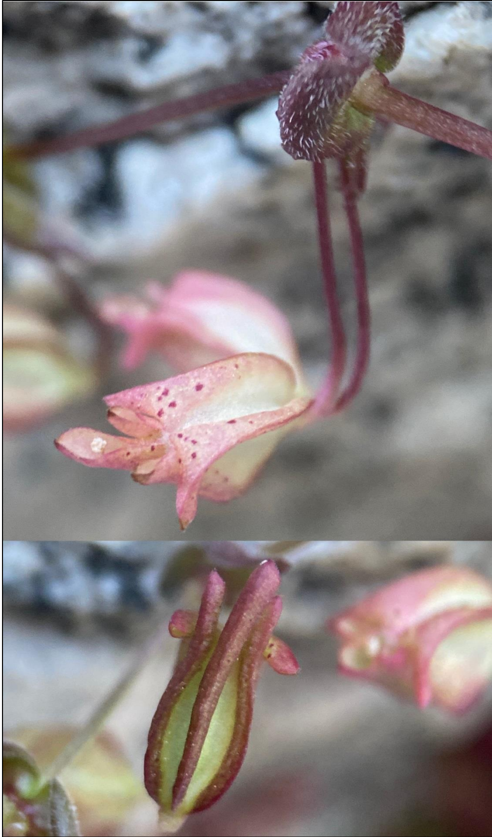
Figure 20. Erythranthe angulosa . Calyces after corollas shed.