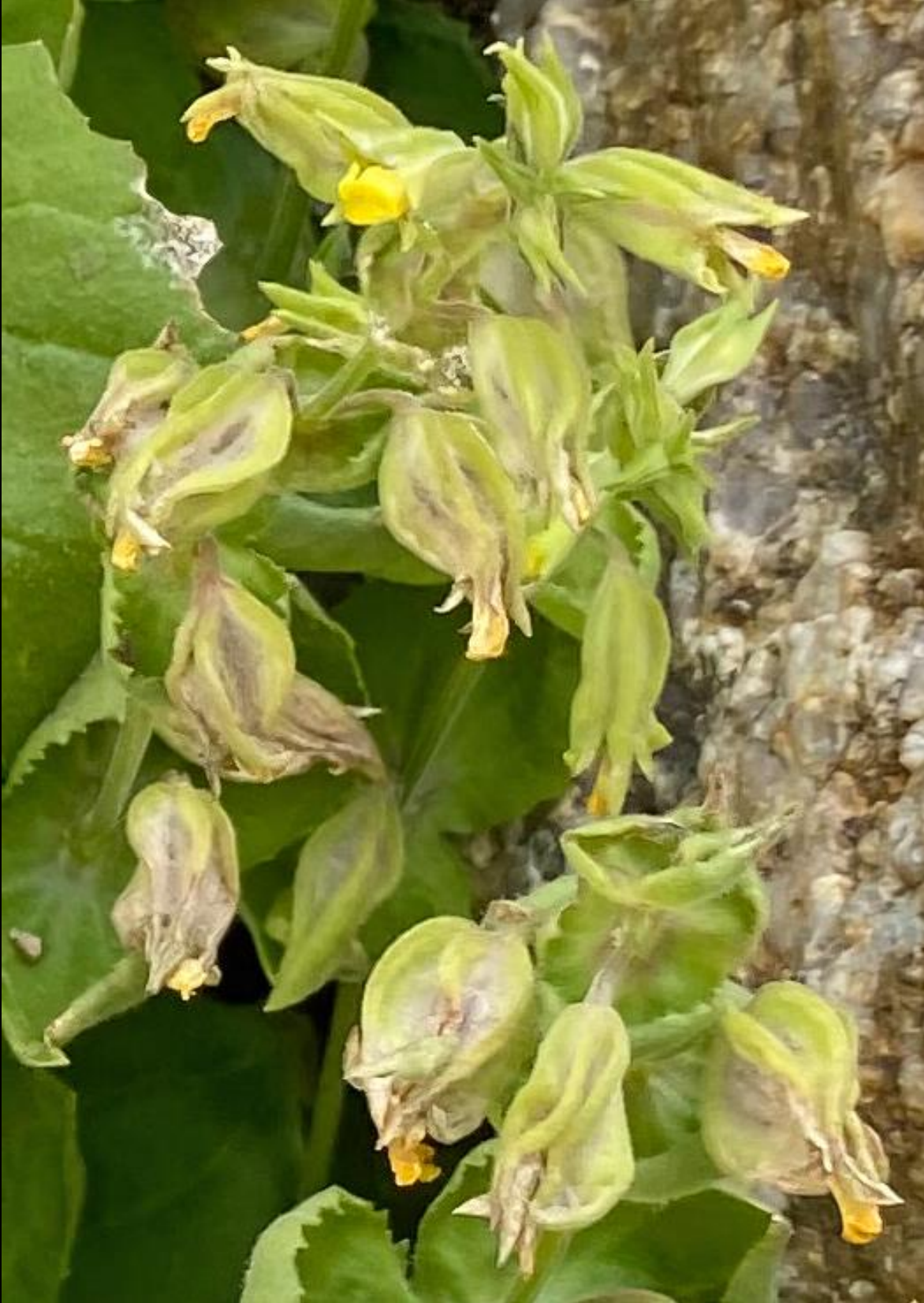
Figure 7. Erythranthe bergeri . Inflorescence of mostly post-anthesis flowers, showing calyces with raised-thickened angles and membranous-transparent inter-ridge areas. Detail from Figure 3.