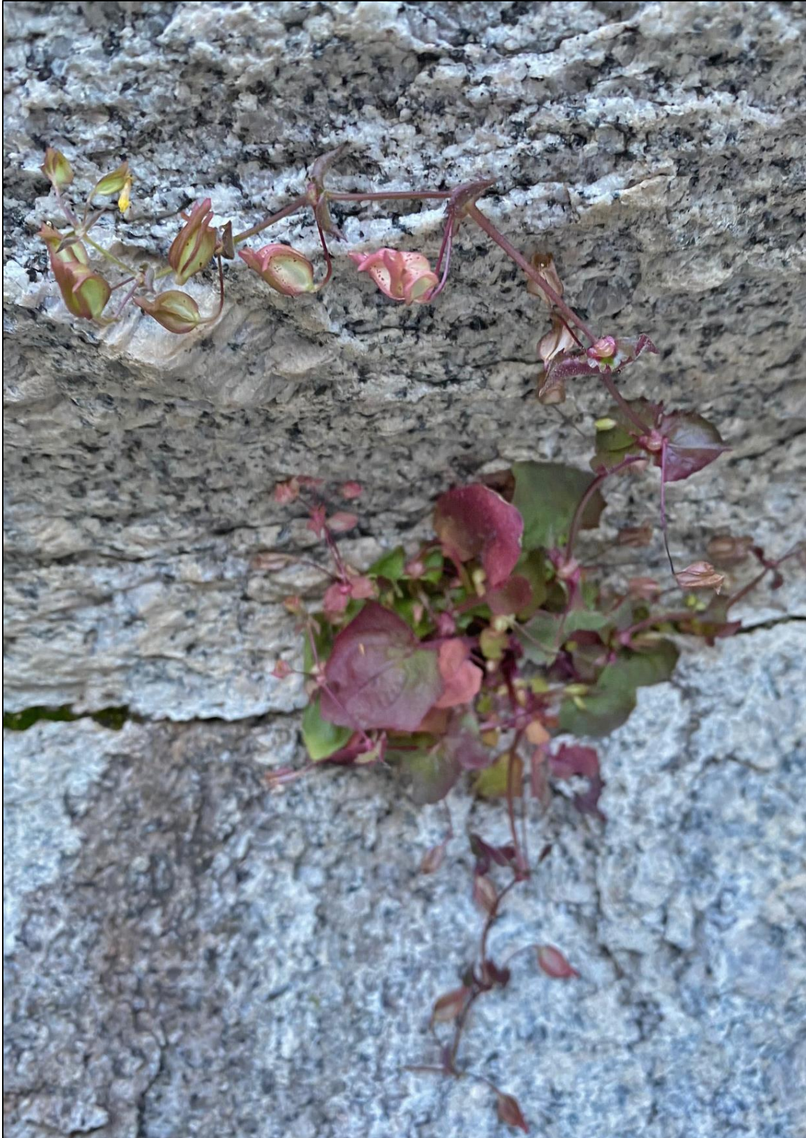
Figure 18. Erythranthe angulosa . Stems and leaves more or less appressed against the rock face.