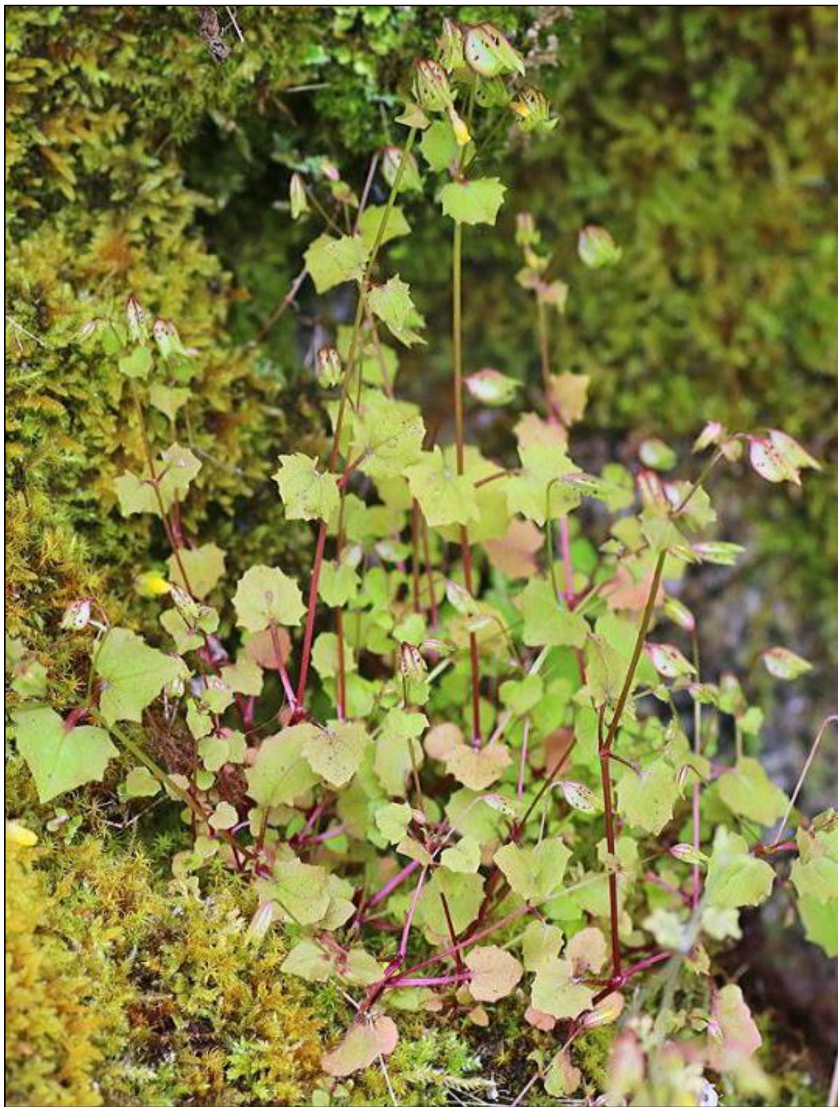
Figure 12. Erythranthe nasuta , El Dorado Co., California, May 2019.