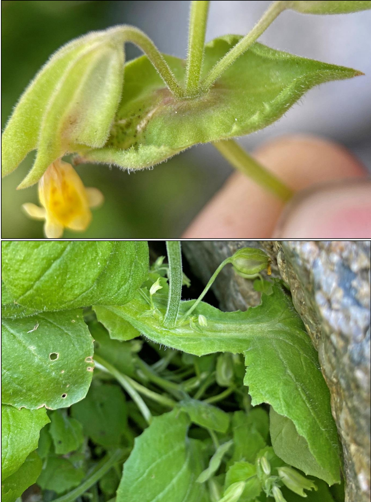
Figure 6. Erythranthe bergeri . Top : Upper midcauline leaves. Bottom : lower midcauline leaves, with depauperate branches and flowers from axils, connate-perfoliate by petiole-like base.