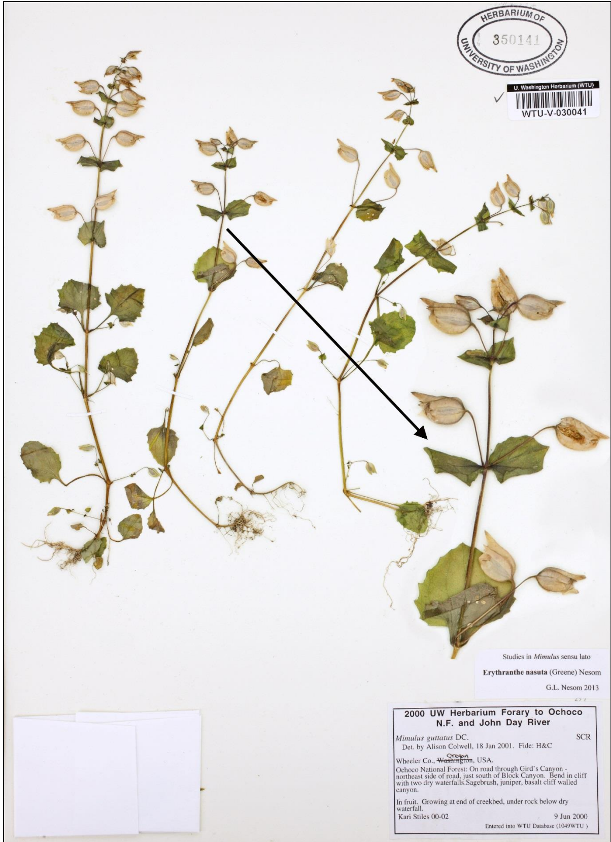
Figure 11. Erythranthe nasuta , Wheeler Co., Oregon. Stiles 00-02 (WTU).