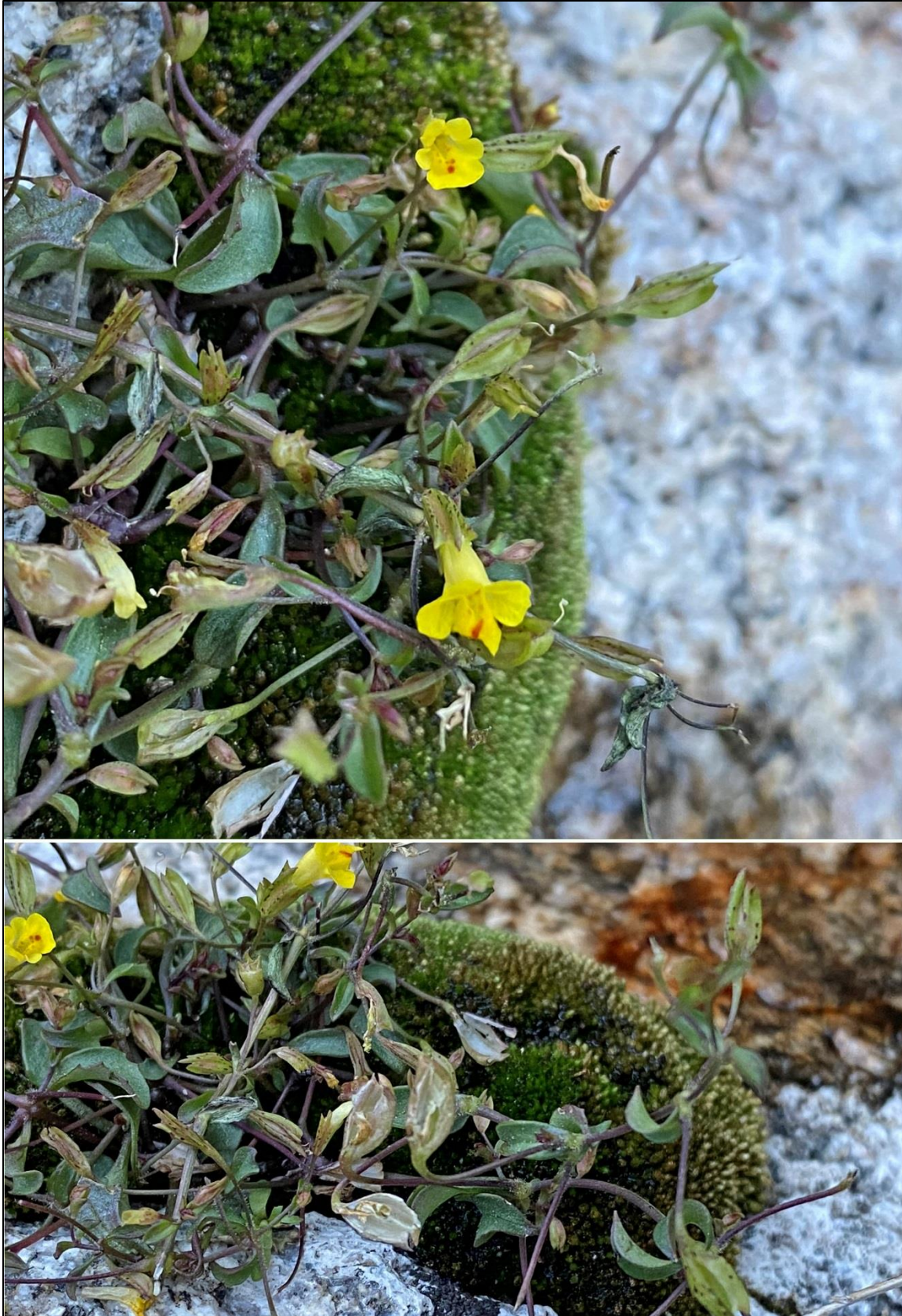
Figure 22. Erythranthe angulosa . Fruit predation — calyces also partially eaten away.