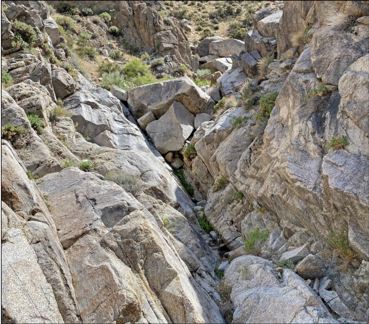
Figure 2. Erythranthe bergeri . Habitat on faces of broad granite fissure at the type locality. 10 May 2020.