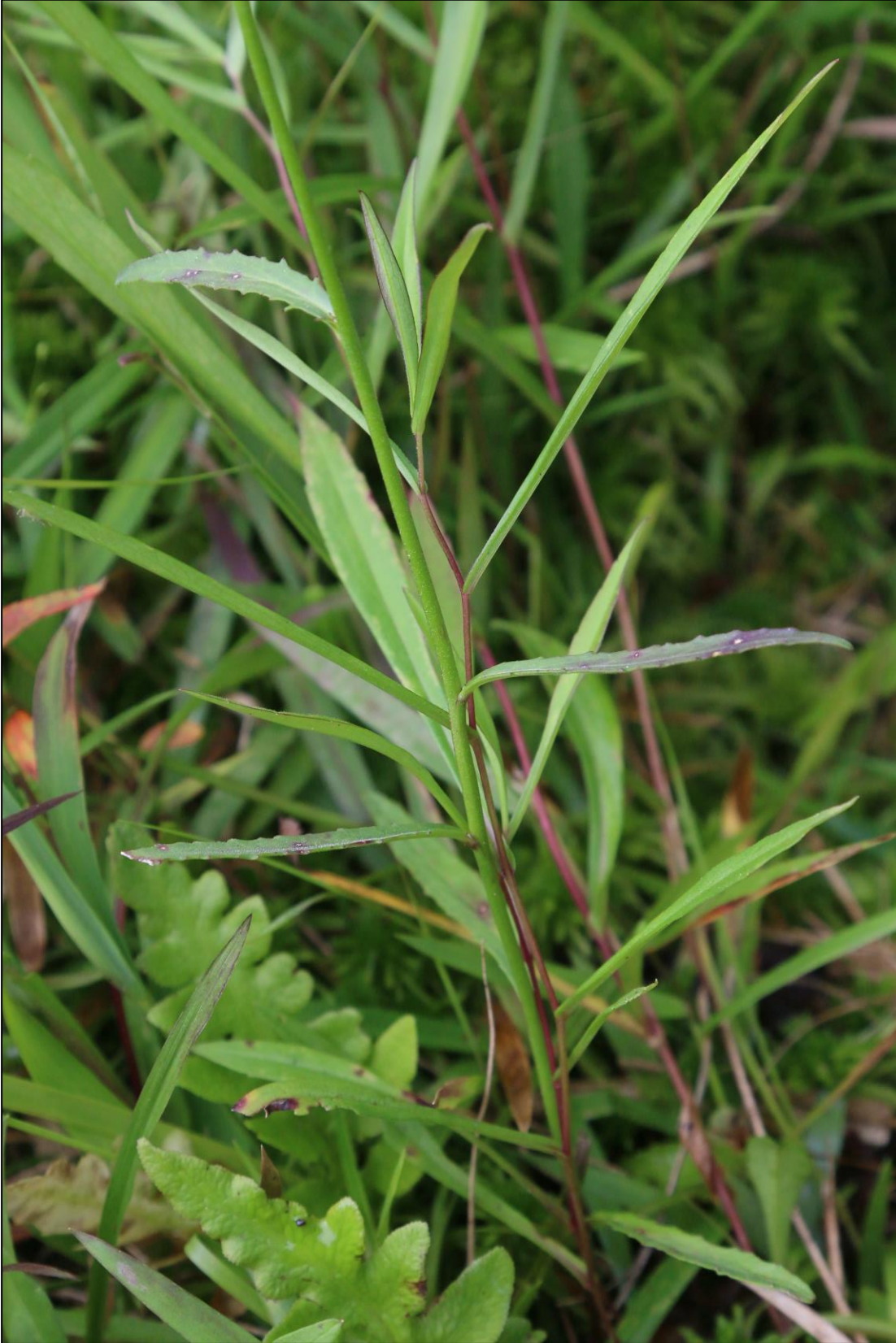
Figure 2. Lobelia batsonii , leaves and lower stem. Moore Co., North Carolina, September 2020.