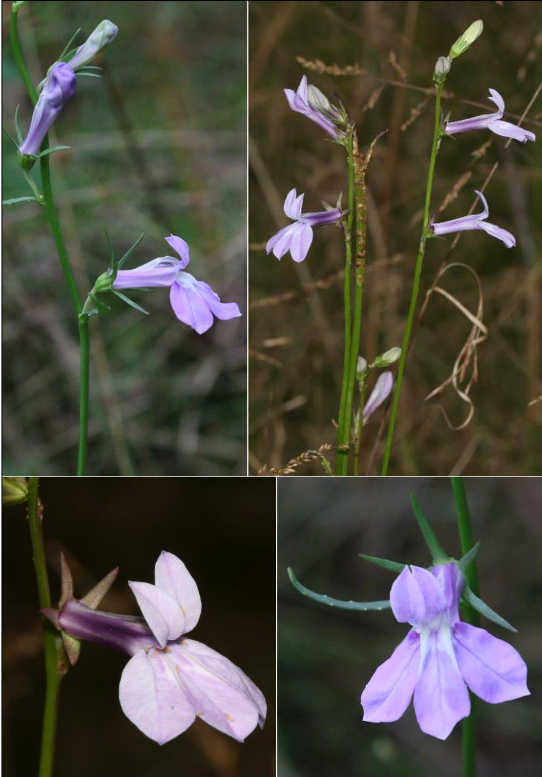
Figure 4. Top (left) Lobelia batsonii — short corolla tube, photo by Sorrie; (right) Lobelia glandulosa — long corolla tube, photo by J. Pippen. Bottom (left) Lobelia batsonii — lack of pubescence at corolla mouth, photo by Sorrie; (right) Lobelia glandulosa — pubescence extending out from corolla mouth, photo by J. Pippen.