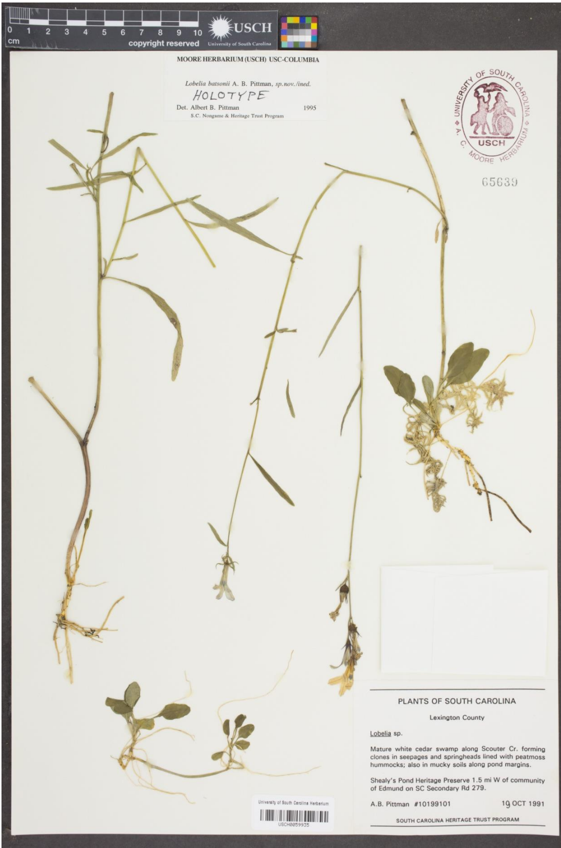
Figure 1. Lobelia batsonii . Holotype, Pittman 10199101 (USCH).