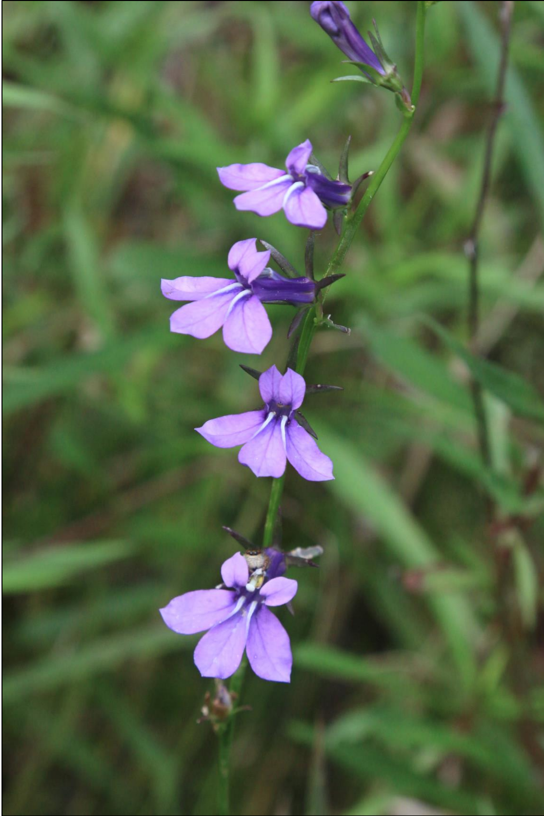
Figure 3. Lobelia batsonii inflorescence, Moore Co., North Carolina, September 2020.