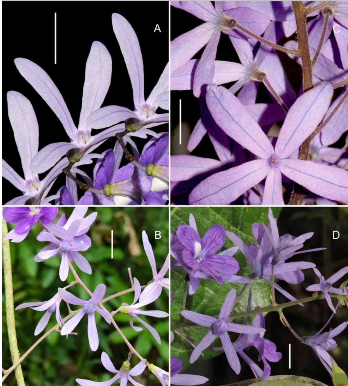
Figure 3. Comparison of live material. A, B, P. aspera ; C, D, P. volubilis . A, B from Aguilar 17367; C from Hammel 27784 (cult.), D from Hammel 27118 (wild). Scale bars = 10 mm.

Note on the transfer of Xolocotzia asperifolia Miranda to Petrea . When Christenhusz & Byng (2018) transferred Xolocotzia asperifolia (an erect shrub or small tree of relatively xeric forests of Chiapas Mexico, Honduras, and Nicaragua) to Petrea they unnecessarily created the new name P. xolocotzia under the assumption that “ Petrea asperifolia Brongn.” was blocking a direct transfer. However, the latter is nothing but a herbarium name, cited in synonymy by Moldenke (1938, p. 161) under P. bracteata Steud. (see Art. 36. 1, Turland et al. 2018); it was never published by Brongniart, let alone accepted or published as a distinct species by Moldenke nor anyone else since. As such it does not block the following transfer.